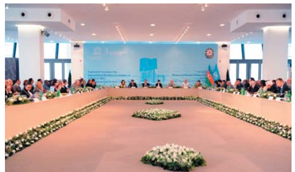
Eighteenth Session of the International Bioethics Committee of UNESCO (IBC), Baku, 2011

Baku hosted the 18 th (ordinary) session of the International Bioethics Committee (IBC) of UNESCO in 2011, which generated keen interest of local communities and representatives of other UNESCO member-states and foreign partners. The forum of such level got well-deserved recognition of international organizations to assess positive steps and contribution of Azerbaijan in the development of bioethics and medical law in the country. The event provided a new impetus to enhancing bioethical education of professionals, with the UNESCO Chair in Bioethics playing a key role in the process. Following-up on the IBC session and based on the Memorandum of Understanding signed between UNESCO and Baku State University, the UNESCO Bioethics Core Curriculum was introduced to the university's 2011–2012 educational programme to promote bioethics and human rights protection in the national higher education system.