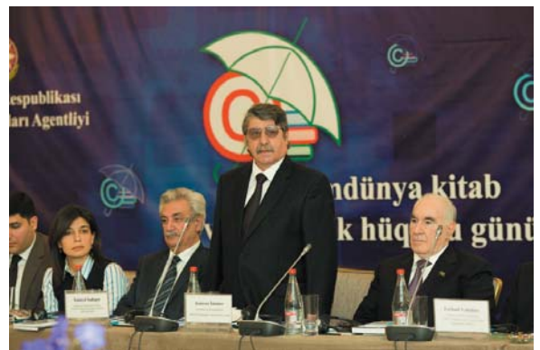
International Symposium on UNESCO World Book and Copyright Day 2013

To foster freedom of the press and freedom of expression, Azerbaijan marked the World Press Freedom Day in 2011 by holding a roundtable