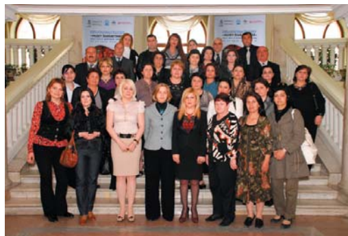
The national thematic capacity-building UNESCO/ICOM training for CIS countries

perspectives of dialogue and mutual understanding between Christianity and Islam, the monograph is aimed at elaborating fundamental principles of responsible and constructive intercultural dialogue, taking into consideration different spiritual and religious traditions existing in the contemporary world, especially those rooted in the age-old world religions. By the initiative of the President of the Republic of Azerbaijan Mr. Ilham Aliyev, the Government