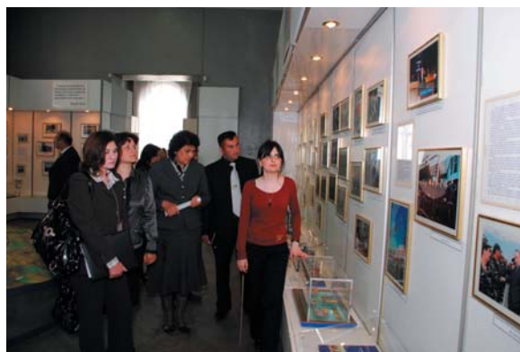
The national thematic capacity-building UNESCO/ICOM training for CIS countries

Culture: UNESCO will particularly focus on strengthening national capacities to safeguard the tangible and intangible cultural heritage in the context of the efficient implementation of the UNESCO conventions and develop cultural and creative industries to underscore culture's key role for sustainable development. Special significance will also be attached to promoting cultural diversity and intercultural dialogue, particularly through supporting arts education and the educational role of museums. Efforts will be geared towards increasing capacity