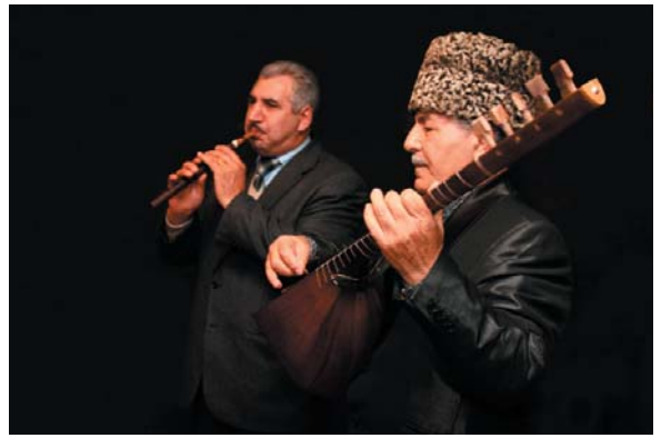
“Art of Azerbaijani Ashiq” inscribed on the Representative List of the Intangible Cultural Heritage of Humanity in 2009

Tar (2012), the Traditional art of Azerbaijani carpet weaving in the Republic of Azerbaijan (2010), the Art of Azerbaijani Ashiq (2009), Novruz, Nowrouz, Nooruz, Navruz, Nauroz, Nevruz (Azerbaijan – India – Islamic Republic of Iran – Kyrgyzstan – Pakistan – Turkey – Uzbekistan) (2009), and Azerbaijani Mugham (2008) have all been inscribed on the UNESCO Representative List of Intangible Cultural Heritage of Humanity. The National Commission of the Republic of Azerbaijan for UNESCO makes great efforts to actively promote the living heritage in Azerbaijan. In particular, through opening the International Mugham Center in 2008 and organizing annually in Baku International Mugham Festivals, supporting the production of the «Novruz in Azerbaijan» film in 2012, opening of the Carpet Museum in 2013.