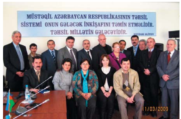
Seminar of the national experts on TVET

UNESCO's cooperation with Azerbaijan in the education field is aligned with the 10-year strategy (2003–2013) to reform the compulsory secondary education system and adapt technical and vocational training and education (TVET) to the needs of the fast-evolving market economy. TVET policies and methodologies, including textbooks on hospitality and tourism and on ICT, have been developed under the project «Revitalising TVET in Azerbaijan» supported by UNESCO, the Heydar Aliyev Foundation and the governments of Azerbaijan and Japan.