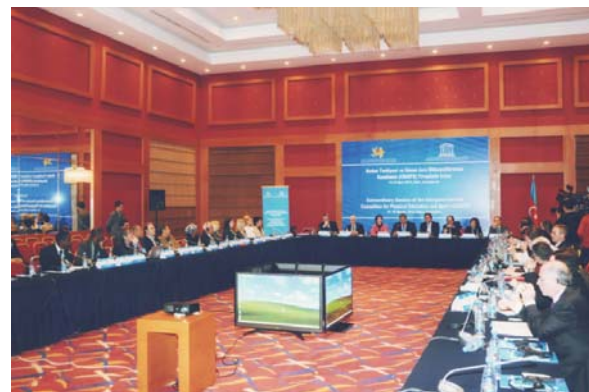
Extraordinary session of the Intergovernmental Committee for Physical Education and Sport, Baku, 2013

Azerbaijan was the 60 th State Party to the International Convention Against Doping in Sport, having acceded to it on 23 July 2007. The country is very active in mainstreaming international cooperation through sport and serves as an international platform to address sport challenges. Thus, the Ministry of Youth and Sport of Azerbaijan pioneered the hosting of an extraordinary session of the Intergovernmental Committee for Physical Education and Sport (CIGEPS) and its Permanent Consultative Council, contributing to the preparation of the 5 th World Conference of Sports Ministers in Berlin MINEPS V. The outcomes of the meeting offered a solid international catalyst in the development of the Berlin Declaration.