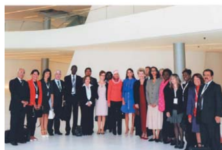
First Lady of Azerbaijan, UNESCO Goodwill Ambassador Mrs. Mehriban Aliyeva with members of the UNESCO delegation, Baku International Humanitarian Forum 2012