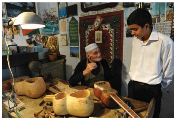
“Craftsmanship and performance art of the Tar, a long-necked string musical instrument” inscribed on the Representative List of the Intangible Cultural Heritage of Humanity in 2012

Azerbaijan has ratified the 1970 UNESCO Convention on the Means of Prohibiting and Preventing the Illicit Import, Export and Transfer of Ownership of Cultural Property. Action needs to be pursued to increase the country's capacities regarding the preventive action and the fight against the illicit trafficking of cultural property, and public awareness regarding the need to protect cultural heritage must be reinforced.