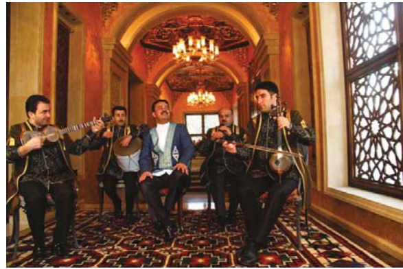
"The Azerbaijani Mugam" inscribed on the Representative List of the Intangible Cultural Heritage of Humanity in 2008

The UNESCO Country Programming Document for the Republic of Azerbaijan (herein referred to as UCPD), is based on the analysis of the current situation, the country's priorities in the fields of education, including HIV and AIDS prevention, natural sciences, social and human sciences, culture and communication and information, and the experience gained in the country. The Document has been aligned with the national development goals and state programmes drawn up in accordance with the Millennium Development Goals (MDGs); this is also relevant to and complements the current United Nations Development Assistance Framework (UNDAF) for the country.