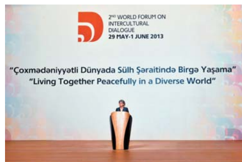
World Forum on Intercultural Dialogue, UNESCO Director-General Mrs. Irina Bokova, Baku, 2013