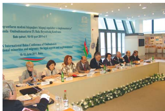
International Baku Ombudsmen Conference "Cultural Rights of National Minorities and Migrants: Legal Aspects and Implementation"

Linkages between research and the national youth policy were strengthened through the implementation of the pilot Study on Youth Civic Engagement in Azerbaijan in 2010. The Study focused on the role that national and international mechanisms of cooperation between governmental and civil society institutions play in promoting active involvement of young people of both genders in social transformations and intercultural dialogue, with special emphasis placed on issues pertinent to young women. The Study's findings and recommendations were presented and discussed at a regional conference on «Youth and Social Transformations: Involvement, Initiatives, Mutual Understanding and Partnership» held in Moscow in 2011 to mark the UN International Year of Youth.