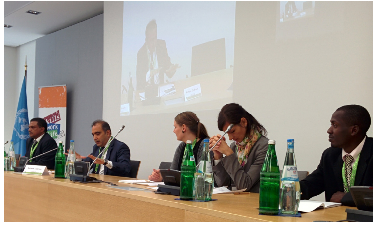
Panelist with youth representatives from Germany and Uganda

The challenge for TVET institutions is to make them attractive so that they become institutions of choice. This requires that the state and the institutions change perceptions of what TVET colleges are. It is vital to strengthen partnerships with industry, and also with other