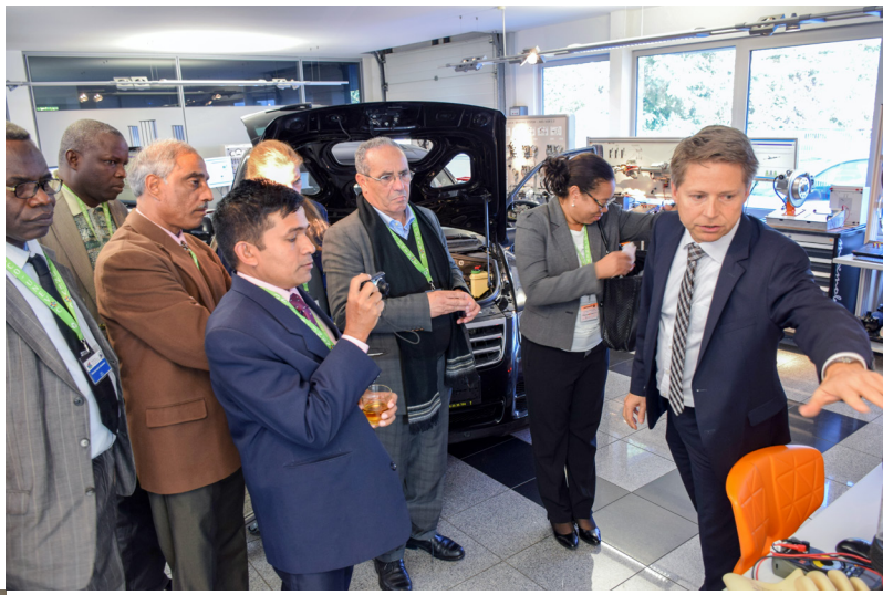
Study visit in Lucas Nülle

'We are trying to make the technology visible for the student – we have to be able to adapt our products so we can make sure we are prepared for the technology of tomorrow', said a LN representative.