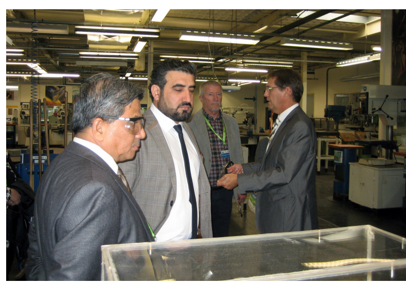
Study visit in Ford Ford Aus- und Weiterbildung e.V.

Besides a comprehensive introduction to the German dual training system and FAW's role in providing in-company training, a special emphasis was given to the company's programme targeting vulnerable youths and its campaigns to attract female apprentices for jobs that are traditionally dominated by men.