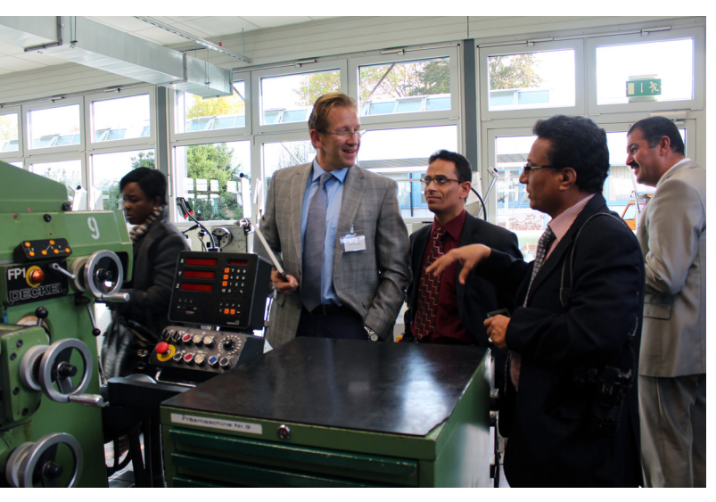
Study visit in Currenta