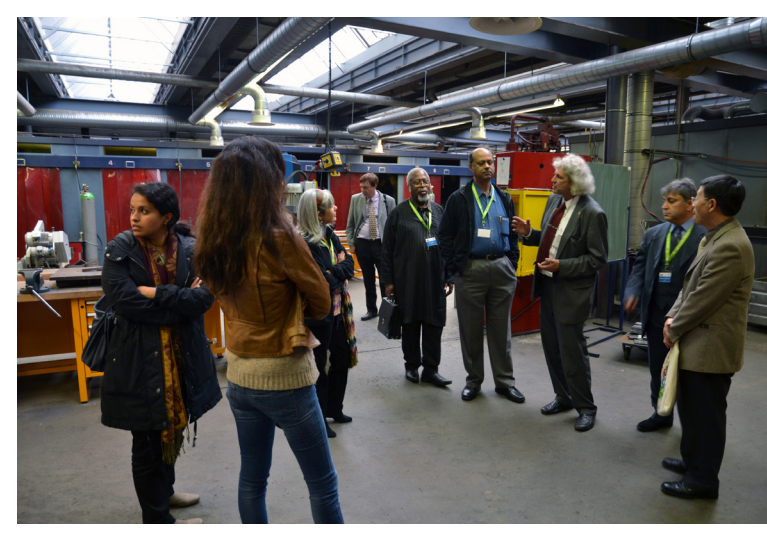
Participants during study visit

agenda. The Sustainable Development Goals (SDGs) underpinned multidisciplinary discussions at the forum and represented an important step forward in development thinking by bringing together sustainable development with poverty alleviation, inequality and technological change in a holistic account of how people's lives can be enhanced.