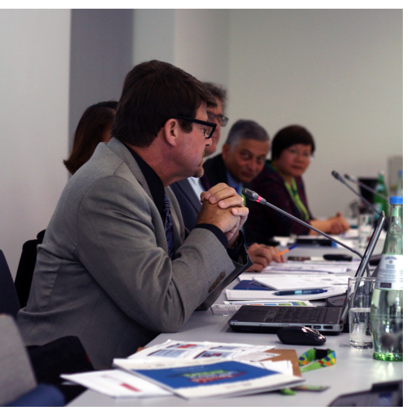
Panelists of the session

Greening TVET is part of a transformative and inclusive vision for TVET as outlined at Shanghai. It represents a more systemic approach to all TVET activities than a mere economic approach. It aligns with local economies, covering both formal and informal enterprises and work. It guides stakeholders in the framing of skills development according to available occupational requirements, addressing questions of what skills and workforce education programmes are needed; what proficiency levels should be set for what jobs and work processes; and what qualifications should be the focus of investments. Thus, it symbolizes a continuous process towards attaining low-carbon green growth.