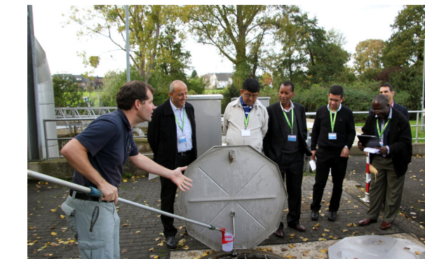
Study visit in DWA

BIBB conducts research on initial and continuing TVET and its progressive development. A presentation was given on the institute's role within the German TVET system, the dual training system itself and the training regulations for selected green job profiles. This theoretical introduction to the German training system and how the concept of sustainable development is progressively translated into green jobs, was combined with a visit to a water treatment plant where the participants had the opportunity to speak to apprentices and learn about the water treatment and filtration processes.