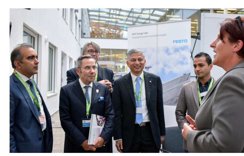
During the exhibition opening