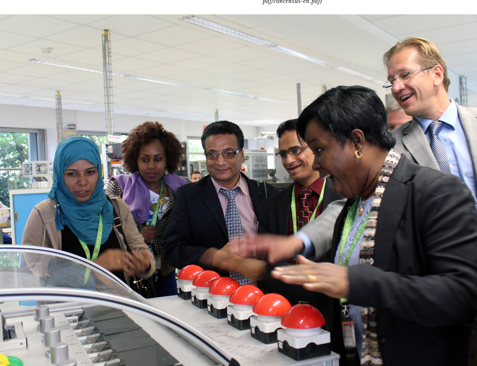
Delegates during one of the study tours

8 The Shanghai Consensus gives seven recommendations for action: (i) enhancing TVET relevance, (ii) expanding access and equity, (iii) improving quality, (iv) adapting qualifications and developing pathways, (v) improving the evidence base, (vi) strengthening governance and partnerships, (vii) increasing investment in TVET and diversify financing and (vii) advocating TVET. (More info is on www.unesco.org/new/fileadmin/MULTIMEDIA/HQ/ED/pdf/concensus-en.pdf)