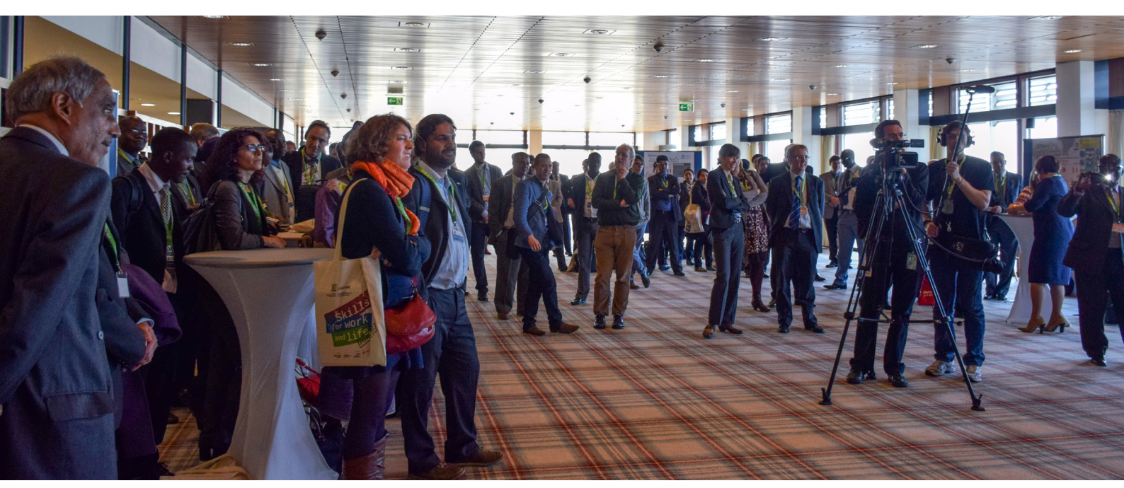
Participants during the UNEVOC Network Session