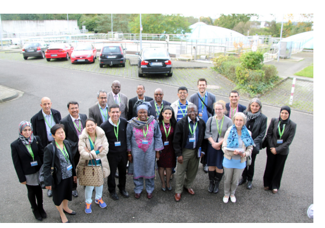
Participants during the study tour in BIBB