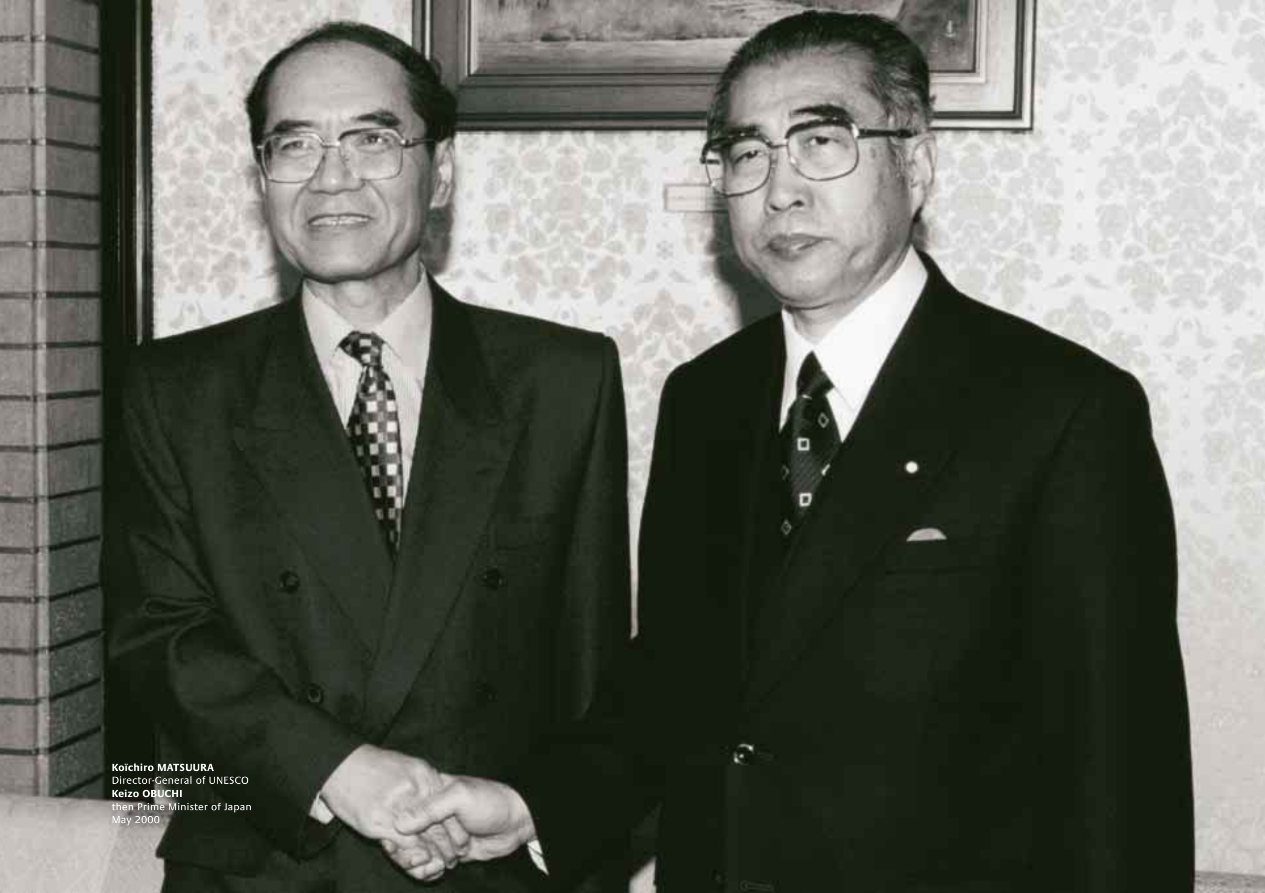
Koichiro MATSUURA Director-General of UNESCO Keizo OBUCHI then Prime Minister of Japan May 2000