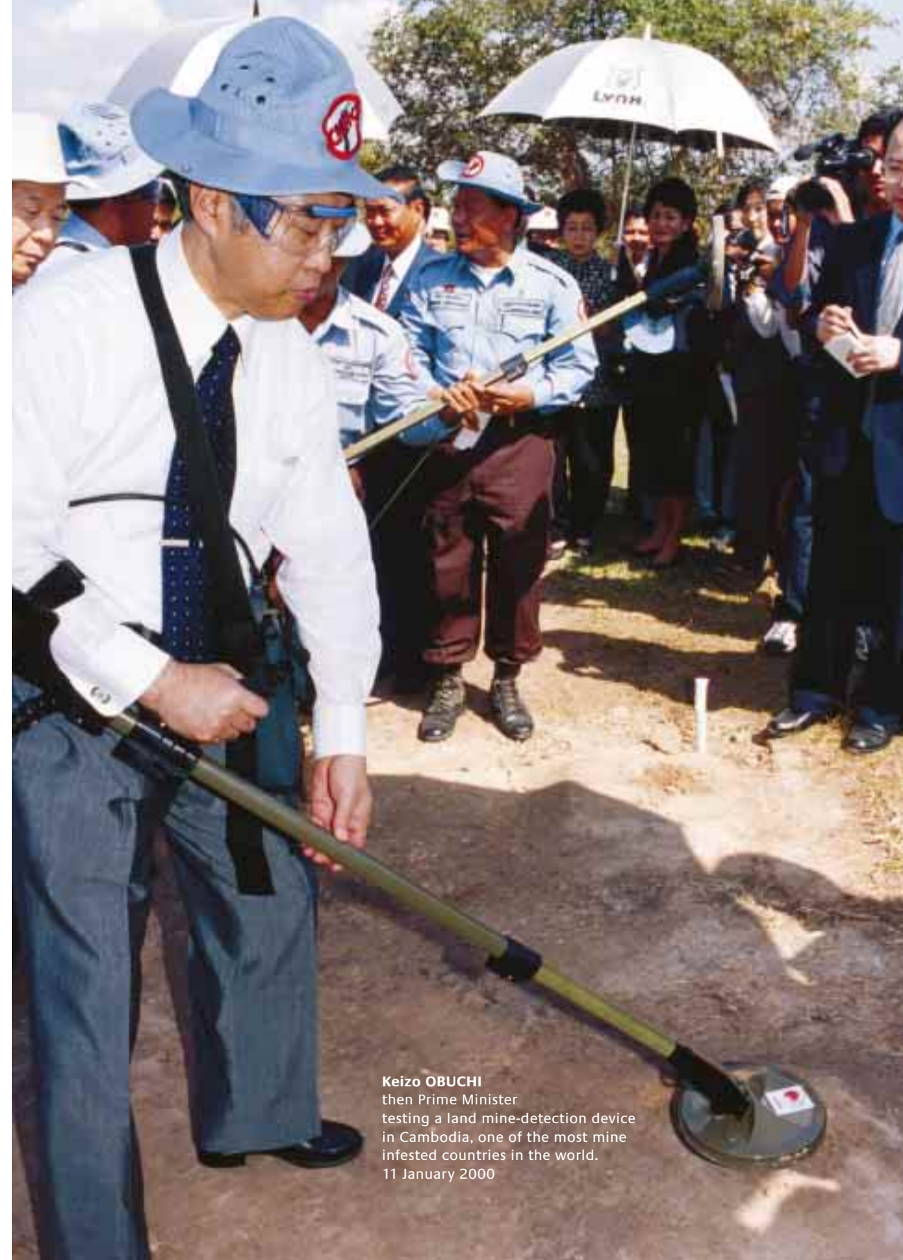
Keizo OBUCHI then Prime Minister testing a land mine-detection device in Cambodia, one of the most mine infested countries in the world. 11 January 2000