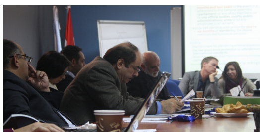
First Advisory Board meeting in February 2015

The Advisory Board provides input and guidance to the research team on methodology, qualitative oversight of the study, experts' input on the assessment process, and feedback on the draft assessment report and its recommendations.