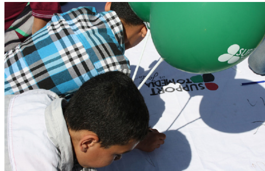
During the Europe Day celebrations in Amman, 8 May 2015