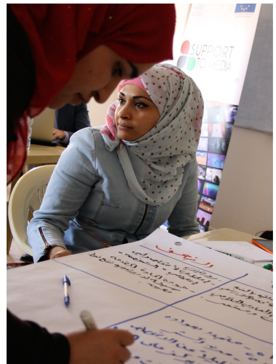
During consultations in Karak in May 2015.

So the conclusion is obvious. To develop local media is a priority in Jordan. At least for UNESCO.