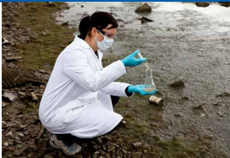
Assessing environmental pollution

The lack of capacity and the challenges facing the water sectors require the design of adequate training tools and innovative learning approaches to enhance the competencies of staff as well as to strengthen institutional capacity. This applies to government and its agencies, river basin organizations as well as other groups including private sector organizations. Solutions to filling these gaps include: creating an enabling policy environment for collaborative frameworks between the education sector, sector employers (public, private, NGOs), trade unions and employees; developing incentives to attract and retain staff; strengthening technical and vocational training; and giving attention to human resources capacity development in rural areas. New and transversal skills also need to be instilled to respond to new needs.