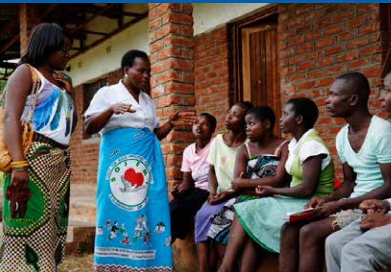
Community workers' forum