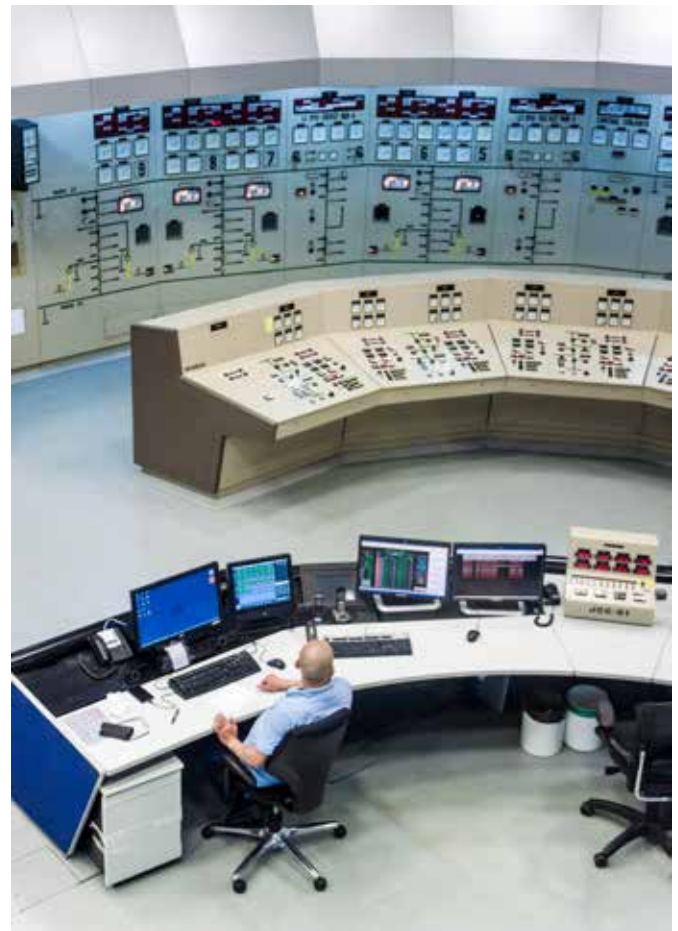
Command room of hydroelectric energy plant

It is essential to plan water investments in conjunction with relevant sectors, such as agriculture, energy and industry in order to maximize positive economic and employment results. Within a suitable regulatory framework, public-private partnerships (PPPs) offer prospects for much needed investment in water sectors, including building and operating infrastructure for irrigation and water supply, distribution and treatment. With a view to promoting economic growth, poverty reduction and environmental sustainability, consideration must be given to methods that mitigate job loss or displacement and maximize job creation that may result from the implementation of an integrated approach to water management.