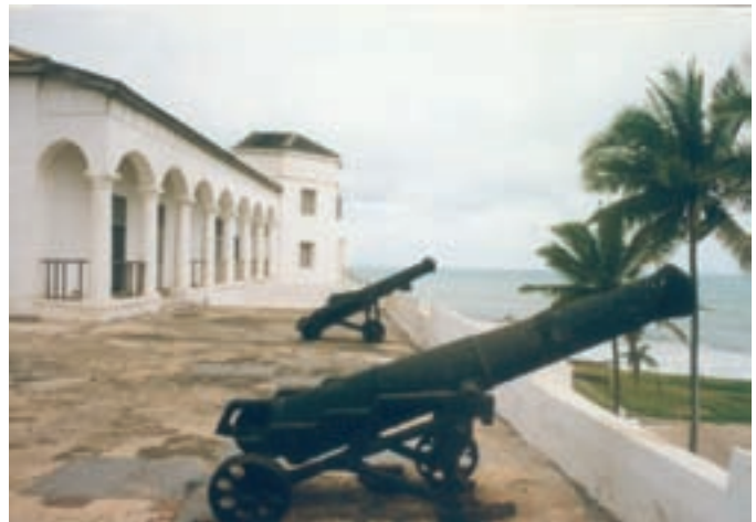
Elmina Castle (Ghana)

Some countries have however shown how investment, protection, restoration and development of places of memory can constitute major tourist assets. The products known as derived are almost wholly absent, and this