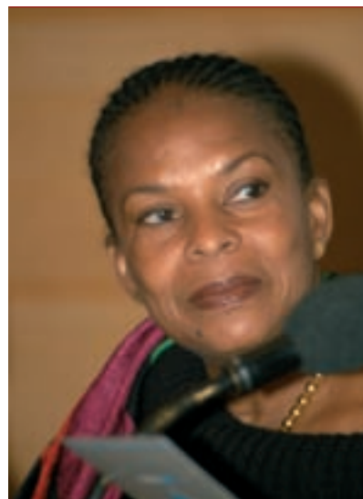
Christiane Taubira