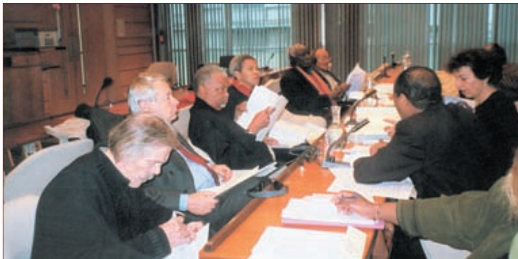
Members of the International Scientific Committee for the Slave Route project