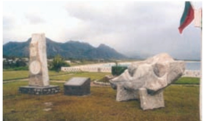
Two stelae and a garden (Fort-Dauphin, Madagascar) © Bernard Curtis

The statues are carved in multi-coloured stone and granite by Dolène Curtis, an