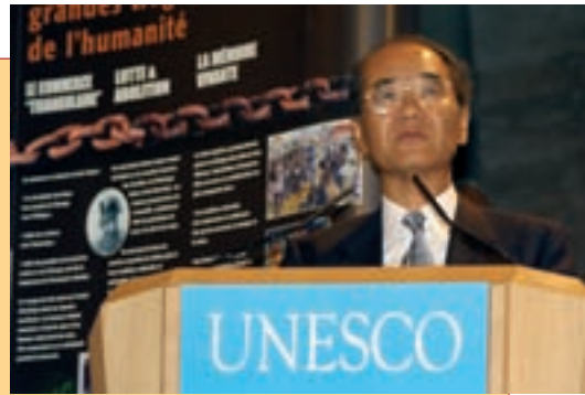
Mr Koichiro Matsuura, Director-General of UNESCO, the 23 rd of August 2004

The UNESCO Office in Dakar, the Gorée municipal authorities and the specially created Committee for the organization and commemoration of the struggle against slavery and its abolition were particularly active in the commemoration of 23 August. This was reflected in the wide range of activities organized (including a concert, music, a memorial tour, a pilgrimage to the Slaves' House, an exhibition vernissage and a film screening) as well as in the mobilization of both partners and the public.