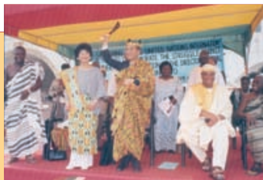
Launching of the 2004 Year on the Cape Coast

The ceremony ended with a visit to the exhibition: "Slavery: resistance and abolition in the New World and the Indian Ocean".