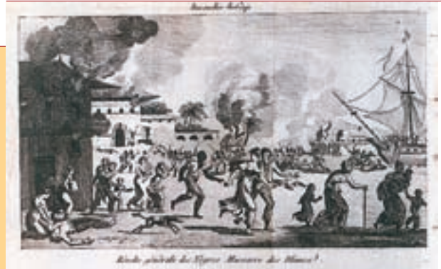
Insurrection in Saint-Domingue

The Haitian Revolution has important consequences for today's struggles against racism, domination and intolerance.