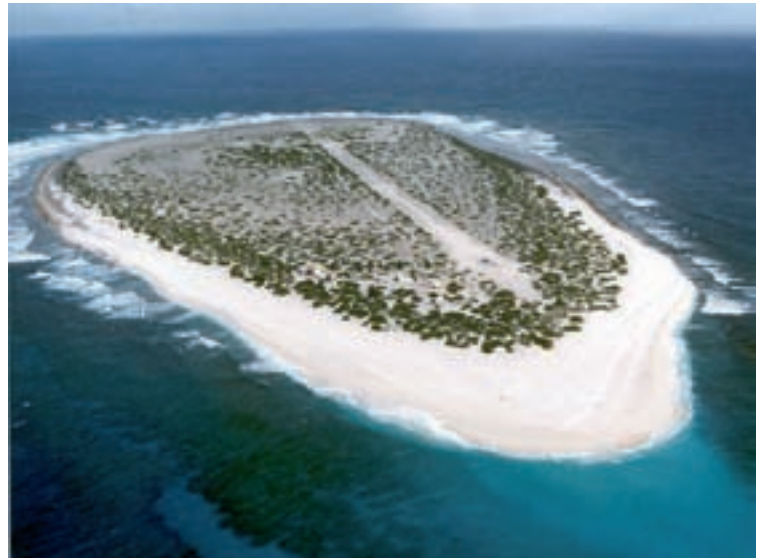
The Île des Sables, now called Tromelin

A team of researchers in Metropolitan France, Reunion and Madagascar has set itself