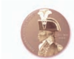
Abdias do Nascimento