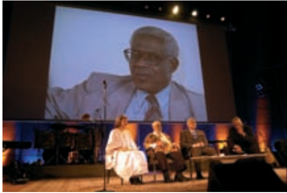
Award ceremony for the UNESCO Toussaint Louverture Prize.