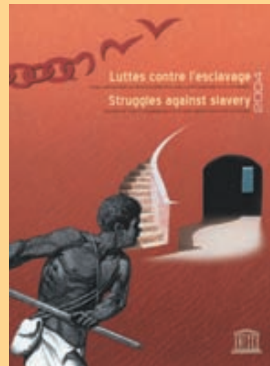
Cover page of brochure published for 2004

The activities organized at UNESCO Headquarters and in the Member States, with the collaboration of the Organization’s field offices, received wide coverage from the national and international press: Le Soleil (Dakar, Sénégal); Cameroon Tribune (Cameroon); Le Mauricien (Mauritius); Le Monde , Cité Black , Amina , Libération , Le Figaro (France); El País (Spain), O Globo , Jornal do Rio (Brazil), etc.