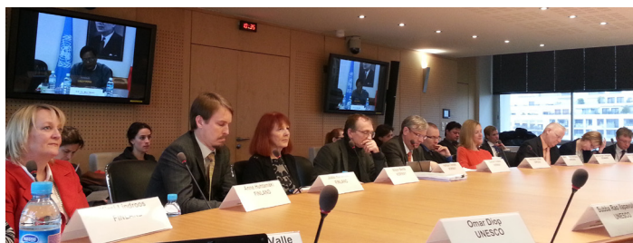
Dr Myo Myint, Deputy Minister for Education in Myanmar, joined the discussions via video conference (©UNESCO/Bruno Mesquita Valle).

As key messages, the donor group acknowledged the long-term aspect of capacity development processes to ensure sustainability, emphasizing the need to expand the donor base. Donors also encouraged stronger coordination and alignment of activities at country level, with different partners and development actors to create synergies and scale up the impact of the CapEFA programme.