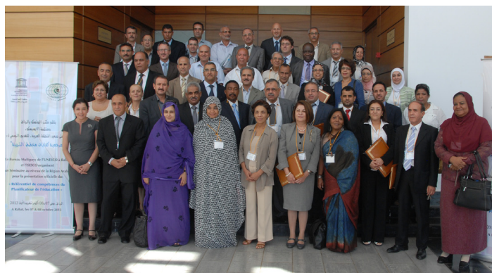
Participants at the workshop in Rabat, Morocco.

To contribute to bridging these gaps, the CapEFA programme launched a regional initiative tailored for the Arab Region. Coordinated by the UNESCO Office in Beirut, the programme aims to strengthen the capacities of educational planners at the regional level through the enhancement and consolidation of existing training institutions in the region.