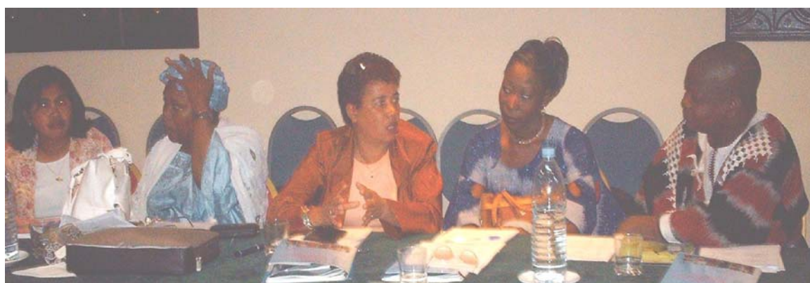
EDUCAIDS Africa Sub-Regional Francophone Workshop Participants

Based on the workshop evaluation, participants said that the workshop helped them achieve an improved understanding of EDUCAIDS, UNESCO's roles and the need for coordinated action on HIV and AIDS. The opportunity to exchange experiences among countries was particularly highly valued. Participants indicated that it would have been beneficial to include more national partners and expressed a general need for improved communication within UNESCO as well as with partners.