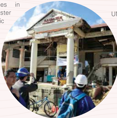
Post-disaster engineering field investigation of building damage. Bohol, Philippines

UNESCO supports countries in post-conflict and post-disaster situations by ensuring strategic responses, including through efficient and timely provision of field support, adequate staffing and administrative support mechanisms in its areas of competence. UNESCO actively participates in the United Nations post-crisis coordination mechanisms, including joint needs assessments and formulation of multi-donor appeals. UNESCO undertakes post-disaster field investigations in order to determine the causes of the disaster that can inform policy and produce and disseminate lessons to be learned. UNESCO also provides assistance for the Field Investigation and Rehabilitation of UNESCO sites, including the setting up of a Rapid Response Facility. UNESCO trains teachers and parents to interactive learning and the complex aspects of emergency education, including psychological support for children and youth.