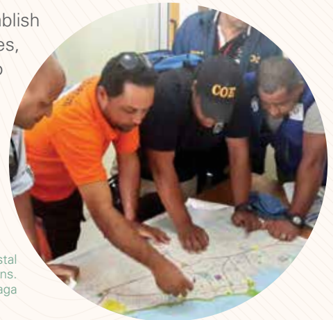
Simulation exercise during 2014 of the Tsunami and other Coastal Hazards Warning System for the Caribbean and Adjacent Regions.

UNESCO promotes scientific exchange and collaborative efforts in order to establish effective early warning systems for different hazards such as tsunamis, landslides, volcanoes, earthquakes, floods and droughts. UNESCO helps Member States to collectively achieve effective early warning and monitoring, helps coordination between existing research centers and educates communities at risk about preparedness measures, including setting up warning and emergency response Standard Operating Procedures and community drill exercises. UNESCO promotes community-based approaches in the development of response plans and awareness campaigns, which strongly involve educational institutions and end-users.