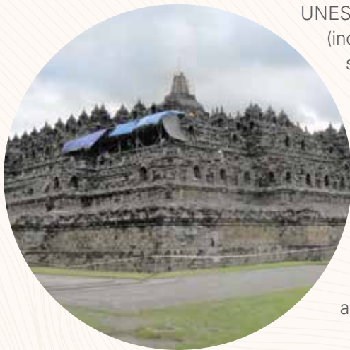
Borobudur Temple, community-based rehabilitation work and sustainable tourism development.

UNESCO encourages the identification of risks, protection from different hazards (including climate change) and the preservation of UNESCO designated and affiliated sites including World Heritage Sites, Biosphere Reserves and Global Geoparks. In this sense UNESCO supports Member States to integrate heritage and disaster risk reduction into national disaster reduction policies including management plans and systems for World Heritage properties in their territories. Through their commitment to being learning sites for sustainable development in unique ecosystems around the world, Biosphere Reserves offer opportunities to understand the way changing environments impact communities. Global Geoparks play an active role in telling the story of past and active geological processes and the way they affect people. Many Global Geoparks have community and school programmes to educate about the source of geo-hazards and ways to reduce their impact including disaster response strategies.