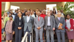
©UNESCO UNESCO Maputo - UNESCO Head of Maputo Office, Sida, Mozambique Government officials, UNAIDS, UNESCO workshop participants gather in Maputo, Mozambique

In June 2015, UNESCO, with the support of the Swedish International Development Cooperation Agency (Sida), met government officials and key stakeholders in Maputo, Mozambique to review the second year of progress in a project to strengthen sexual and reproductive health and HIV prevention in eight countries: Lesotho, Malawi, Mozambique, Tanzania, Uganda, Zambia, South Sudan and Namibia.