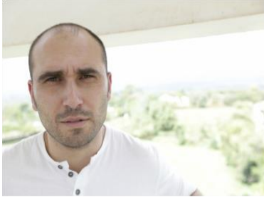
Mr José Manuel Cólón Film Director

José Manuel Colón is a fine story-teller, author of the documentary film Black Man White Skin (BMWS). The movie portrays the tragedy of people with albinism, who are virtually ignored. Colón's documentary tells 'wonderful stories filled with kindness,' the stories of many people who work selflessly for African albino people, one of the most vulnerable people in the world.