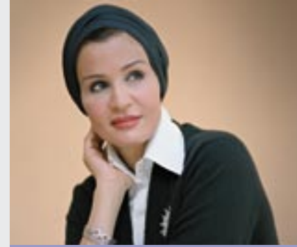
Her Highness Sheikha Mozah Bint Nasser Al Missned

Mr Matsuura highlighted that the Decade, which will conclude in 2012, "is a major aspect of the EFA drive and is important not only for education but also for the whole development process and, therefore, the Millennium Development Goals as a whole. Through the Decade, UNESCO is working hard in several areas – advocacy for literacy; the mobilization of resources; the coordination of action at international and regional levels; the sharing of information and good practices; the promotion of partnerships; and overall monitoring and reporting."