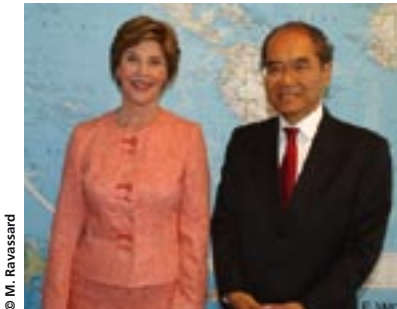
U.S. First Lady Mrs Laura Bush, UNESCO Honorary Ambassador for the United Nations Literacy Decade, and Mr Koichiro Matsuura, UNESCO Director-General, at UNESCO Headquarters

From 27 February to 1 March 2005, the Director-General met with United States government officials and non-governmental partners during his visit to Washington, DC, to open a Georgetown University conference on UNESCO and Education for All.