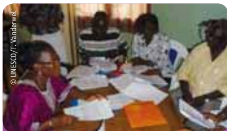
National stakeholders at policy & strategy validation workshop