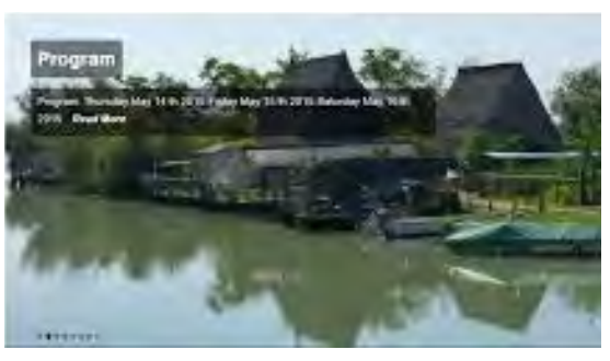
Water Worlds with "Exploring the Venice Lagoon" and "Waterscapes and Historic Canals as a Cultural Heritage"