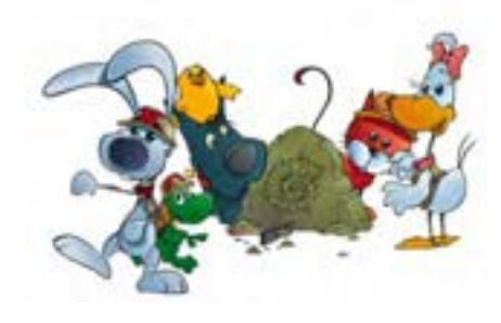
The H2Ooooh! cartoons will also be featured at EXPO in Milan!