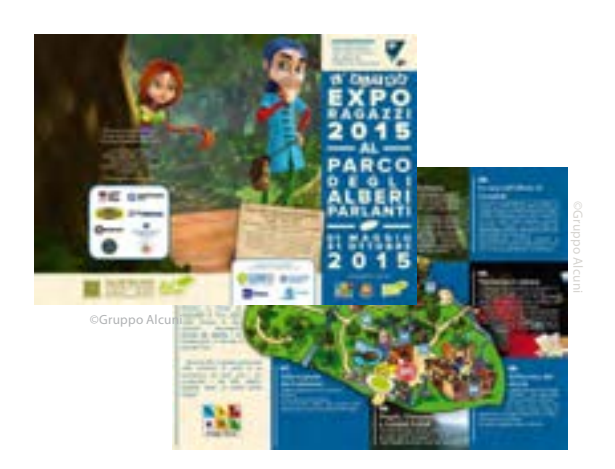
Children's EXPO with the Treasure Hunt, Leonardo EXPO and the Parco degli Alberi Parlanti