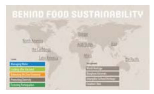
The exhibition by theme, programme and country on the tablets