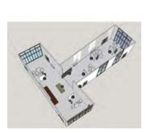
Exhibition map and layout