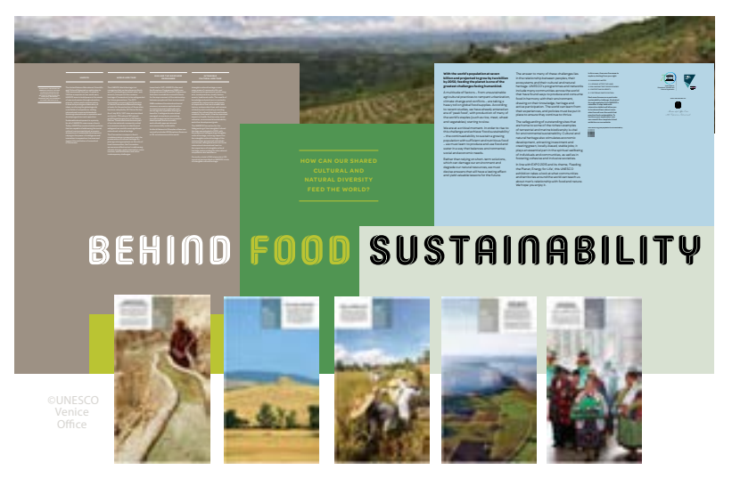
"Behind Food Sustainability" Exhibition