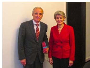
▶ UNESCO Director-General Irina Bokova and Bratislav Petkovic, Minister of culture of Serbia, Sofia, October 2012

The Conference addressed national policies and measures to safeguard the intangible cultural heritage in the subregion and explore avenues to strengthen cooperation by enhancing cultural heritage as a driver for intercultural dialogue and sustainable development.