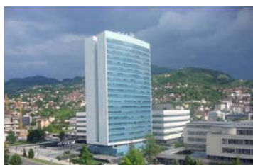
© A. Altun – Government building, Sarajevo (Bosnia and Herzegovina)

The joint declaration highlights the role played by UNESCO Venice Office as a neutral broker in the region. For more than a decade, the office has encouraged the development and implementation of effective regional research