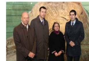
▲ Inauguration day of Mithras Temple in Jajce

Support was given to the reconstruction of the country’s most valuable cultural heritage, including the mysterious Mithras Temple of Jajce in central Bosnia and Herzegovina. The Mithras Temple dated 4th century AD was officially opened in Jajce on 4 December 2012.