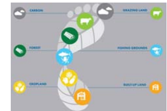
▲ - Ecological Footprint

Dozens of government representatives, NGO leaders and academics met this week in Venice to discuss the links between ecological and economic crises in the Mediterranean region.