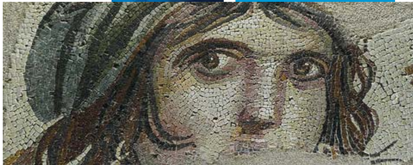
^ © "The Gypsy Girl" mosaic of Zeugma, Gaziantep Museum of Archaeology

The main objectives of the meeting were: ratification and effective implementation of the 1970 Convention and other relevant instruments on the fight against illicit traffic and the restitution of cultural objects; effective use of legal and operational tools to safeguard and preserve cultural heritage; development of national capacities for the protection and conservation of movable cultural property; and, awareness raised