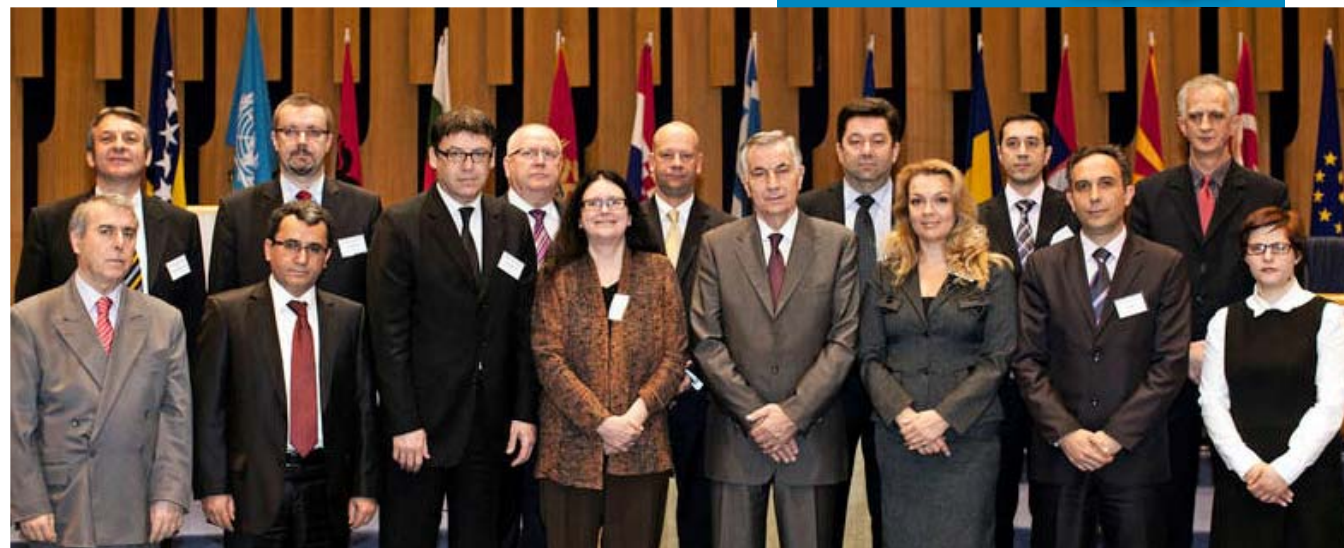
© Ministry of Civil Affairs of Bosnia and Herzegovina – Family photo

policies, as well as infrastructure development and collaborative networks for qualitative science communication. In this regard, the office has published a series of titles.