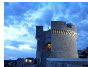
© Minceta Tower - D. Poletto