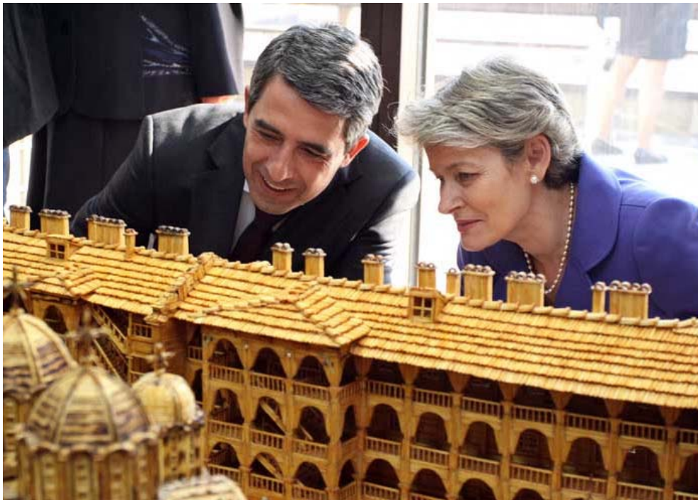
UNESCO Director-General Irina Bokova and President of Bulgaria Rosen Plevneliev visiting the exhibition Bulgarian Heritage - Past, Present and Future at the National Palace of Culture, Sofia, 26 October 2012.

to strengthen regional cooperation for development through the safeguarding of intangible cultural heritage