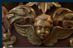
FIGHTING ILLICIT TRAFFIC OF CULTURAL PROPERTY IN SOUTH EAST EUROPE [15:54]

Follow us on our YouTube channel: http://www.youtube.com/user/UNESCOVeniceOffice