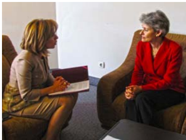
◀ UNESCO Director-General Irina Bokova and Elisabeth Kanceska Milecka, Minister of Culture of The former Yugoslav Republic of Macedonia, Sofia, October 2012.

UNESCO Director-General Irina Bokova attended in Sofia, Bulgaria, the Eighth Ministerial Conference on Cultural Heritage in South East Europe, at the invitation of the Minister of Culture of Bulgaria Vezhdi Letif Rashidov.