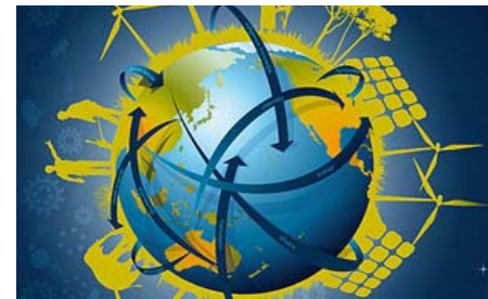
^ ©World Science Day for Peace and Development 2012

This year's theme was "Science for global sustainability: interconnectedness, collaboration, transformation"