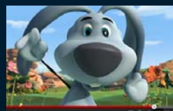
THERE'S NO MORE WATER LEFT ON THE EARTH - WATER PROJECT H2OOOOH! [2:21]