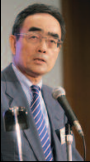
MUTSUYOSHI NISHIMURA, Ambassador for Global Environmental Affairs, Ministry of Foreign Affairs, Japan

The development of hybrid automobiles and the exploration of biofuels as new energy sources are examples of the ways in which we are applying technology to approach environmental problems.