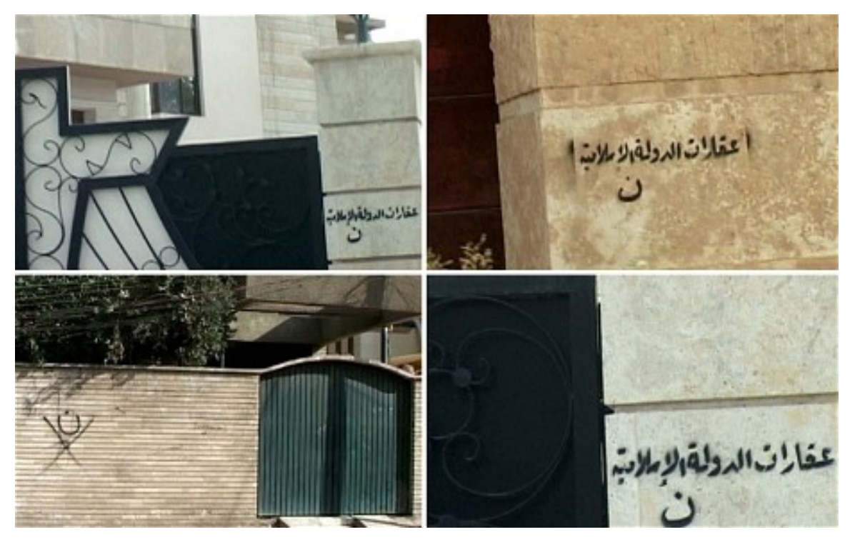
Fig. 5 - Homes marked with the Arabic letter "noun"

As a source of identity, meaning and belonging, culture can both facilitate social cohesion and fuel social exclusion and discrimination. In this respect, it is worth recalling the UNESCO Universal Declaration on Cultural Diversity (2001), which emphasizes how, in addition to safeguarding the reality of cultural