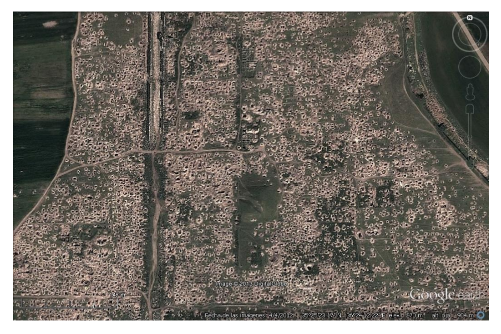
Fig. 4 - Extensive looting at the archaeological site of Apamea, Syria

According to reports, confirmed by satellite images, looting taking an unprecedented scale sometimes and is organized by armed groups themselves. For instance, according to the Directorate-General of Antiquities and Museums of Syria, 300 persons were digging at the major archaeological site of Dura Europos, January 2014. There is evidence that contractors are hired and provided