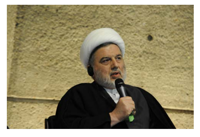
Fig. 3 – Hon. Sheikh Humam Hamoudi, First Deputy Speaker of the Council of Representatives of Iraq

today again subject to similar attacks from "forces of darkness and ignorance" that will, however, not prevail. He also reminded everyone that these forces represent a danger for all humankind, as they wish to "destroy the unity of human culture, the art of living together, the diversity and the cultural exchanges between cultural civilizations". Because its culture does not belong to Iraq but to all humankind, Sheikh Hamoudi stressed the shared responsibility to protect it as well as Iraq's urgent need for support to preserve its cultural heritage and to fight illicit trafficking. He invited all State Parties to the UNESCO 1954, 1970, 1972 and 2003 Conventions, as well as the supporters of the UNESCO Executive Board Resolution regarding the