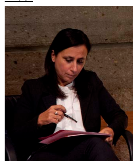
Fig. 8 – Dr Antonella Caruso, Director of the UN Department of Political Affairs Middle East and Western Asia Division

Dr Caruso outlined the principle factors behind the rapid expansion of ISIL in Iraq and Syria, although she noted that the political situation in the two countries were different, but are often grouped together in modern discourse due to their common enemy: ISIL. According to her, ISIL's rapid expansion in Iraq can be partially explained by the lack of progress in the reconciliation process after the civil war of 2006-2007, as this magnified identity politics and divisions among different components of Iraqi society and their political elites. Incomplete integration of members of the Sahawat, coupled with the revenge killing of the tribal leaders' families, who were instrumental in preventing Al-Qaida from gaining influence in the region, have also contributed to the current crises. Moreover, socio-economic grievances have provided an environment conducive to ISIL's inflammatory and revisionist rhetoric, as the Iraqi government never fully addressed the issues at the root of the demonstrations that took place in Anbar province throughout 2011-2013. By exploiting Sunni grievances, ISIL could rely on local armed groups. In addition to these events, ISIL's rapid expansion has also