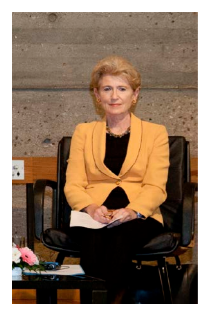
Fig. 2 – Emily Rafferty, President of the Metropolitan Museum

Further, recalling museums' role as "guardian[s] of ancient civilizations", Ms Rafferty stressed their contributions in the direct conservation of objects and the training of conservation specialists, in the sharing of best practices as well as in the maintenance of archival records.