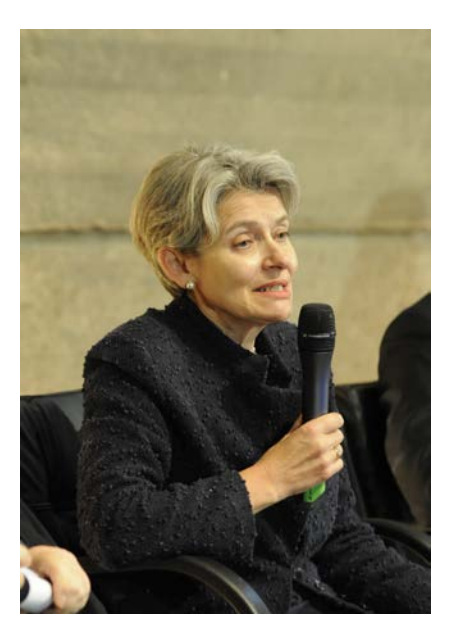
Fig. 1 – Ms Irina Bokova, Director-General of UNESCO

Ms Bokova moreover underlined UNESCO's role in raising the alarm and in bringing partners together to find solutions, and that condemning the violence is not sufficient. In response to the conflicts in Iraq and Syria, she reminded the audience that UNESCO created an Emergency Response Action Plan in order to promote