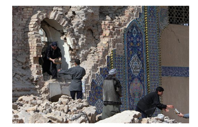
Fig. 2, 3 - The Al Askari shrine, Samarra, Iraq

UNESCO's rehabilitation of the Al-Askari shrine in Iraq, after the two attacks on the shrine in 2006 and in 2007, entailed intense dialogue between Sunni and Shia religious and tribal leaders in Samarra. Indeed, a key condition for a successful and durable rehabilitation of the shrine was a joint commitment to its rehabilitation without interference of a sectarian nature, as well as the commitment by both Sunni and Shia communities and authorities to its future protection. In this sense, the rehabilitation of the al-Askari shrine was not only about cultural heritage conservation — it raised issues of intercultural dialogue and, most importantly, peaceful coexistence between Sunni and Shia communities.