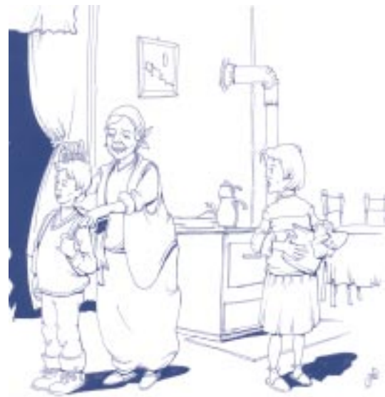
from the textbook of the Kosovo literacy programme.