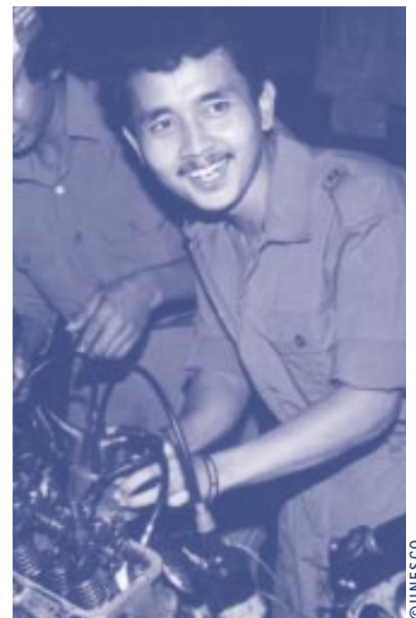
New push to recognize the skills of people with no formal qualifications.

Contact: Mohan Perera, UNESCO Paris e-mail: m.perera@unesco.org