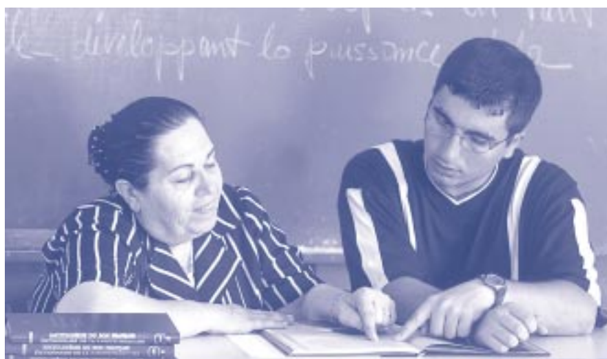
The UNILIT programme is a bridge between the privileged youth in universities and poor communities.