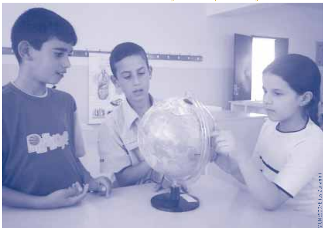
New learning materials ease up tensions among Palestinian schoolchildren

Contact: Costanza Farina, UNESCO Ramallah E-mail: c.farina@unesco.org