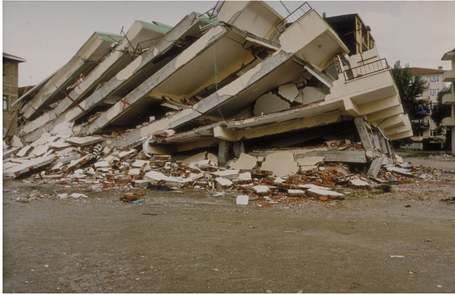
National Geophysical Data Center