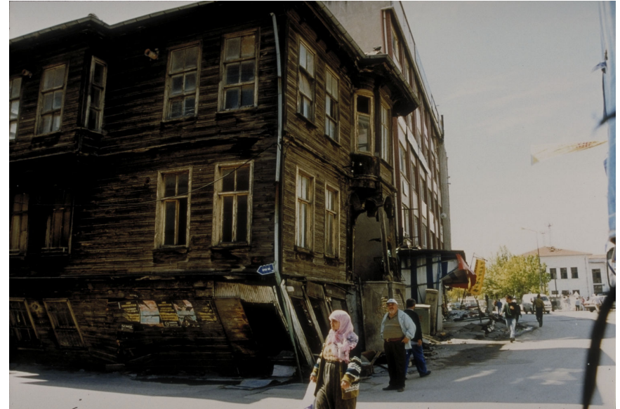
National Geophysical Data Center

İstanbul Technical University, Civil Engineering Faculty, Maslak, 34469, İstanbul, TURKEY Tel: +90 212 2853844 Fax: +90 212 2853336 E-mail: pala@itu.edu.tr http://www.akademi.itu.edu.tr/pala/