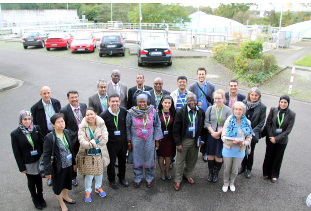
Participants during the study tour in BIBB

BIBB conducts research on initial and continuing TVET and its progressive development. A presentation was given on the institute's role within the German TVET system, the dual training system itself and the training regulations for selected green job profiles. This theoretical introduction to the German training system and how the concept of sustainable development is progressively translated into green jobs, was combined with a visit to a water treatment plant where the participants had the opportunity to speak to apprentices and learn about the water treatment and filtration processes.