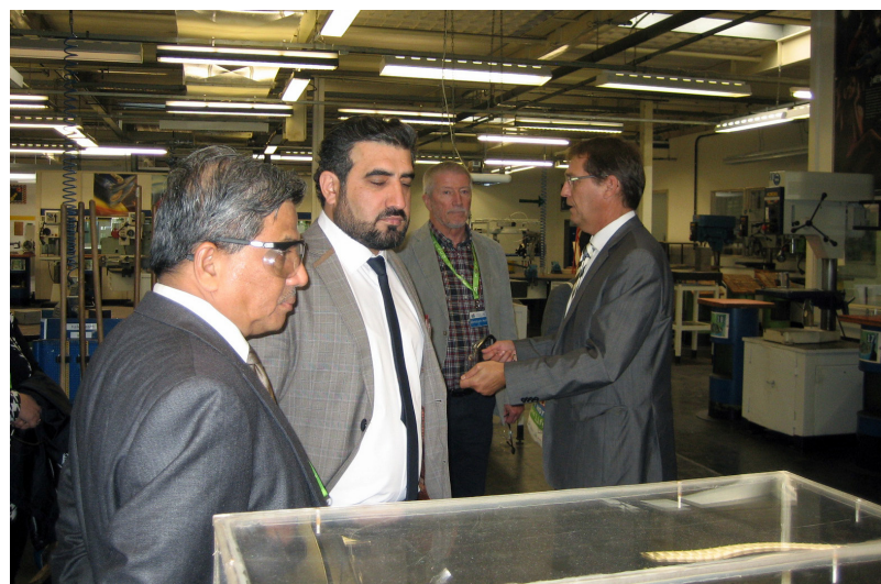
Study visit in Ford Ford Aus- und Weiterbildung e.V.

Besides a comprehensive introduction to the German dual training system and FAW's role in providing in-company training, a special emphasis was given to the company's programme targeting vulnerable youths and its campaigns to attract female apprentices for jobs that are traditionally dominated by men.