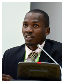
Arnest Sebbumba Countryside Youth Foundation, Uganda