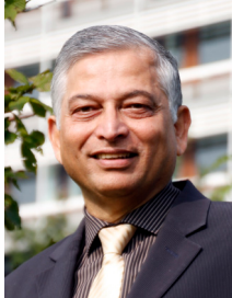
Shyamal Majumdar Head, UNESCO- UNEVOC International Centre for Technical and Vocational Education and Training