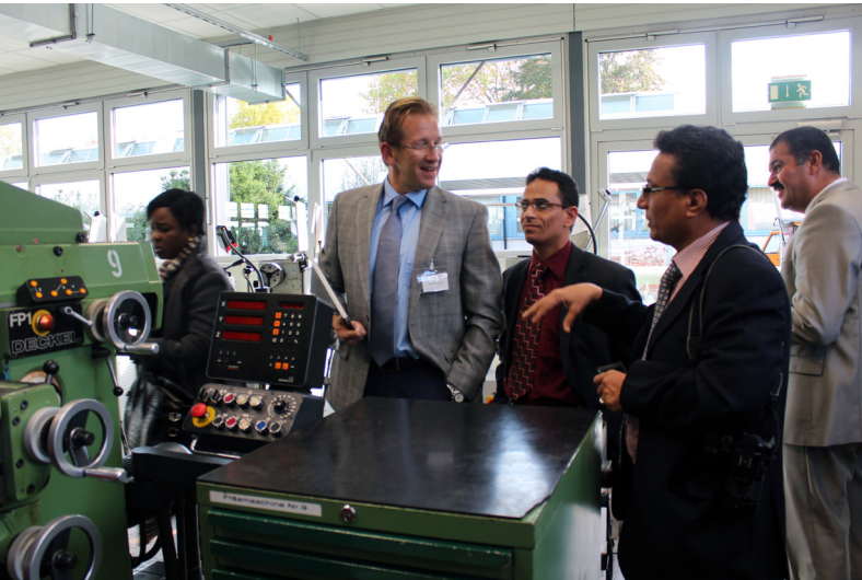
Study visit in Currenta