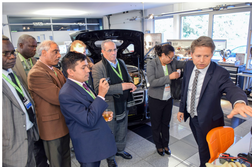
Study visit in Lucas Nülle

'We are trying to make the technology visible for the student – we have to be able to adapt our products so we can make sure we are prepared for the technology of tomorrow', said a LN representative.