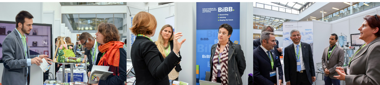
Global Forum exhibition

This report documents the discussions for further informing the global debate on TVET and the post-2015 agenda. It describes the approach in which the forum utilized cross-regional networking and partnership as platforms to create synergy and make TVET contributions relevant to the fulfilment of the aims of the post-2015 education agenda and its implications for the SDGs.