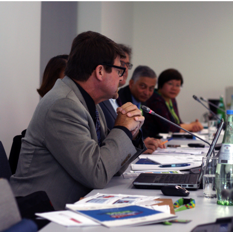
Panelists of the session

Greening TVET is part of a transformative and inclusive vision for TVET as outlined at Shanghai. It represents a more systemic approach to all TVET activities than a mere economic approach. It aligns with local economies, covering both formal and informal enterprises and work. It guides stakeholders in the framing of skills development according to available occupational requirements, addressing questions of what skills and workforce education programmes are needed; what proficiency levels should be set for what jobs and work processes; and what qualifications should be the focus of investments. Thus, it symbolizes a continuous process towards attaining low-carbon green growth.