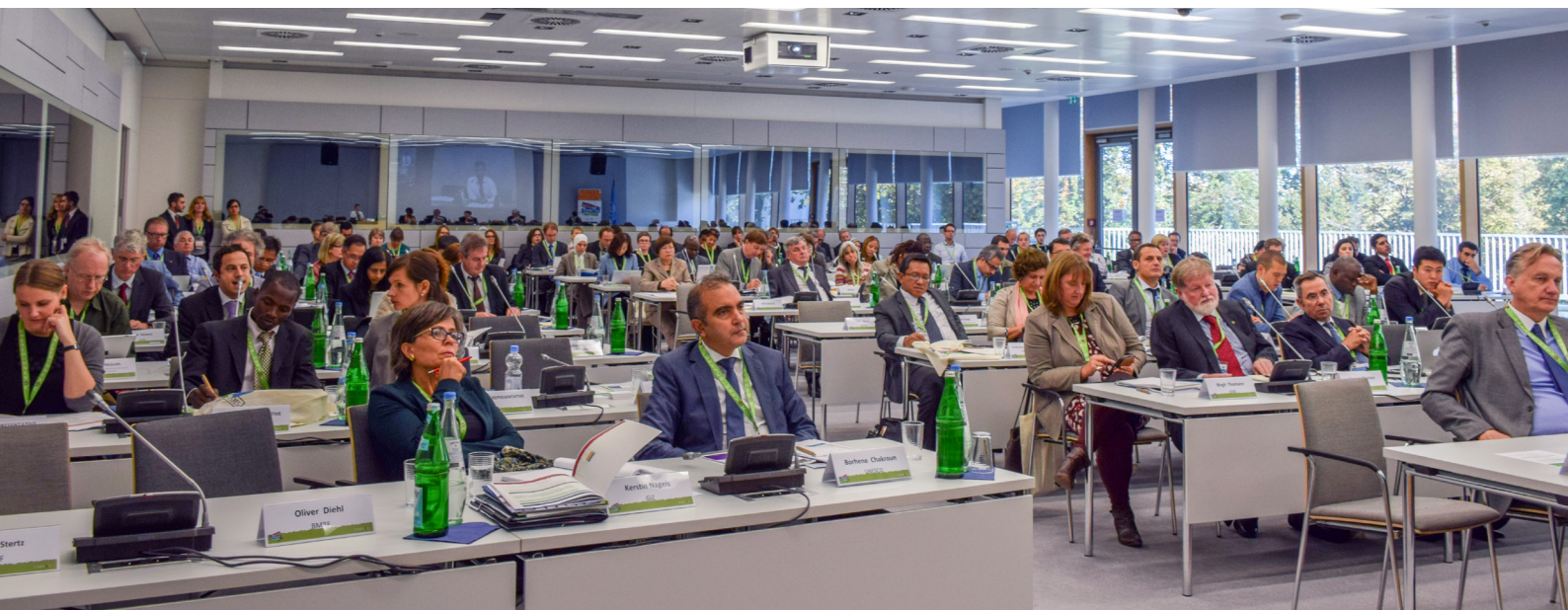
Participants of the Global Forum