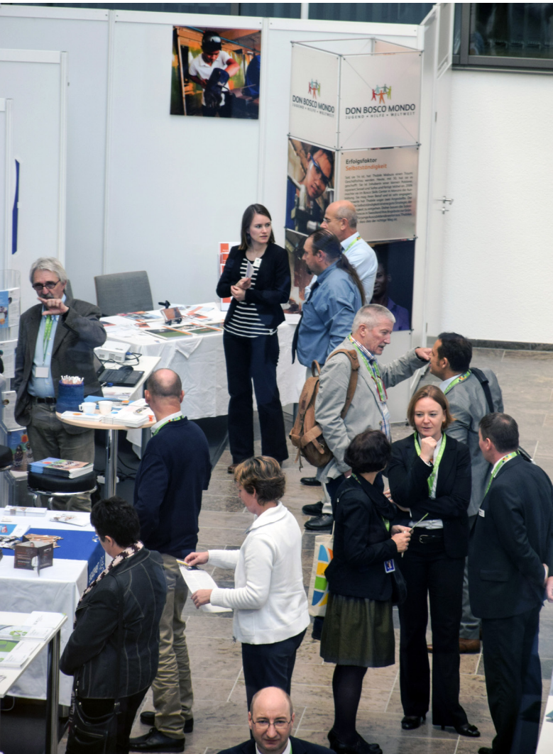
Participants visiting exhibition booths