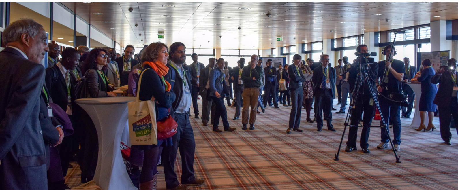
Participants during the UNEVOC Network Session