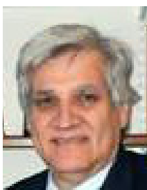
Juan Carlos Villagrán de León Head, United Nations Platform for Space-based Information for Disaster Management and Emergency Response UN- SPIDER, United Nations Office for Outer Space Affairs (UNOOSA)