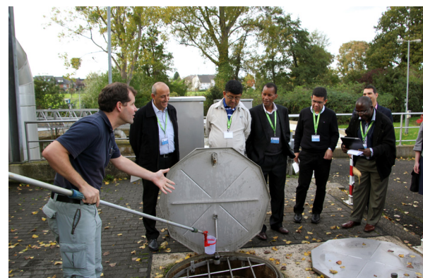
Study visit in DWA