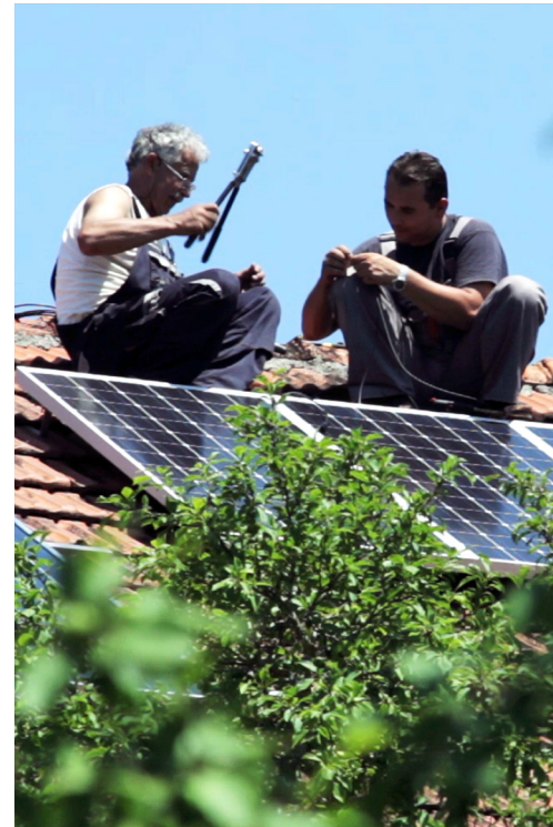
© UNDP in Europe and Central Asia

The regional fora provided regional platforms for collecting and sharing knowledge, experiences and promising practices (PP) on these two issues. They took stock of the regional experiences, insights and lessons learned from different stakeholders and across the UNEVOC Network. These were further shared at an inter-regional level through a Global Forum to enrich the rethinking of TVET in line with the post-2015 agenda. Networks and partnerships were geared towards regional harmonization and resource mobilization through the capacities of UNEVOC's unique global network of specialized TVET institutions and affiliated partners.