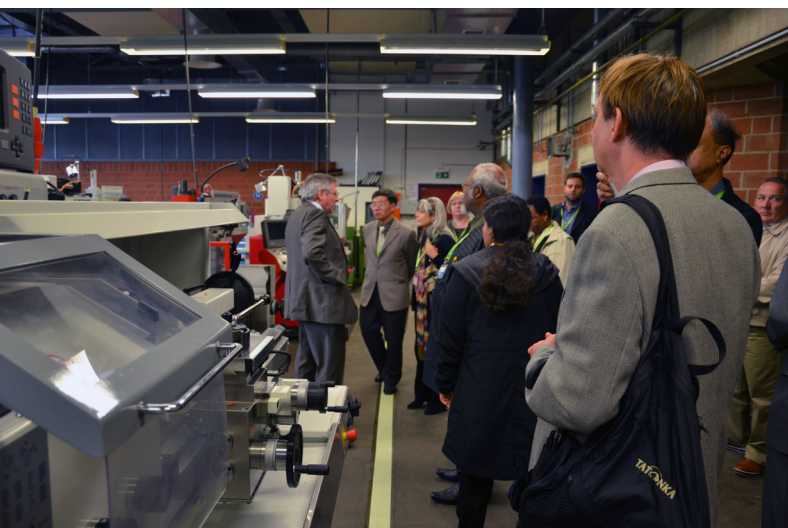
Study visit in Icon Institute

The tour continued with a visit to a training centre (BGE) managed by the Chamber of Crafts and Trade Aachen. The institution offers courses certified with the German Meister degree (equivalent to a Bachelor degree) and other specialized training courses.