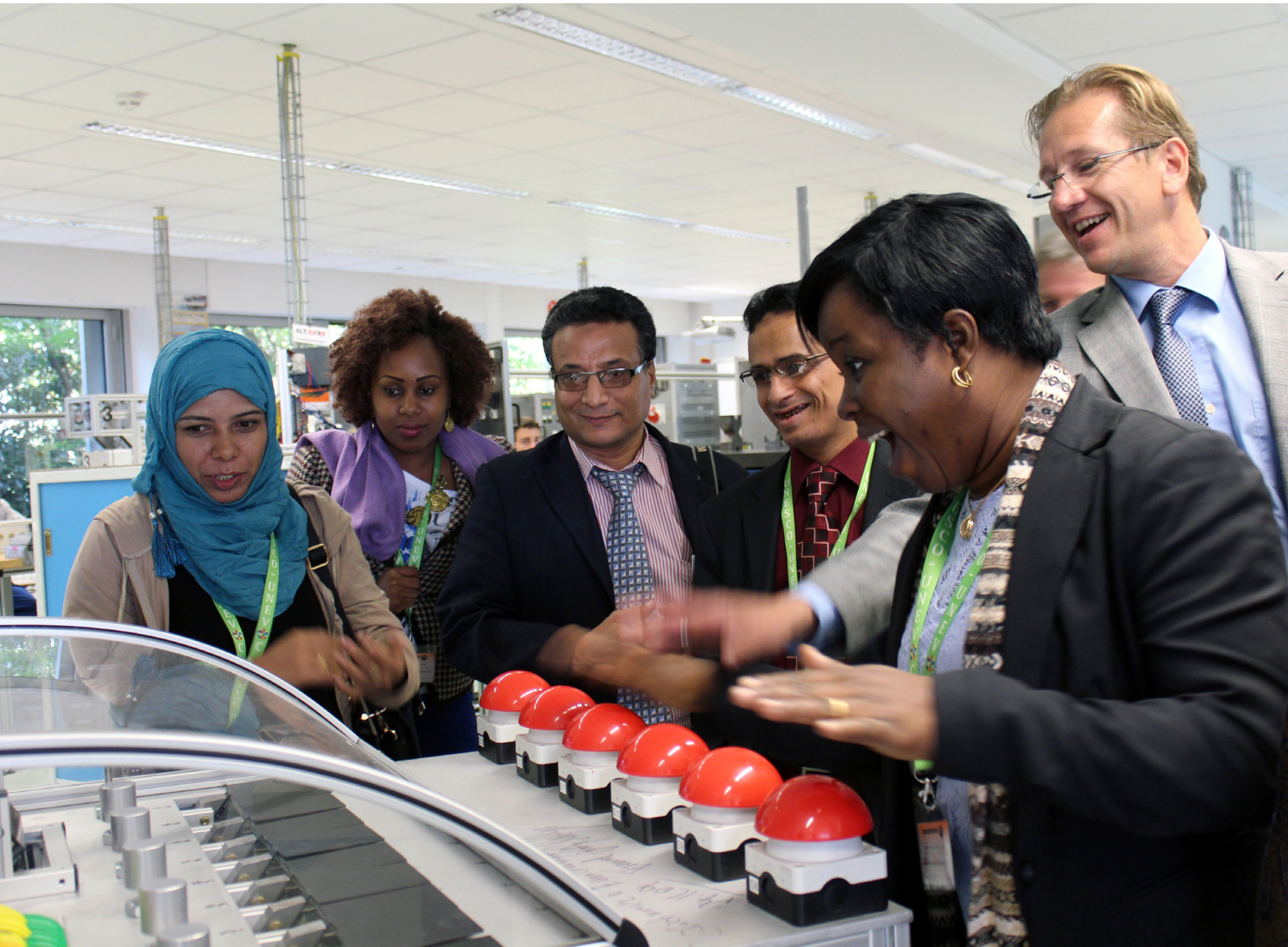
Delegates during one of the study tours