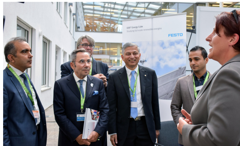
During the exhibition opening