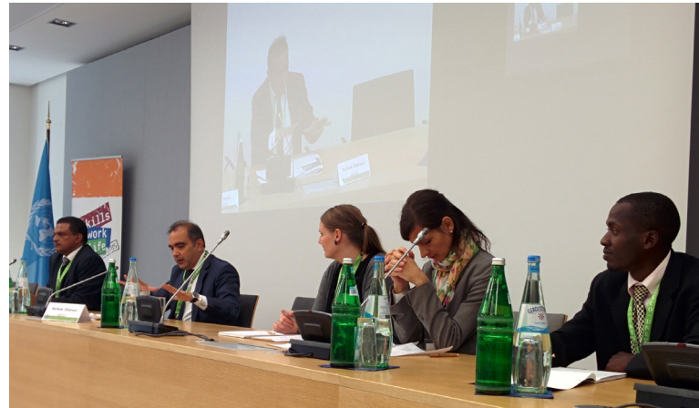
Panelist with youth representatives from Germany and Uganda

stakeholders. To achieve this, the quality and relevance of courses must be strengthened and improved. Mr Samuels argued that people will not look favourably on TVET institutions if their quality is not good or if they do not provide skills that make people effective in the labour force.