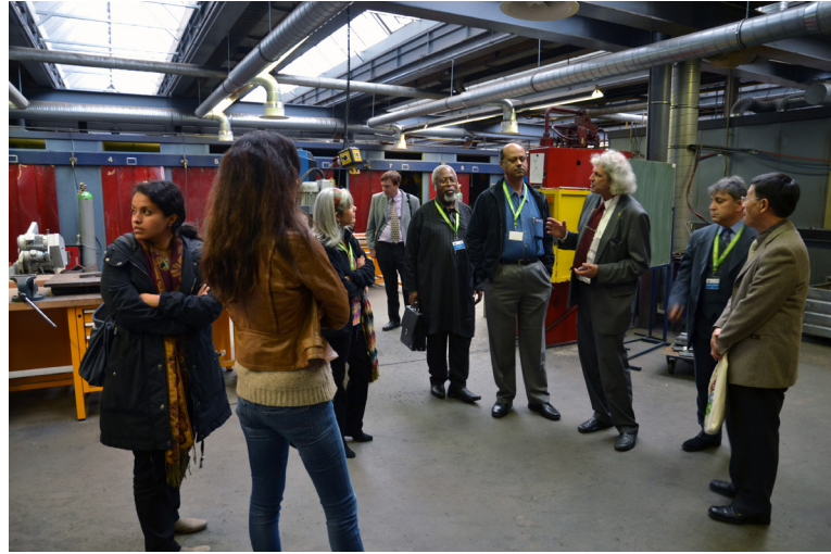
Participants during study visit

agenda. The Sustainable Development Goals (SDGs) underpinned multidisciplinary discussions at the forum and represented an important step forward in development thinking by bringing together sustainable development with poverty alleviation, inequality and technological change in a holistic account of how people's lives can be enhanced.