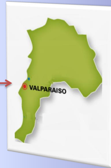
Valparaíso Region Central Zone of Chile