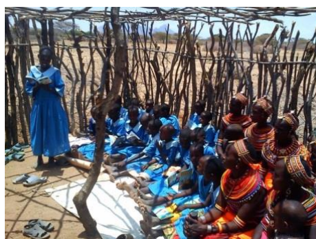
Figure 2 A ‘reading shed’ in East Africa