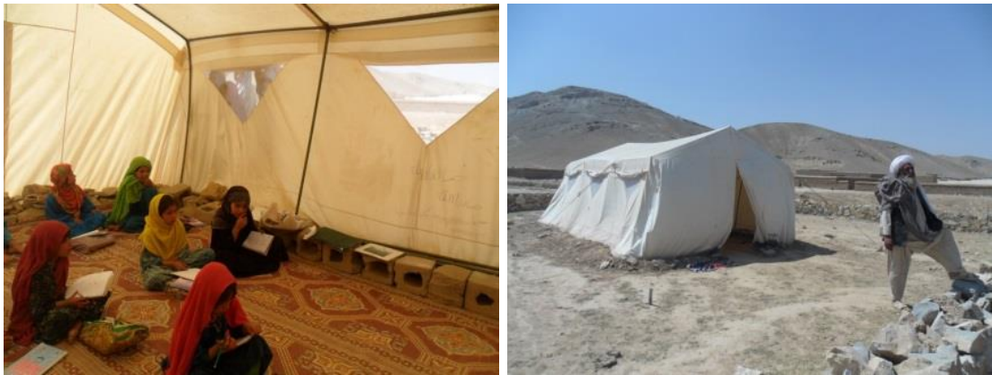
Figure 3 SCA tent provision and Kuchi children learning