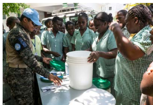
Distribution of filters to prevent water-borne diseases in Pilate

Failure to maintain the rapid response mechanism could result in longer or more severe outbreaks, and an increase in suspected cases.