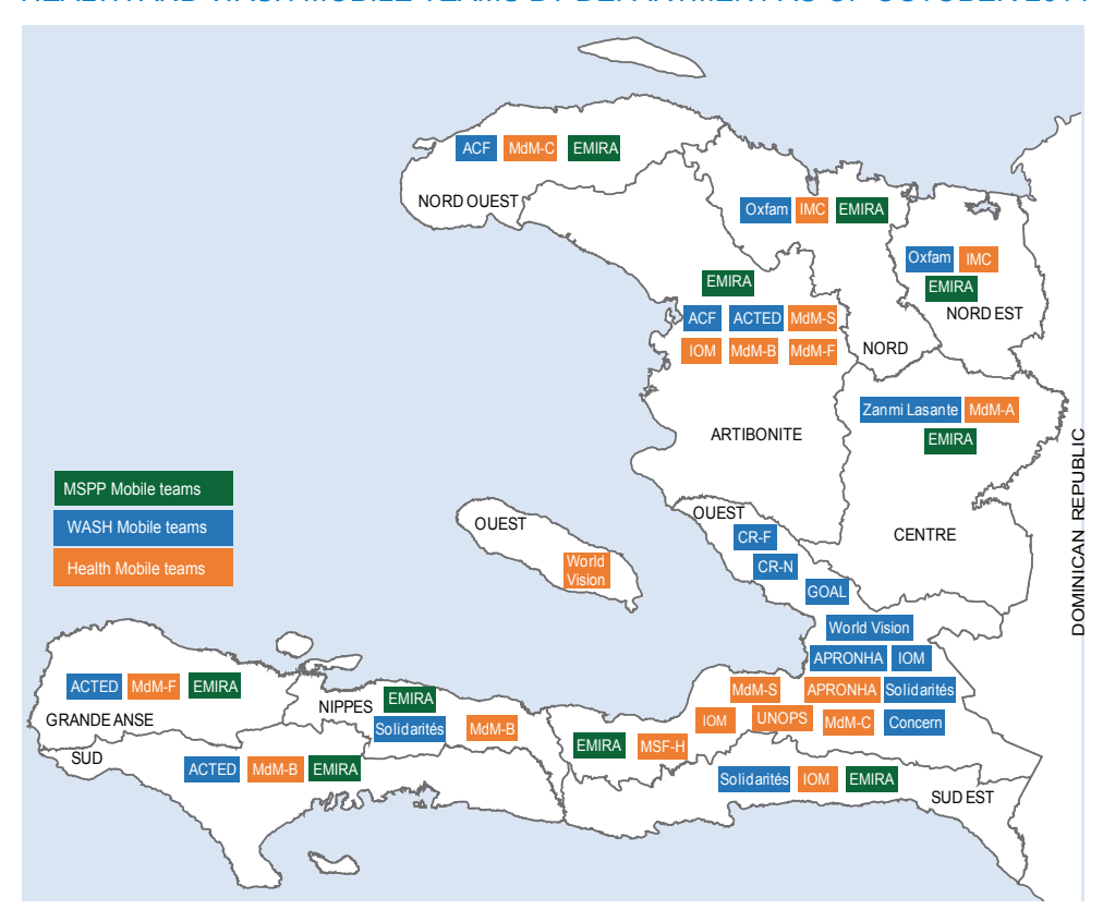
N.B.- Health mobile teams supported by PAHO/WHO WASH mobile teams supported by UNICEF