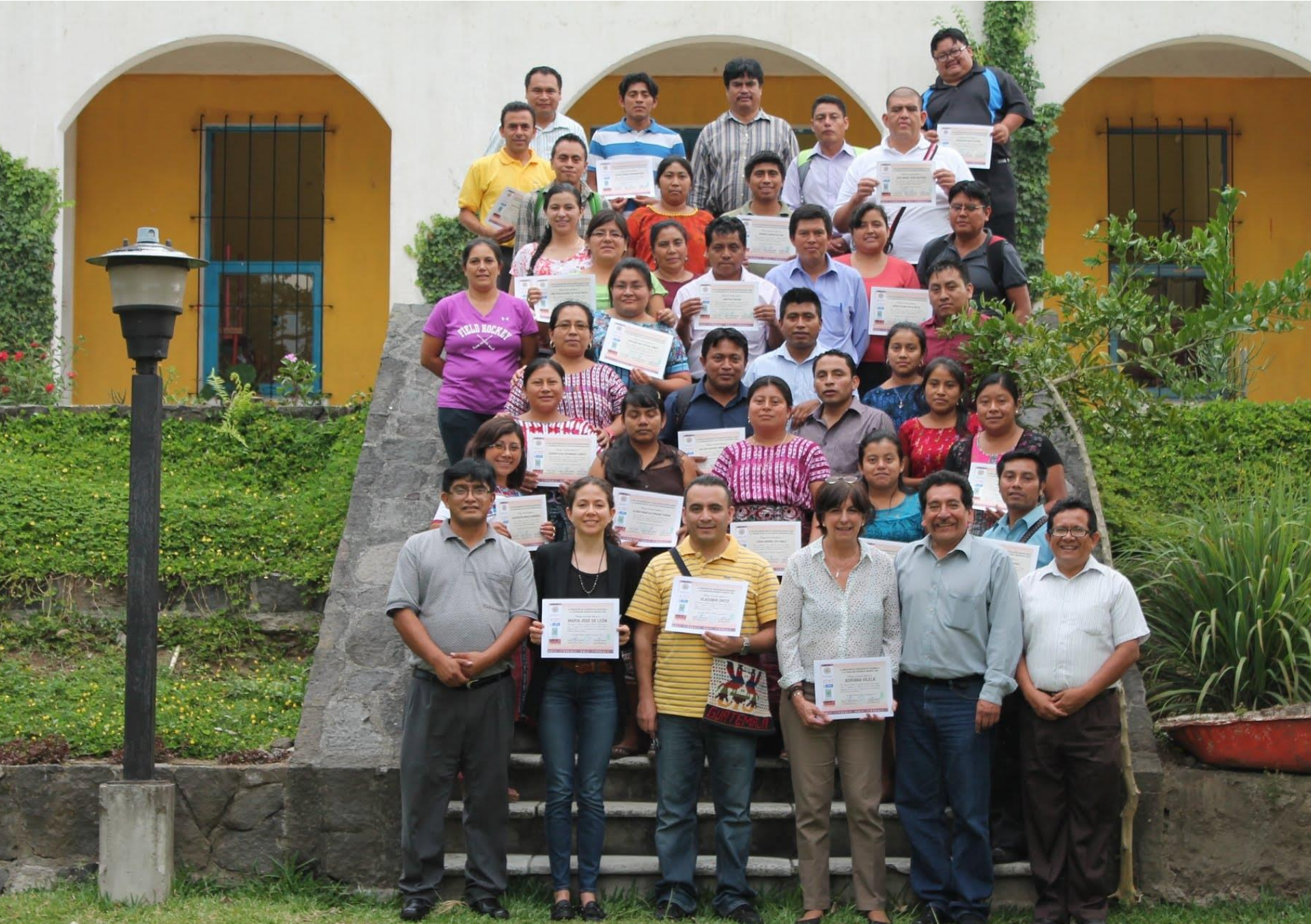
San Lucas Tolimán, Guatemala