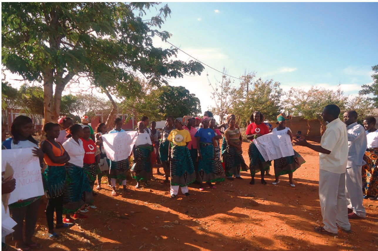
A moment from the campaign against domestic violence led by Progresso learners

The portable libraries are managed by the literacy facilitator with the support of his/her supervisor.