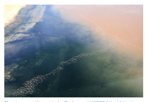
Flamingos gather at Lake Turkana, UNESCO World Heritage

Lake Turkana basin is also to be outstanding examples representing major stages of earth's history, including the record of life, significant on-going geological processes in the development of landforms, or significant geomorphic or physiographic features. It has been very valuable in the reconstruction of the paleo-environment from 4million to 10,000 years ago