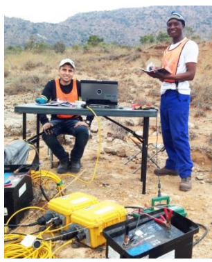
Students sets up the seismic system and collect GPR data for analysis.