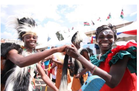
Artists, dancers, musicians, youth groups, students and school children from across Kenya come together, celebrating diversity of cultural expressions during the national event Masakazu Shibata