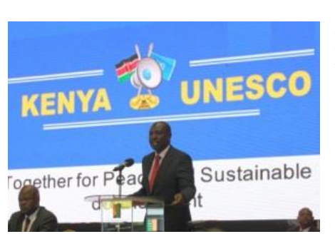
H.E. Deputy President William Ruto delivering the speech to mark the 50 years journey of UNESCO and Kenya

22 - 24 Oct 2014, Nairobi - Marking the 50 years of collaboration between UNESCO and Kenya, national celebrations took place in Nairobi, organized by the UNESCO Regional Office for Eastern Africa and Kenya National Commission for UNESCO (KNATCOM), together with the Government of Kenya. The celebration included activities such as exhibitions, cultural performances and presentations in which 23 counties and 49 exhibitors comprised of government institutions, universities, and private sectors took part showcasing UNESCO and Kenya's achievements under the theme, "Together for Peace and Sustainable Development". A Film festival was also organized in partnership with the Pan African Federation of Filmmakers (FEPAC), recognizing the importance of cinema and audio visual industries in the social, economic and cultural education. Read more..