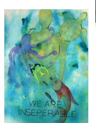
© UNESCO / Emma and Nour, Tunisa (14 years old), Collage work illustrating the beauty of ocean. She stressed the need to save our ocean resources in saying that "they are all that we have, they are our world."

© UNESCO / Lisette, Seychelles (18 years old), Winner of the competition highlighted the concept of the 'blue economy' that is currently being promoted by the Seychelles government to all countries worldwide