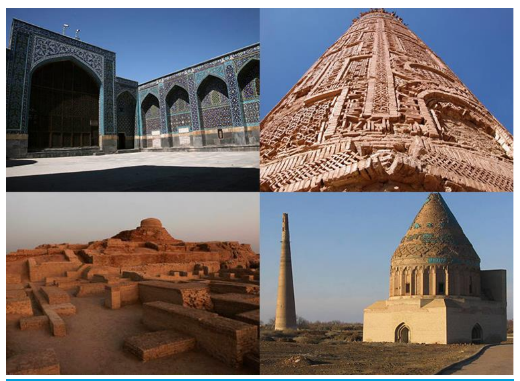
UNESCO TEHRAN CLUSTER OFFICE COVERING AFGHANISTAN, I.R. IRAN, PAKISTAN AND TURKMENISTAN