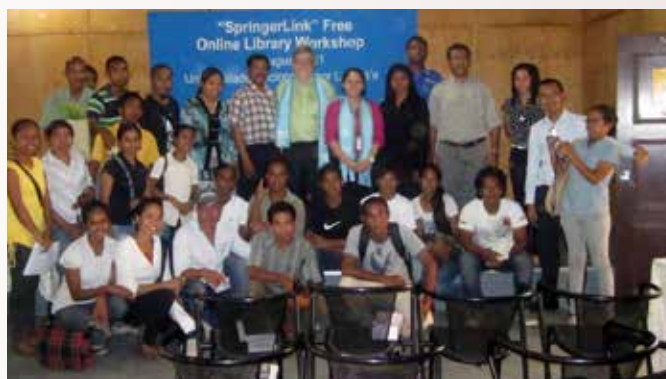
↑ "The Springer Link free online library workshop in National University of Timor Leste".