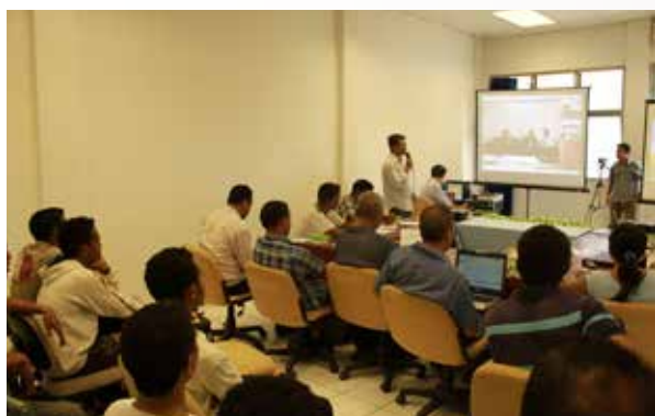
↑ The discussion session between remote participants during SOI Site - National University of Timor Leste inauguration ceremony.