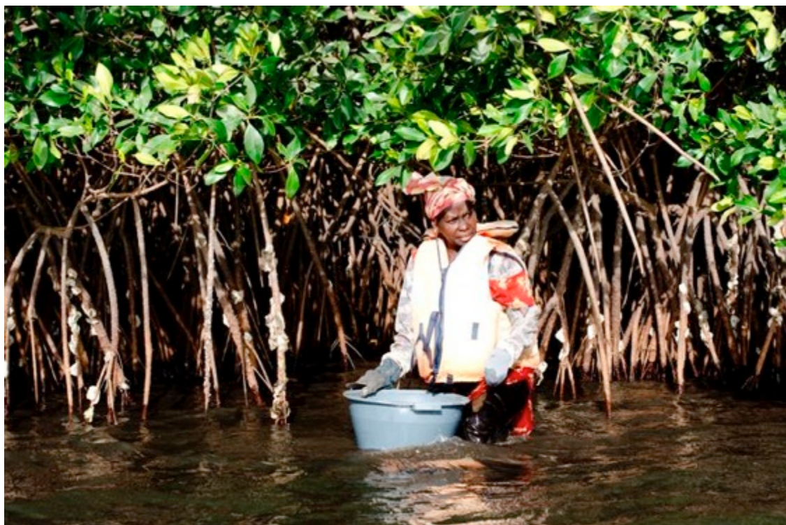
A Senegalese woman harvesting oysters.

UNESCO's major programme on National Sciences is echoed in two Priority Africa Flagship programmes: Number 3, aiming at harnessing Science, Technology and Information (STI) and knowledge for the sustainable socio-economic development of Africa. Number 4, on fostering science for the sustainable management of Africa's natural resources and disaster risk reduction (DRR).