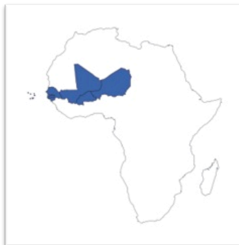
Location of the 7 countries covered by UNESCO Dakar

Throughout 2014, the UNESCO Dakar continued to coordinate education interventions in sub-Saharan Africa regarding the strengthening of Member States' national capacities in the area of sectoral planning and policy analysis, technical and vocational education and training (TVET), and the regional coordination to ensure political commitment for Education for All (EFA).