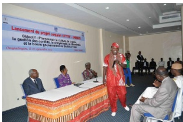
Slam session on peace issues during the launch of a new project to combat terrorism in Burkina Faso.

Beyond its outcomes in the ECOWAS Member States, ECOWAS achievements have raised interest from various partners. Project achievements are being reviewed for scaling up in the CEMAC region.