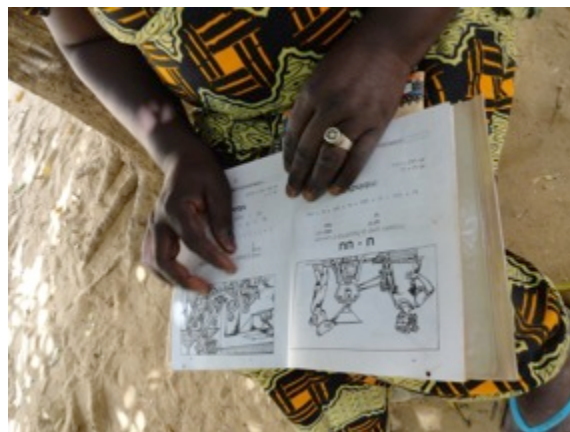
A woman learning to read in the Serere language as part of the PAJEF project

Moreover, 60 lessons in Wolof were broadcast on national television (RTS1). 135 classrooms and seven regional teacher training institutes (CRFPE) were equipped with digital interactive resource kits called 'Sankoré', 20 of which also received solar energy panels. This resulted in the training of 45 managers from national directorates, decentralized services of the Ministry of Education, civil society organizations and 150 teachers/facilitators. Subsequently, not only did the trainees expand the resource data bank, but did so in local languages, assuring the cultural relevancy of the teaching resources. UNESCO Dakar proposed a report and six videos to document the achievements of the project for advocacy purposes.