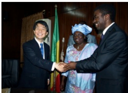
The signing of the education project for Malian youth took place in Bamako, May 2014

In Mali, UNESCO led the development of the terms of reference for the various preparatory studies to inform its next education sector plan. The terms of reference feature a study on teacher recruitment, training, management, and deployment, which UNESCO-CapeEFA and UNICEF will fund jointly. Also included is the design of an improvement plan for the EMIS that UNESCO offered to sponsor in January 2015.