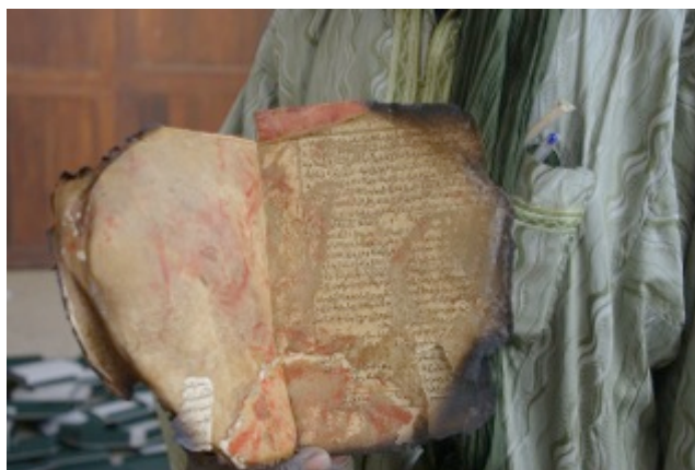
In Timbuktu, 4102 valuable manuscripts were burned, damaged or stolen, while several hundred thousand manuscripts had earlier been moved to Bamako by their owners in order to secure them.

Led by the National Bamako Office, a major effort has been made to restore and rehabilitate a certain number of World Heritage Sites, including mosques and mausoleums destroyed during the recent conflict in northern Mali. To implement this ambitious project, $3,000,000 have been mobilized in particular from Switzerland and the European Union.