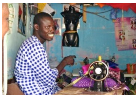
Vocational training reduces unemployment in Africa

The Economic Community of West African States (ECOWAS) Inter-Agency Task Team (IATT) mechanism 1 is a response to the lack of coordination and synergy between TVET actors at the regional and sub-regional levels. This sub-regional process brings the relevant actors together to streamline interventions for improved coherence and effective service delivery to the countries. Advocacy interventions under the IATT have raised the TVET profile and strengthened the capacities of ECOWAS and WAEMU 2 to define