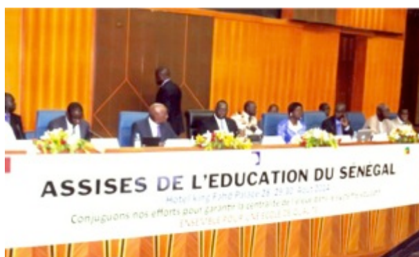
UNESCO played a prominent role in the National Conference on Education in Senegal

UNESCO Dakar supported countries to carry out a sector analysis in preparation for Global Partnership for Education (GPE) applications or for the development of their education strategy. Also facilitated by the Office were training activities in the areas of education policy, planning, and statistics provided by UNESCO's specialized institutes. Support for the design and implementation of education management information systems (EMIS) was provided to a number of Member States upon request. Additionally, UNESCO Dakar built institutional capacities for planning at the provincial and district level, improved and updated countries' capacities in the completion and reporting on EMIS, supported collection and analysis of data on public financing of education, and targeted interventions to improve the coverage and quality of indicators on educational finance.