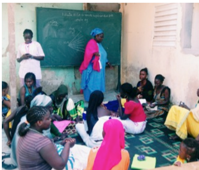
Teaching literacy in Wolof in Pikine, a suburb of Dakar

The final evaluation report has stressed PAJEF innovative methods and educational approaches that will serve as good practice to help other countries upscale their LNFE interventions to target out-of-school children and girls and women as well. Delegations from the Gambia and Nigeria came to Senegal on PAJEF study visits in 2014. Nigeria has already started implementation of a similar girls' literacy project, and the Gambia is designing a similar project to start in 2015.