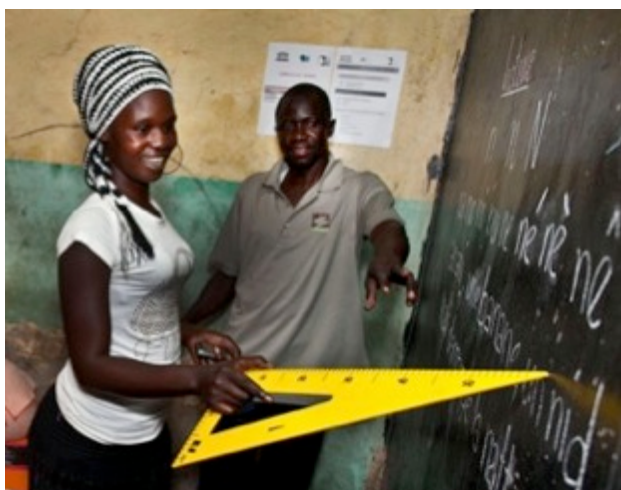
A teacher and student work together during literacy classes in Senegal.

Regarding the CapEFA project in Burkina Faso, a capacity improvement plan was developed and