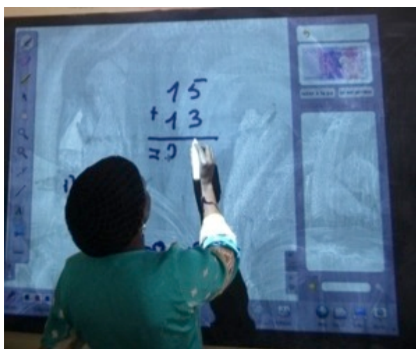
A teacher using a digital board to teach mathematics

In Guinea Bissau, UNESCO Dakar led policy dialog and advocacy resulting in the country's readiness to enter the LNFE policy elaboration phase.