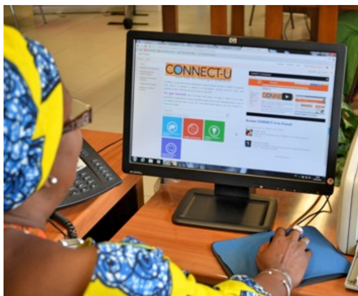
CONNECT-U is being used to promote knowledge sharing throughout the field offices in Africa

In 2014, KMS also planned and established a Service Centre in UNESCO Dakar, a task force that brought together all programme assistants, eliminating the need for individual assistants to be assigned to one programme sector. Utilizing the task manager on the Office collaborative space, assistants are assigned work according to tasks requested by any programme specialist in the Office. This innovative approach to programme support is just one initiative KMS is promoting in order to break down workplace silos.