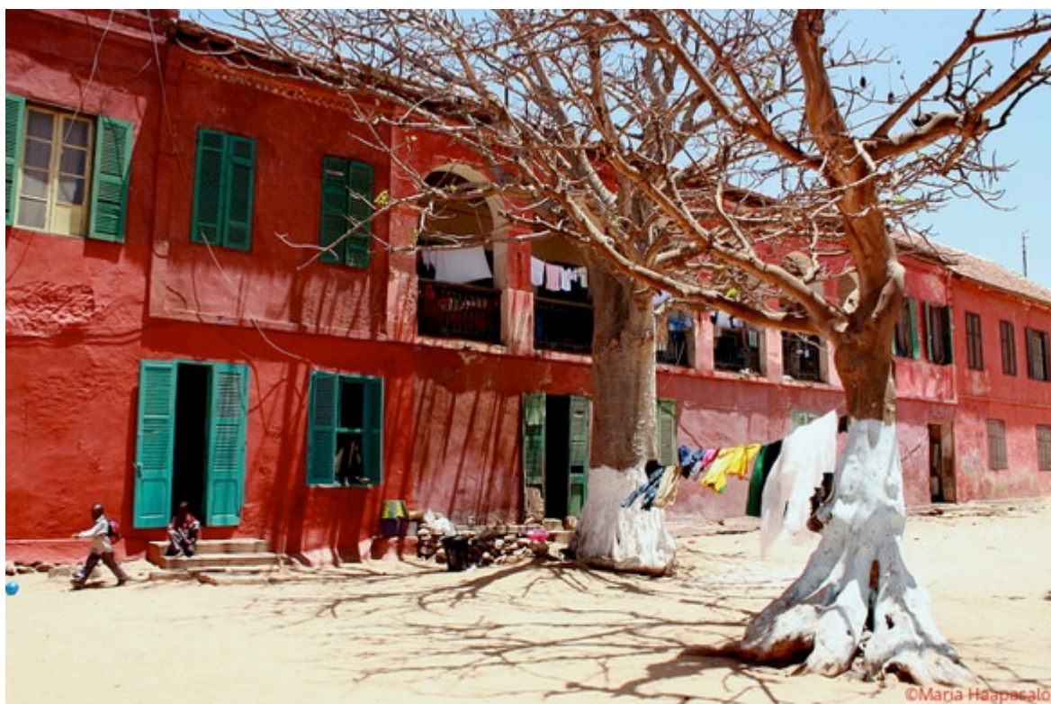
Gorée Island, a site of memory looking towards the future.

UNESCO's culture program aims at protecting, promoting and transmitting heritage, as well as fostering creativity and the diversity of cultural expressions. UNESCO's Cultural Conventions 22 provide the overall framework for action and contribute to harnessing the power of culture for sustainable development and peace in a context of regional integration.