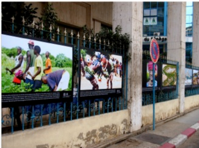
The "Landscapes of Culture" photo exhibition was featured on the fence just outside the former UNESCO Dakar Office in downtown Dakar

Moreover, as part of the follow-up of the joint US$ 6.5 million MDG-F program "Promoting cultural initiatives in Senegal," sustainability measures have been put in place for the two recent World Heritage Sites of the Saloum Delta (2011) and the Bassari country (2012) and their brand new Interpretation Centers. Interpretation Centers are designed to serve as venues to explain visitors