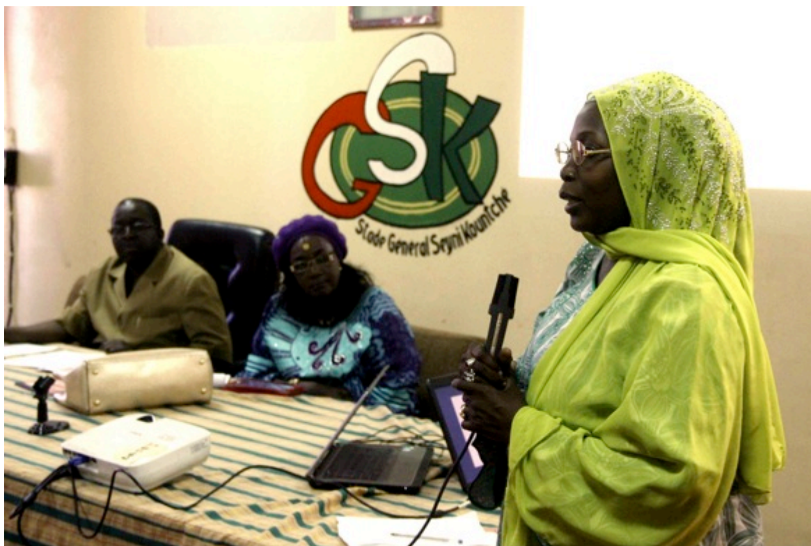
Scene from an inclusion workshop in Niger to promote efficient and inclusive policy and programming that is sensitive to the needs of disadvantaged populations

UNESCO's programme on Human and Social Sciences focuses on a much-needed cross-cutting and reflective approach to development, as social and human dimensions are inherent to the challenges of a rapidly changing world. In times of increasing global challenges and threats such as inequality, exclusion, violence, and sectarianism, learning to live together among all members of the global community becomes more important than ever before.