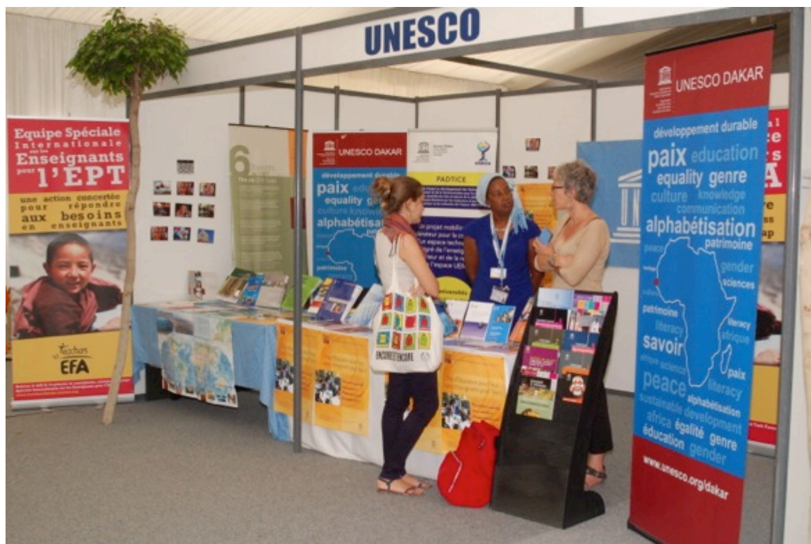
KMS managed the UNESCO booth at the summit of the Francophonie in Dakar

Knowledge Management Services (KMS) in UNESCO Dakar is the only unit in Africa dedicated to knowledge management and knowledge sharing (KM/KS). Thus KMS is not only concerned with initiatives in the Dakar Office, but is also leading KM/KS innovations throughout UNESCO's offices in Africa. KMS handles all activities related to media relations, public information, and knowledge sharing. It also runs the UNESCO Dakar Research Centre, providing content management and oversight to websites and virtual platforms, advises on records management practices, and organizes learning opportunities and training sessions.