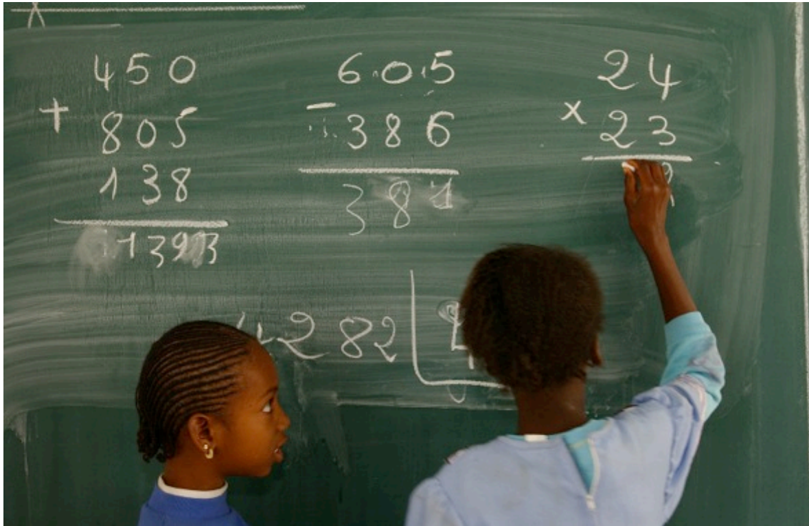
The quality of education is a challenge throughout Africa.

This first major program is echoed in the second flagship project of the Priority Africa operational strategy, which documents the specific education systems that require improvements in the equity, quality, and relevance of education. As a result, these systems are able to contribute to sustainable development in Africa.