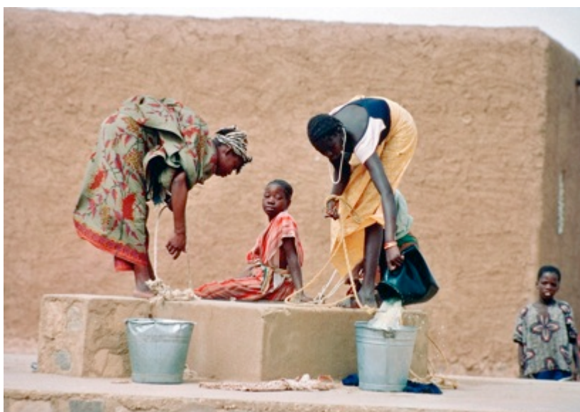
The development of groundwater resources is a major priority in strengthening freshwater security.

UNESCO Dakar contributed towards the achievement of one of the objectives of the UN Sahel strategy on regional water resources management. 27 managers of water systems and university researchers from Burkina Faso, Guinea Bissau, Mali, and Senegal participated in a 10-day training workshop on water management in the Sahel region. They received training in the identification, assessment, and development of groundwater resources that are of low vulnerability to drought and can be used in emergency situations. This is of crucial importance for immediate emergency relief and long-term