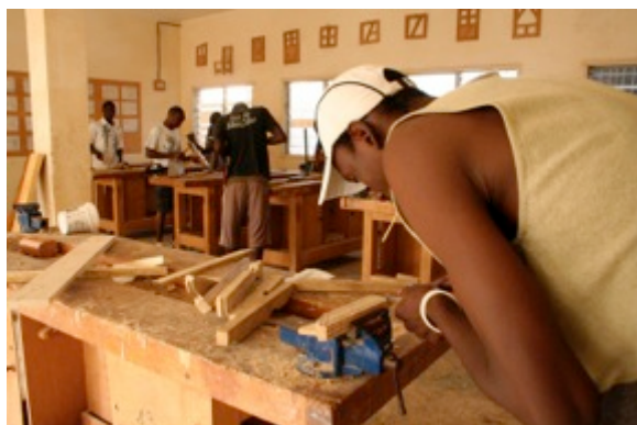
A young worker benefits from TVET in Senegal.

Another example of the Literacy-TVET synergy is a new project in conflict affected northern Mali 6 . The aim is to equip vulnerable and out-of-school youth in Mopti, Timbuktu, Gao, and Kidal with