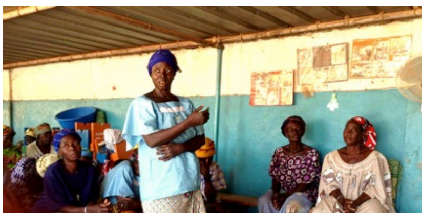
Women excluded from their community due to allegations of witchcraft, Delwende Centre, Burkina Faso

In 2014, a UNESCO Dakar consultation mission to Burkina Faso resulted in the backing of a strong coalition to support these stigmatized women. The coalition consists of governmental authorities, the UN System, CSOs, religious and traditional leaders, and active members of the outgoing scientific committee. In terms of economic empowerment, the women have benefitted from support to engage in income-generating revenue activities, namely market-gardening production. To ensure the marketing of these products, UNESCO Dakar strategically paired the women with another group of vulnerable women (PALIGWENDE) who will ensure an outlet to sell their products. In this manner, the two groups are being supported with one intervention that fosters solidarity among them. Another important part of the project is to organize the women, giving micro credit, encouraging savings, building their capacity, and promoting solidarity to fight against exclusion and