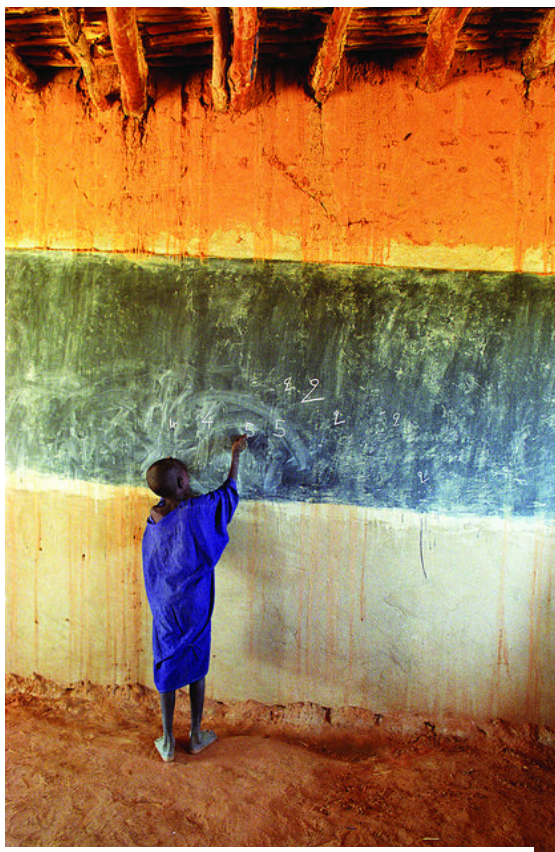
Child in the classroom of Tintihigrene school, Mali.

strategies for post-2015. UNESCO Dakar provided analytical quality assurance of all documents for all its cluster countries and SSA countries that participated.