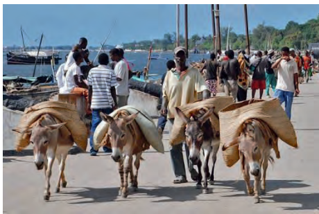
Lamu is the only one of the Swahili settlements and seaports that has constantly been inhabited for over 700 years.