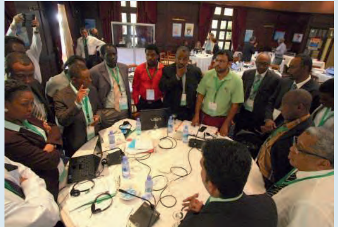
Participants, including the representatives from 23 member states, UN agencies, regional programmes, NGOs and experts in marine science celebrate the closing of the session