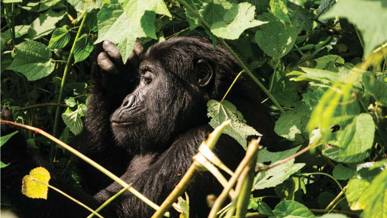
Around half the world's mountain gorillas live in Bwindi Impenetrable Forest National Park.

and this particularly small gorilla group was more susceptible to infection because of stress from being tracked and viewed by tourist groups (Kalema-Zikusoka et al. 2002). If climate change causes increases in poor health amongst human populations around the park, which, for example, has been suggested as likely for a marginalized and poor local Batwa community (Berang-Ford et al. 2012), this could increase the risk of human-to-gorilla transmission of infections. Pioneering efforts, such as those of the NGO Conservation Through Public Health, to increase community health and awareness in local villages and track gorilla health in order to reduce the risk of disease transmission and outbreaks are important, and several have been successfully under way for a number of years.