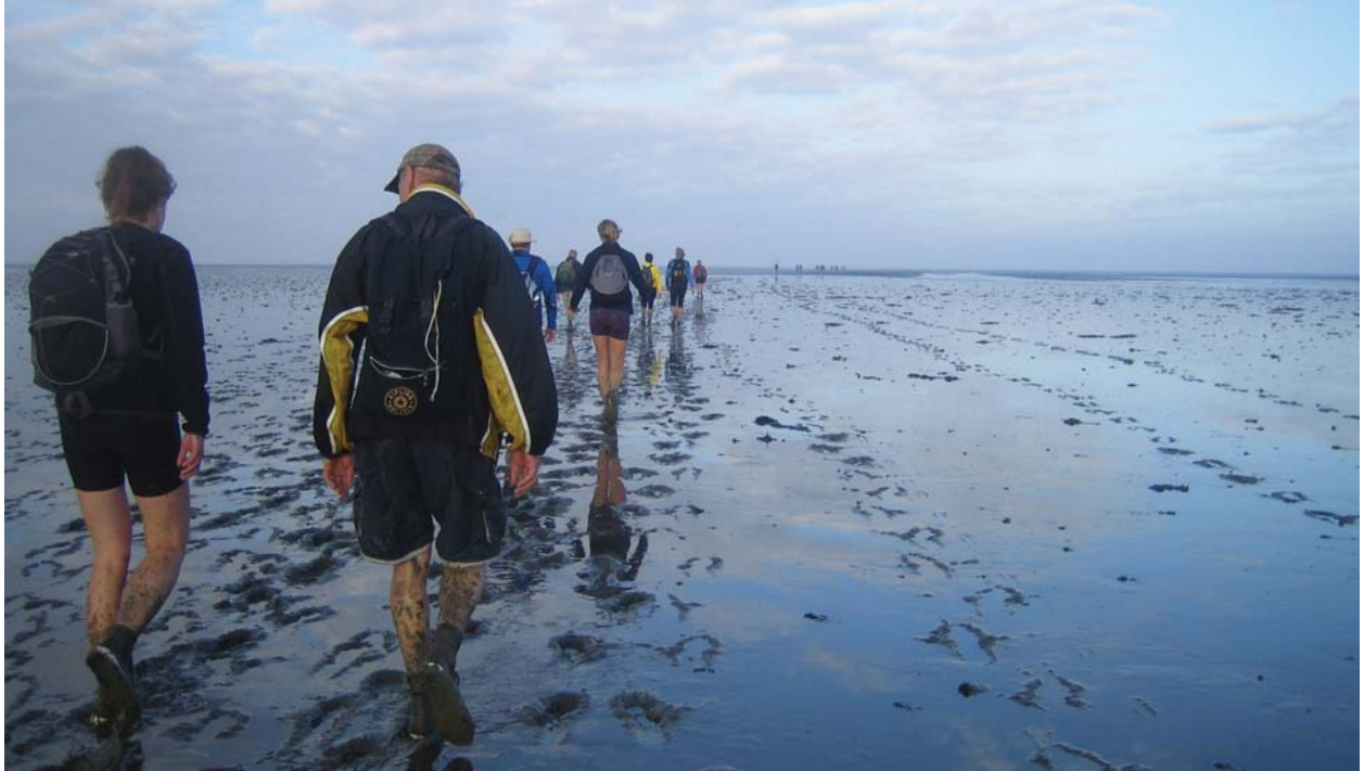
The Wadden Sea attracts about 10 million visitors a year.

may cause a loss of intertidal flats and salt marshes, leading to a decline in foraging and nesting possibilities for migratory and breeding birds (MELUR-SH 2015; Bairlein and Exo 2007; Brinkman et al. 2001). As a result of temperature rise, the plankton at the base of the food web may change, which could lead to changes higher up in the food web, including lower reproduction levels of fish populations and decreasing bird populations (NEAA 2014). In an ecosystem as complex as the Wadden Sea, the effects of climate change may also result in a cascade of yet unknown but wide-ranging changes.