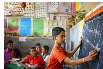
Learning in Bangladesh at the Unique Child Learning Center

Such a project is relevant to the needs of the community and complements the curriculum. Positive changes have been made in the school environment and contribute to the promotion of peace.