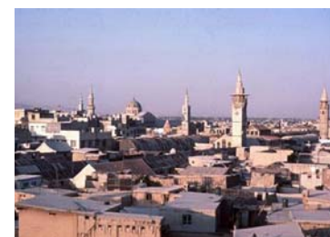
The Ancient City of Damascus