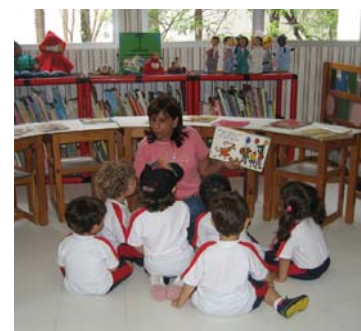
Kindergarten children in Brazil listen to a story

Time and again projects drew attention to the changes in attitude which occurred not only in students, but in teachers, parents and decision-makers. A number of projects brought out the best in students including those with learning difficulties. Children and young people have become more open-minded and interested in other cultures and lifestyles and have committed to combating prejudice, stereotypes and discrimination. They are less likely to judge people based on their looks, language or