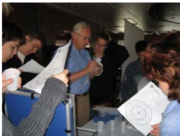
Teachers from different European countries unpack new resource material