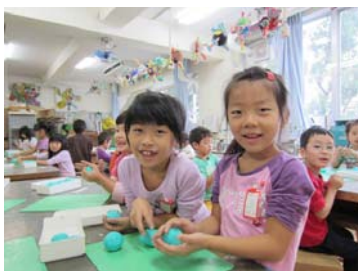
Japanese students during an art class