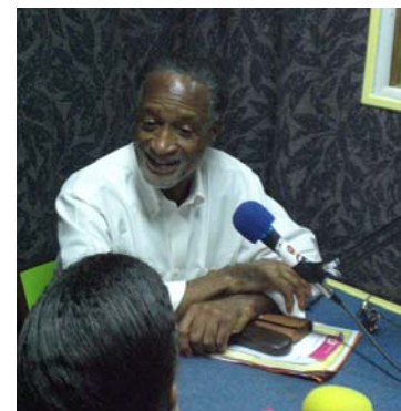
A guest from Montserrat participates in the radio interview