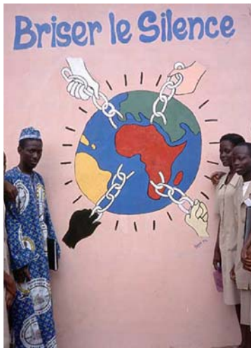
"Breaking the Silence" Project in Benin

http://www.unesco.org/new/en/education/networks/global-networks/aspnet/ flagship-projects/transatlantic-slave-trade/