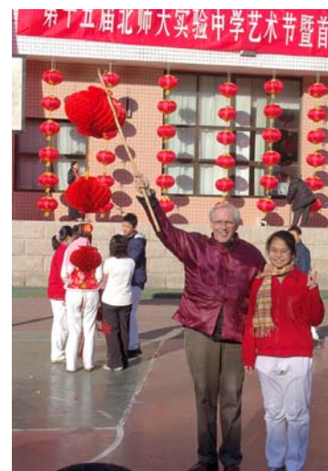
International exchange programme