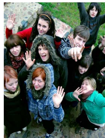
Intercultural workshop

This project is a good example of fruitful collaboration between education and the non-formal sector, i.e. working with non-governmental organizations. It was also very