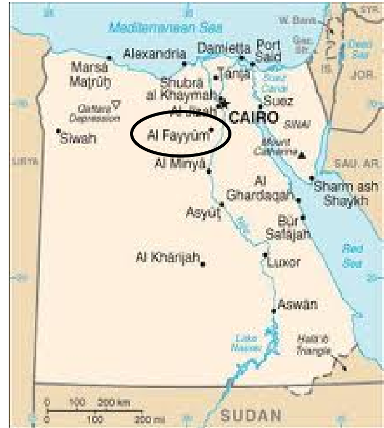
Map of Egypt