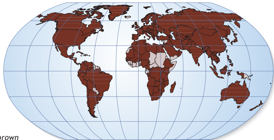
World map showing countries involved in IGCP projects in brown

The IGCP Secretariat is based in UNESCO's Ecological and Earth Sciences Division. The Secretariat manages the Programme and communicates with the IGCP Bureau, project leaders, National Committees, members of the Scientific Board, Initiators (IUGS and UNESCO), UNESCO regional offices and with sponsors. It organizes regional meetings to stimulate interest and participation in IGCP activities, facilitates publication of IGCP documents, and is responsible for the IGCP website ( www.unesco.org/science/earth ) as well as organising the annual IGCP meetings.