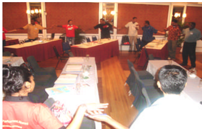
Group activity at a 5-minute break during presentations

All the three sessions were done on power point and were very participatory as the young leaders asked questions and shared the experiences that they have gone through with regards to the three issues being discussed; young people in decision-making processes, environmental sustainability and HIV/AIDS.