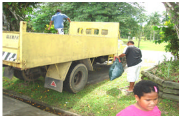
Rubbish bags ready for loading onto the truck straight for the dump.