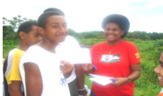
Volleyball & the Peer Educators.