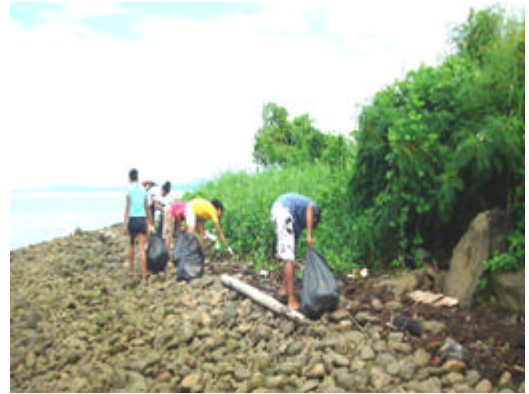
From a dirty to a clean environment