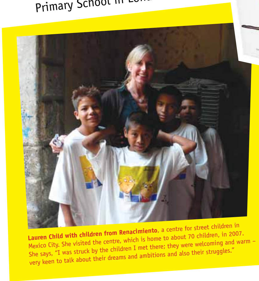
Lauren Child with children from Renacimiento , a centre for street children in Mexico City. She visited the centre, which is home to about 70 children, in 2007. She says, "I was struck by the children I met there; they were welcoming and warm – very keen to talk about their dreams and ambitions and also their struggles."

Lauren Child is the award-winning author and illustrator of over 30 books. She is the creator of Clarice Bean , Charlie and Lola , and That Pesky Rat . In 2008 she launched the My Life is a Story campaign with UNESCO's Programme for the Education of Children in Need to help excluded and deprived children all over the world. Both Lauren and Hachette Children's Books, the publisher of That Pesky Rat have given all their profits from the sale of the book to UNESCO. In December 2008 Lauren was named an Artist for Peace for UNESCO.