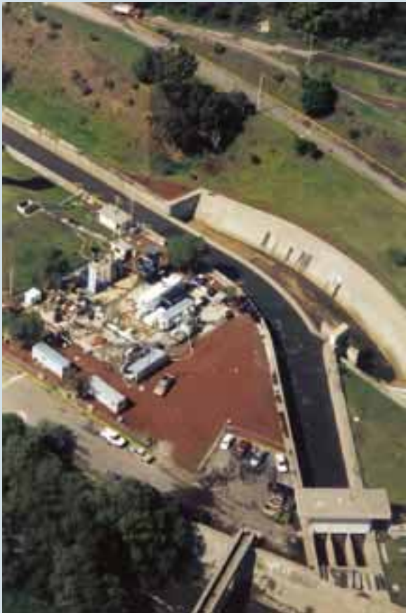
Main Drain Collector which handles stormwater and wastewater flows from 60 to 300 m 3 /s from Mexico City.

Mexico City is located in a closed basin at an elevation of 2,240 meters above sea level (masl). The city's 19 million inhabitants belong to two political entities: the Federal District and the State of Mexico. The City uses 69 m 3 /s of water (62 m 3 /s is distributed in bulk with 7 m 3 /s pumped directly from the aquifer for irrigation). Sixty-seven percent of the water comes from the aquifer, 21% from the Cutzamala River (in the Valle de Bravo at 1,200 masl and 150 km of distance), 10% from the Lerma aquifer (located in the Toluca Valley at 2,300 masl and 70 km away) and