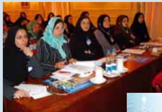
RCUWM-Tehran Workshop on "Promotion of Women's Participation in Water Management", 23-24 Feb 2005

The functions of RCUWM-Tehran are to promote scientific research, create and develop networks for scientific, technical and policy information exchange, develop and coordinate cooperative research activities on urban water management, organise knowledge and information transfer activities; develop a strong programme of information and communication of technology, provide technical consulting, effective capacity building activities, and advisory services in the region and beyond; as well as produce technical publications and other media activities.