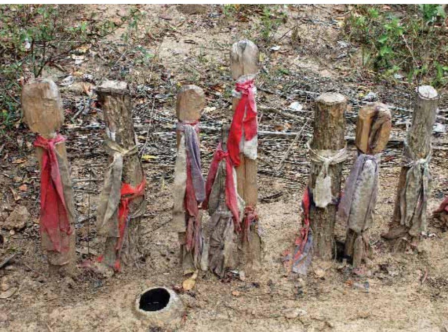
A burial site at Kaya Giriama marked by wooden memorial stakes called koma. Praying or Kuhasa Koma helps maintain the close relationship between the living, the dead and nature.

Representing the communities, the Council of Elders gave their full consent for elements of their traditional practices to be nominated for inclusion on the Urgent Safeguarding List.