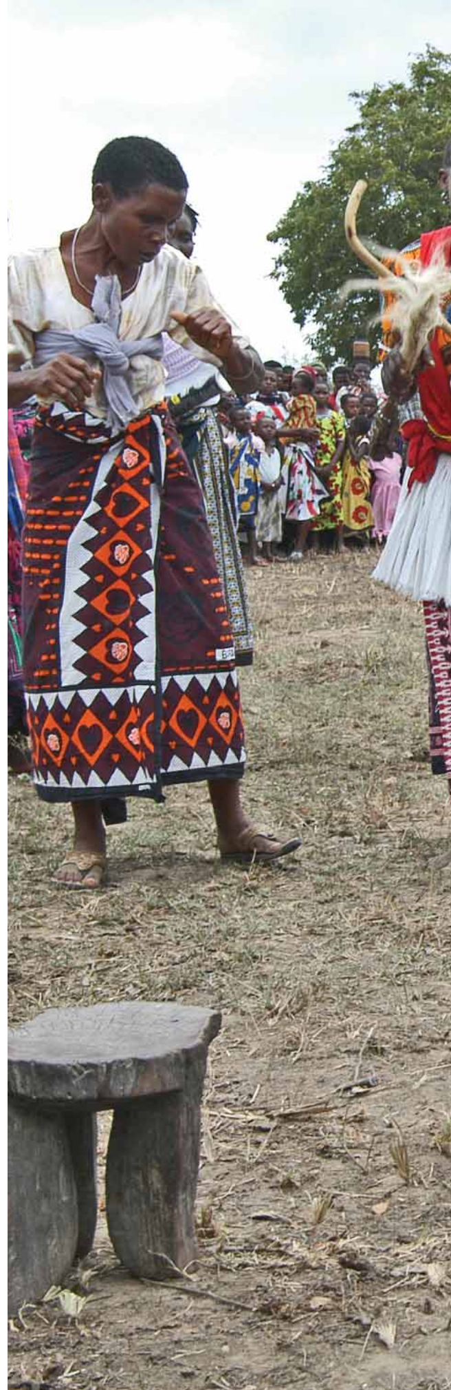
A dance drama at a burial site in Kaya Giriama, marked with carved wooden koma placed on the graves.

National authorities recognized the role of the Councils of Elders and involved them in consultations pertaining to security and socio-cultural issues in Kaya communities. The Councils agreed to participate fully in activities related to the safeguarding of traditional practices and the conservation of the Kaya forests, strengthen their Councils by including new and younger practitioners, and report to local authorities any destructive activities occurring within the forests.