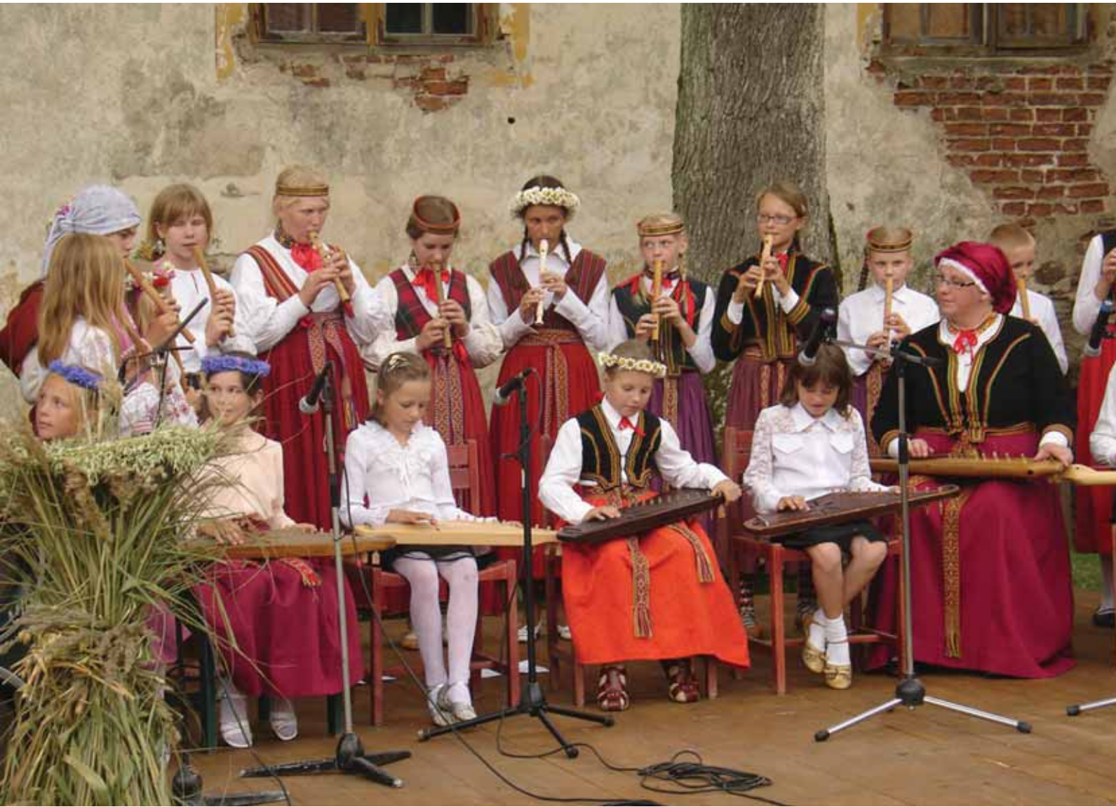
Suiti children play the recorder and the kokle zither, under the watchful eye of their teacher.