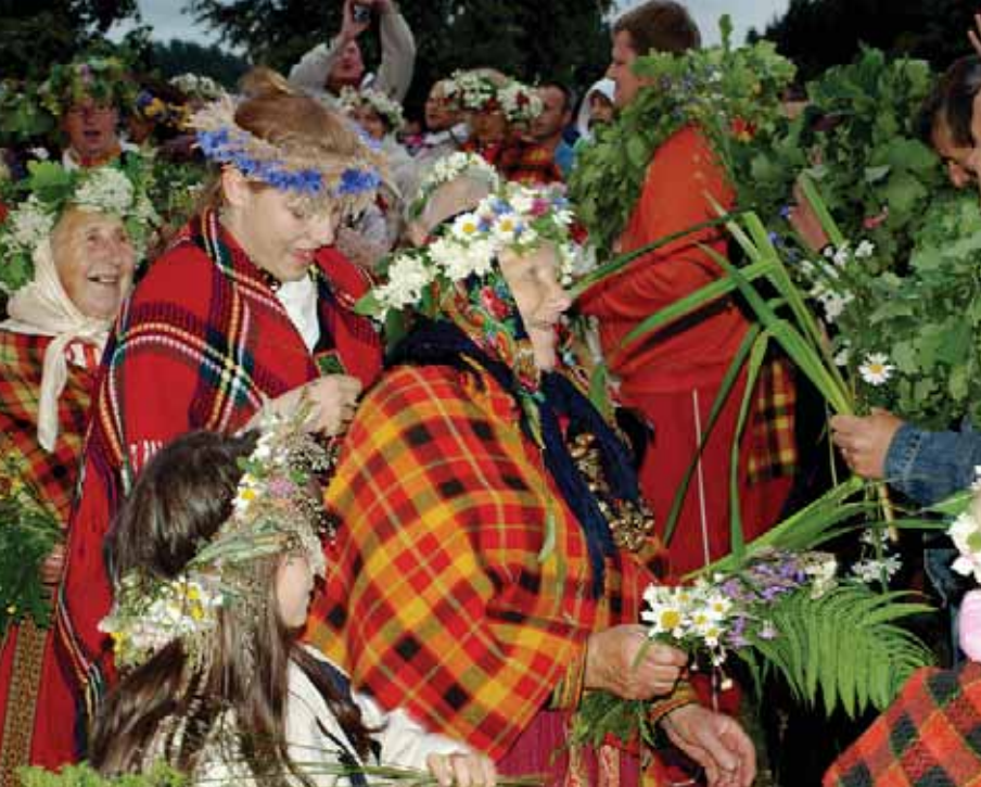
Joy and merry-making mark Midsummer – an important celebration in the annual Suii calendar.

community meeting in August 2008. About seventy people from the community joined the meeting and unanimously agreed to the nomination process.