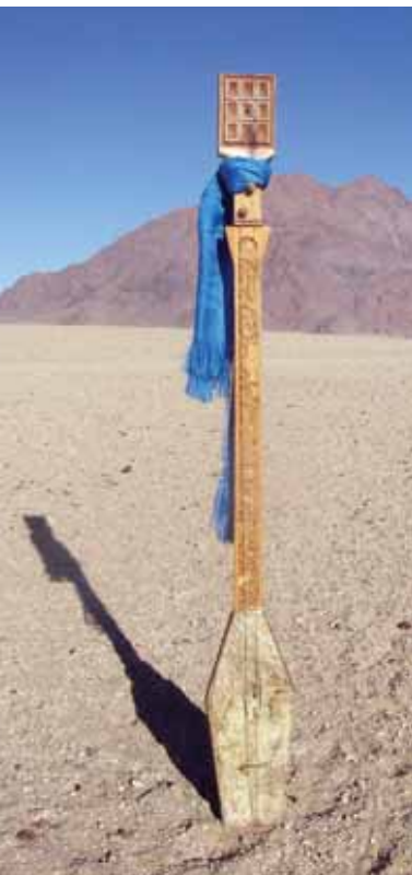
A Western Mongolian two-stringed lute called the tovshuur.

In recent years there have been a number of activities to promote and safeguard Mongolian Tuuli. Measures to identify and support epic bearers were initiated as part of a Mongolian 'Living Human Treasures' programme, while the Institute of Language and Literature of Mongolia has organized academic meetings and workshops on the safeguarding of traditional epics, and made available the texts of epics in its serial publication Mongolian Folklore Session . An international symposium on the 'Central Asian Epic' was organized in 1998, which not only enhanced public awareness, but also encouraged epic performers to exchange experiences and improve their skills. Meanwhile, on the educational front, certain popular epics have been incorporated into secondary and high-school curricula, and two Uriankhai epic singers are working as schoolteachers and training apprentices.