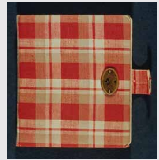
Anne Frank's first diary. The diaries of Anne Frank were included in UNESCO's Memory of the World Register in 2009

Many educators have found a cross-curricular approach to this history to be immensely useful. Combining and utilizing accurate historical, literary, artistic, and musical materials provides a meaningful way for students to use knowledge learned in one context as a knowledge base in other contexts. For instance, after an historical study of Auschwitz, if students read Primo Levi's short stories, Lilit e altri racconti , they will be able to place them in a more meaningful context.