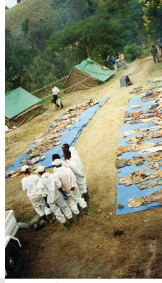
Mass grave in Rwanda