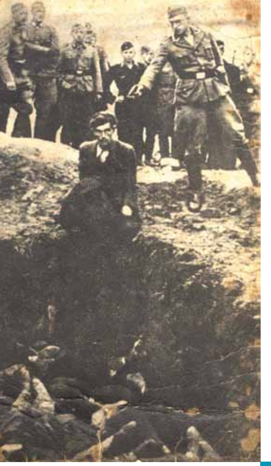
Vinnitza, Ukraine, German soldiers watching an Einsatzgruppen soldier murder a Jew, July 1941

in attacking and almost destroying the Jewish population, not only of Germany but of most of Europe, will raise awareness about the roles and responsibilities of the State, of individuals and of society as a whole in the face of increasing human rights violations. An examination of the actions of German doctors and nurses in the so-called "Operation T4" euthanasia program of Nazi Germany (which led to the killing of more than 200,000 mentally or physically disabled men, women, and children over six years) is another example. Likewise, the participation of regular German soldiers in the killing of over one million Jews as part of the work of the Einsatzgruppen (special killing squads) in the eastern parts of Europe, leads to questioning human behaviour, conformism and the power of ideologies; in short, the adhesion of a society to a government undertaking actions that violate internationally recognized human rights. Educating about the Holocaust can help young people to understand key concepts that will be useful when studying other examples of mass violence. When pupils explore the history of other massive human rights violations, they will be able to draw on their understanding of the Holocaust and become more aware of their own responsibilities as global citizens.