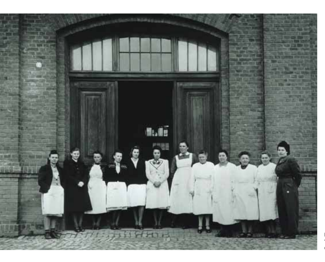
Nursing staff at the Hadamar "euthanasia" centre, Germany