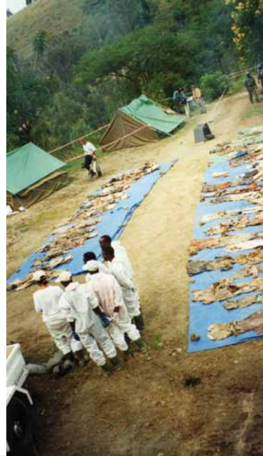
Mass grave in Rwanda

What can be learned about preventing genocide and mass atrocities through study of the Holocaust and other Nazi crimes?