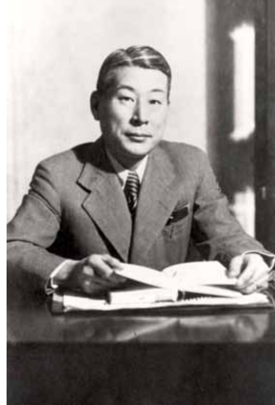
Chiune Sempo Sugihara, the Consul General of Japan in Kovno, issued more than 2,000 visas, thus helping Jewish refugees escape Europe.

On another level, this power of action can be seen for instance in the deeds of some religious leaders to challenge the “T4 euthanasia” policy of the Nazi leadership to murder disabled people in the German Reich. Remarkable also are the actions of the non-Jewish German women who, in February 1943, protested against the arrest of their Jewish husbands in the so-called “Rosenstrasse” demonstrations. Their protests intensified until the men were released in March 1943. These examples demonstrate that constructive individual and collective action can sometimes positively influence oppressive regimes that deny their citizens basic human rights.