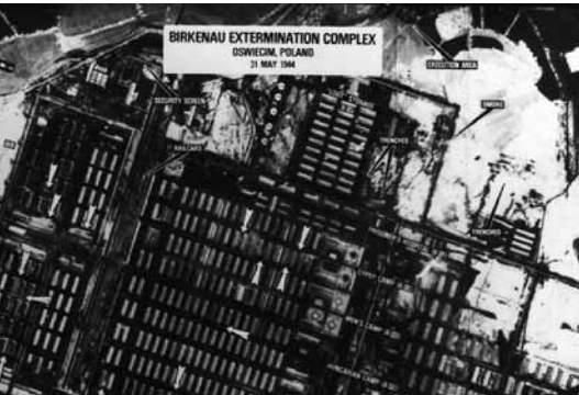
The Auschwitz-Birkenau German Nazi Concentration and Extermination Camp was inscribed on the UNESCO World Heritage List in 1979

The use of radios in the genocide of the Tutsi in Rwanda in spreading racist propaganda and helping killers to identify victims also makes this unmistakably clear. Such awareness of the power of technology can help students when examining contemporary issues of human rights violations which, in turn, can lead to political action to prevent such violations. This is important given the profound changes in technology over the past years.