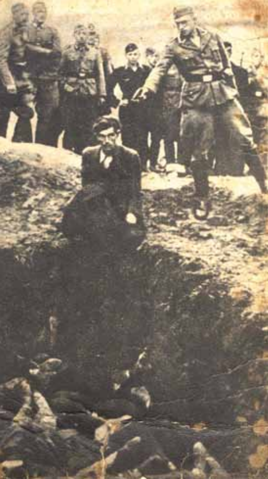
Vinnitza, Ukraine, German soldiers watching an Einsatzgruppen soldier murder a Jew, July 1941

in attacking and almost destroying the Jewish population, not only of Germany but of most of Europe, will raise awareness about the roles and responsibilities of the State, of individuals and of society as a whole in the face of increasing human rights violations. An examination of the actions of German doctors and nurses in the so-called "Operation T4" euthanasia program of Nazi Germany (which led to the killing of more than 200,000 mentally or physically disabled men, women, and children over six years) is another example. Likewise, the participation of regular German soldiers in the killing of over one million Jews as part of the work of the Einsatzgruppen (special killing squads) in the eastern parts of Europe, leads to questioning human behaviour, conformism and the power of ideologies; in short, the adhesion of a society to a government undertaking actions that violate internationally recognized human rights. Educating about the Holocaust can help young people to understand key concepts that will be useful when studying other examples of mass violence. When pupils explore the history of other massive human rights violations, they will be able to draw on their understanding of the Holocaust and become more aware of their own responsibilities as global citizens.