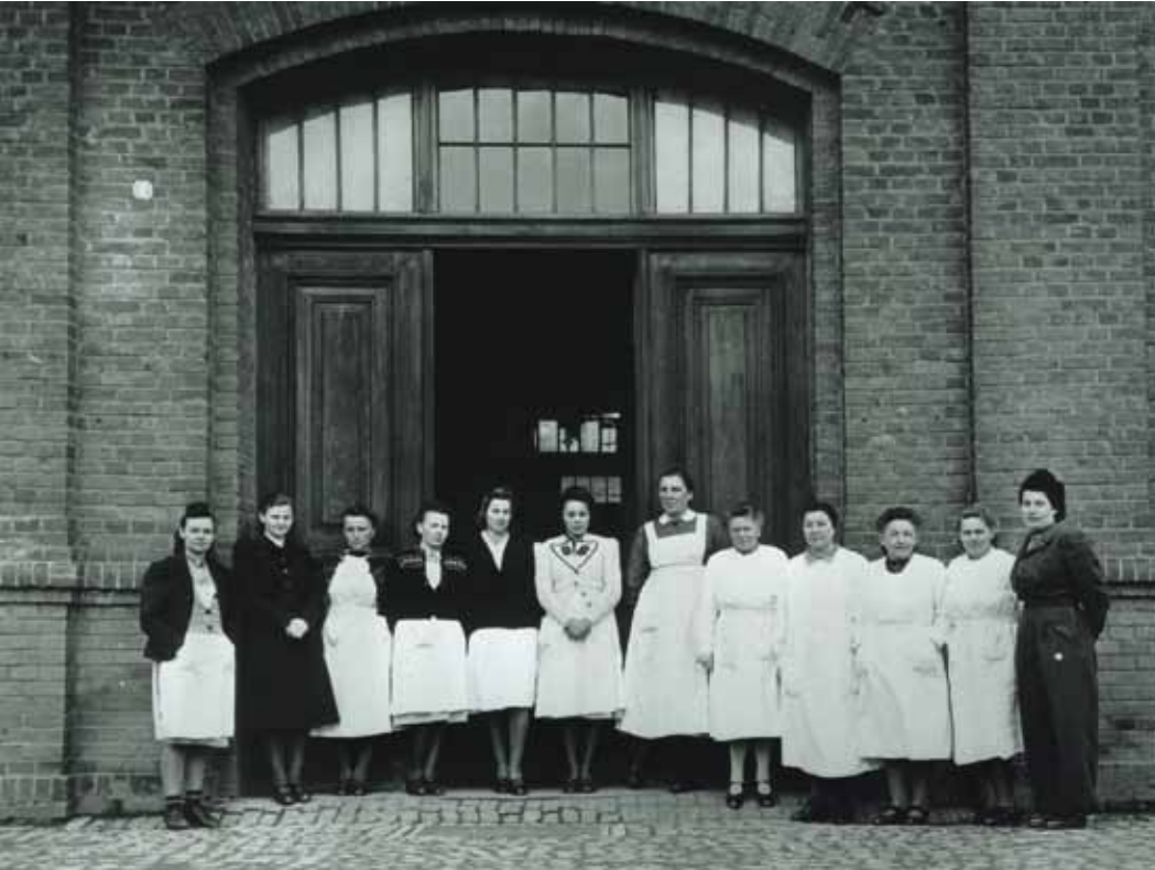
Nursing staff at the Hadamar "euthanasia" centre, Germany