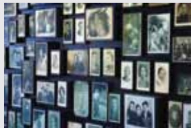
Exhibition of family portraits at Auschwitz-Birkenau State Museum

process. It facilitates the understanding of specificities and differences between events of mass violence. However, while it is educationally valuable to conduct a comparative study of genocides, it is critically important not to attempt a comparison of suffering. Educators should concentrate on the various destructive policies carried out by Nazi Germany and its collaborators when undertaking a study of the Holocaust. When examining other genocides,