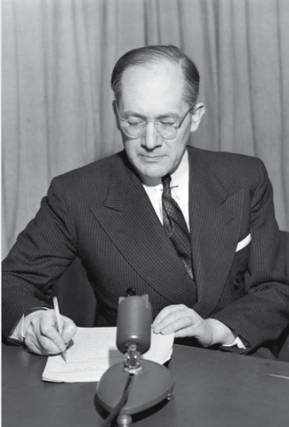
Dr Raphael Lemkin, who coined the word "Genocide"

Regardless of geographical location, all human cultures, over the course of time, have engaged in the killing of other humans. As the power of weapons of destruction has grown, so have the number of people killed by other human beings. Alongside the genocide of European Jewry, Nazi Germany also carried out a genocide of the Roma (a crime sometimes called the Porajmos, "Great Devouring", or Samudaripen, "Great Dying"), a mass murder of the Poles, and a mass killing programme of the disabled. They committed mass murder of more than three million Soviet prisoners of war, killed countless civilians in occupied territories, and murdered tens of thousands more through persecution of political opponents, homosexuals and Jehovah's Witnesses. So traumatic was this assault on human values, a new word was coined during World War II by a Polish-Jewish lawyer, Raphael Lemkin, to describe it: genocide.