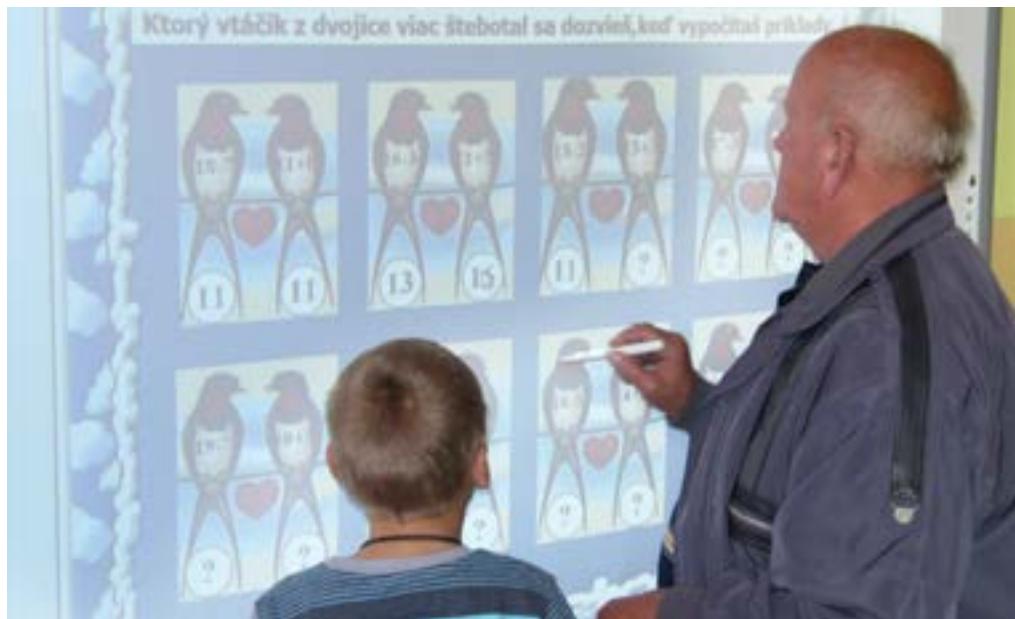
Figure 5.4 Students teaching their grandparents to use the interactive whiteboard

Grandparents often substitute for parents when the latter are too busy with their jobs. Grandparents help their grandchildren with homework and learn together with them. However, normally they miss the opportunity to get familiar with the daily school environment of their grandchildren. Some time ago, the teachers decided to make that happen. During the "Respect the Elderly Month", the second grade students brought their grandparent to the school. Along with the visit, the teachers organized an exhibition of items of daily use from the past. The exhibition was prepared by teachers, students, and other school employees. The showpieces familiarized the students with folk tradition and brought back the old days of the grandparents. Grandparents and grandmothers were invited to the classrooms to see how their grandchildren learn. They had heard about interactive whiteboards from the children and couldn't imagine how they really work. Students were proud to teach their grandparents to use new modern technology and explained them how to use the whiteboards during the lessons. The grandparents tried to use the whiteboards themselves and also shared with students how they learned in schools when they were young. Everyone enjoyed the visit and all agreed that school is much more entertaining and interesting these days.