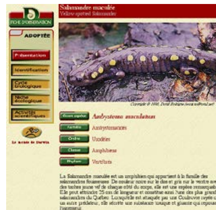
Figure 6.3 Example of a Presentation section

The file had been programmed in a way that enabled students to add information in a variety of formats: texts, tables, photographs, video clips, animation, graphs, distribution maps, hyperlinks (to other sections, to card files of other species, or to various websites), etc. The different sections of the file had been elaborated with the advices from Biologists involved in governmental institutions or ecological associations in Quebec. They covered the questions an expert on a given species of Vertebrates would definitively ask about the animal: its taxonomy, physical description and features, life and reproduction cycles, habitat, family life, predators and preys, typical or peculiar behaviours, usefulness for human activities, characteristics of scientific interest, important research conducted on the species, etc. Once saved and approved, the filled form would be displayed in a neat appearance on the website. Students regularly visited similar files existing on the Internet and quickly appreciated the quality of what they could achieve. This in turn had a convincing effect on the experts about the seriousness of the endeavour, and it induced them to spend significant time interacting with the class through e-mail.