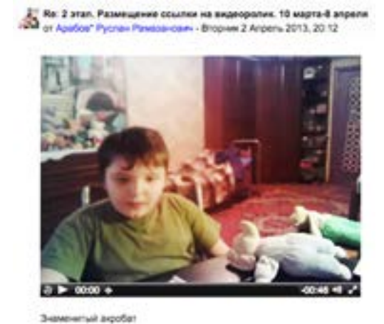
Figure 3.5 A video clip published

The project has the following stages: 1) reading and translation of the original book in class; 2) watching the cartoon in English language; 3) a teaser (brainstorming) that includes greetings to the bear, deciding who comes to Moscow, and inviting the children in English language; 4) students creating their own stories and discussing the cultural realities of Moscow in the lessons of Moscow studies; 5) preparations for cartoon filming, including image design, plot outline, and phrase recording in English