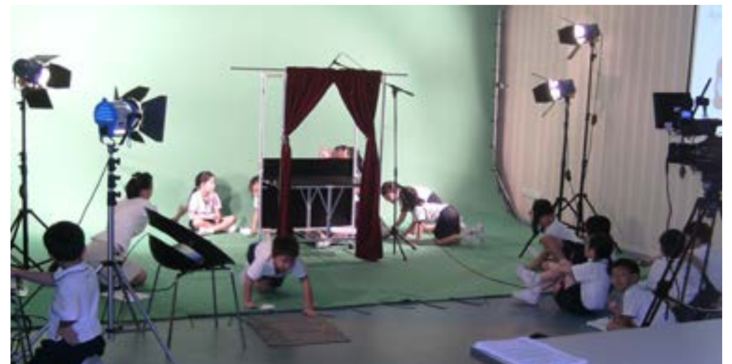
Figure 2.9 Figure 2.9. Students in the studio for their lesson

The school has equipped key learning facilities such as classrooms with Interactive White Boards (IWB), dual projectors, personal learning devices, and wireless connectivity. The classrooms were furnished to allow flexible use of space, enhance mobility of teachers, and encourage various types of interactions. Seating has been arranged in groups, acknowledging the importance of collaborative learning. In addition to building of an appropriate physical infrastructure, the school has successfully adopted the use of open-source software infrastructure to provide essential teaching and learning facilities to teachers and students. The computer ownership programme for all Primary 4 students was in its successful 4th iteration in 2014. These infrastructures formed the ballast for ICT learning, enabling the school to leverage on technologies effectively.