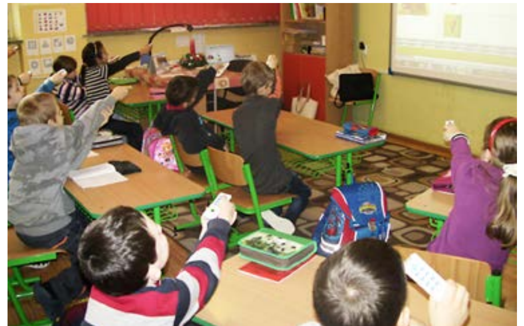
Figure 5.3 Students of the 1 st grade use clickers on a regular basis

At school, students are encouraged to bring their own digital cameras, tablets, e-book readers, and other digital devices. Interactive whiteboards are used on a daily basis; students spend half of the classroom time working with them. Visualizer is used at least during one lesson each day. The computer lab is almost always booked, particularly for the Informatics class, but also for other classes. Students work at least once a month on projects using their notebooks. Digital cameras are used as needed at various lessons. Digital programmable toys Bee-Bot are used in every classroom twice a month, usually during reading and science classes. Tablets are used twice a week, especially in mathematics and science classes.