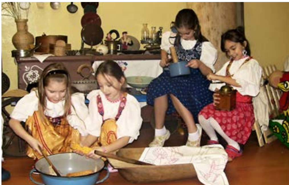
Figure 5.1 School museum of the local folklore

The primary teachers have founded a local folklore museum on their own initiative. The museum is located in the lobby, in front of a group of four primary classrooms. Teachers, parents, grandparents, and other local inhabitants are constantly extending its collection.