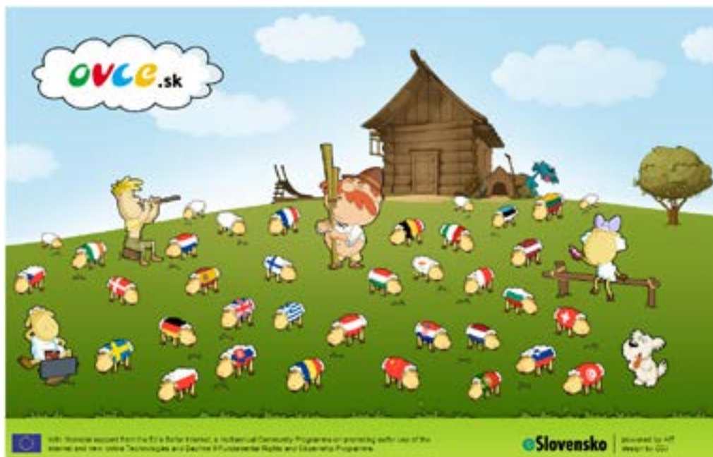
Figure 5.7 Figure 5.6. A project focusing on internet safety designed for young people

The safety of students in the digital world must not be underestimated or neglected. Teachers at Bošany primary school are becoming more demanding about the quality and appropriateness of ICT used in the educational process. Currently, for example, the computer classrooms are equipped with height-adjustable swivel chairs to suit the needs of students of different ages. When purchasing new technologies, the teachers take into consideration their weight because students are allowed to take them home or outside the classroom.