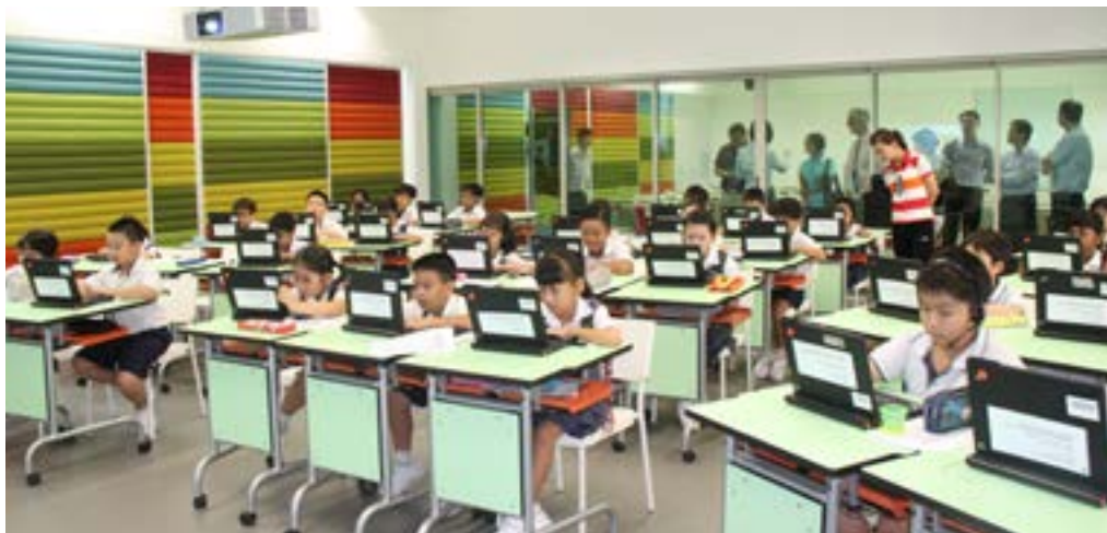
Figure 2.1 One-to-one computing learning environment for students

The school's learning framework is consciously designed to leverage ICT to enhance the teaching and learning process. The ICT implementation includes a hybrid model of computer notebook use (2:1 or 1:1; i.e., two students to one computer and one student to one computer ratio) in a wireless environment, with interactive whiteboards in every classroom, and other relevant tools which support the attainment of the expected learning outcomes in the various school-designed programmes. The notebook computer is chosen because it allows greater mobility.