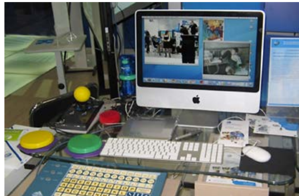
Figure 3.1 Work place with computer and peripheral equipment

The full-time section of the school teaches about 400 lessons daily. Since each classroom, with an area of about 40 square meters, is large enough for seven to eight lessons to be held simultaneously, it is divided into sections with noise-proof dividing fences 1.5 m or 2 m tall. There are a total of 53 mini-classrooms in the school. Each room is equipped with a certain number of computers, depending on the number of students and teachers in class. The rooms also contain peripheral equipment, such as printers, scanners, web-cameras, speakers, interactive whiteboards, and subject and didactic equipment, as well as special computer mice, keyboards, and joysticks adapted for children with serious injuries of the locomotor system. To provide the opportunity for conducting and following remote lessons, each student and teacher has a work area equipped with a computer, printer, scanner, webcam, graphical touch pen, headphones, and Internet connection. In some cases, the working area can be also equipped with digital cameras, sensing devices, robotechnic kits and tools, musical keyboards, etc. For adjustment of the working area on demand, there are assistive mice, keyboards, and Brail printers.