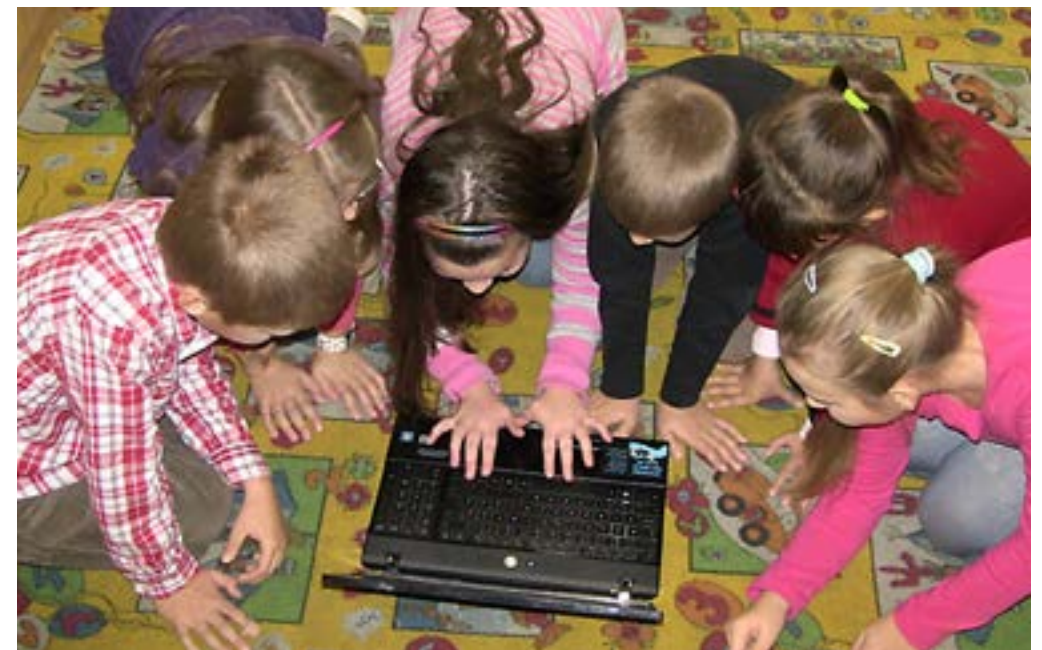
Figure 5.2 A group of students kneeling around the notebook, solving a project task

Based on this initiative, the school started gathering experience and winning participation in national and international projects, including Partners in Learning (Microsoft), Smart School (Samsung), Notebook for every pupil (Microsoft), Universal Curriculum, and various national initiatives to support the development of digital literacy, among others.