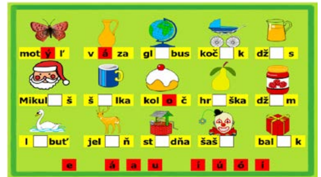
Figure 5.6 Interactive activities designed by teachers in an environment called The Cards.

Teachers in Bošany constantly search for new forms of ICT integration in order to fulfil educational objectives in a safe, attractive, and effective way. They create and apply these methods; then they constantly discuss and observe their influence on students; finally, they evaluate, modify, and improve them. A large portion of the digital content they use has been made precisely by them. They create presentations for students, use different software to prepare worksheets and tests (with students solving them with clickers, for example), and make texts which can be delivered by the LMS system. They also search for different educational activities and programs on the internet, and eagerly use an authoring environment called "The Cards" to create digital interactive activities for students to fill in gaps, search for objects and classify them, and pair them up. The portal for teachers ( www.zborovna.sk ) contains a few thousands similar activities created by teachers and available for free. Students enjoy this kind of interactive activities.