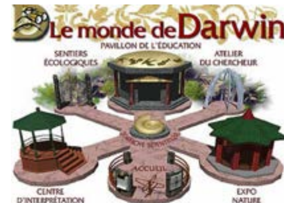
Figure 6.2 Home page of the website

Students could work on their card file on the computer and add new information continuously, but the file would remain hidden from viewers on the Internet until its content and language had been reviewed and validated. Yet that process was gradual, since the file was divided into sections that could be posted independently. On the adoption of a new species by a given class, three copies of the card file were actually created. Only the third copy was open to the public. The students always worked on the first copy. Whenever they estimated that one section was sufficiently developed, they would submit it to their scientific advisor who had the password to their own web file. Some interactions ensued, changes were made where necessary, and when the content was considered satisfactory, the section was approved, and the validated section was transported to the second copy. Again, when the students felt that their wordings and expressions were of good quality, they advised their linguistic expert and interacted with him/her until the text was approved. The new version was finally transported to the third copy, which was open to the public. These procedures enabled the information on the card file to be continuously modified and augmented by students, with the additions made becoming visible only once they were reviewed and validated.