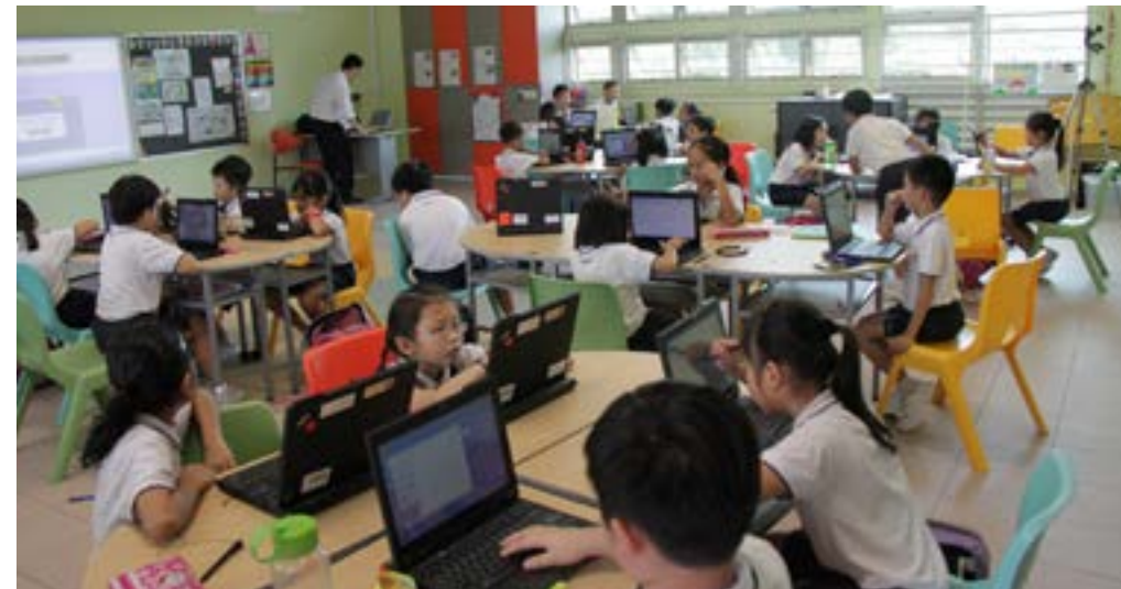
Figure 2.2 One-to-one computing learning environment

The school took a progressive approach by providing the necessary computing device (i.e., notebook computers). The Beacon one-to-one (B121) computing learning environment programme provides each student in Primary 1 to 3 with one school-owned computer, and subsequently requests students of Primary 4 or above to procure their own notebook computers. The conceptualisation of this two-tier, one-to-one model was developed with the notion of sustainability in mind. Students procure their own digital learning device for extension of their learning beyond the school. Financially challenged students apply for a special computer ownership scheme where more than 85% of the cost of a full-featured notebook computer and Internet broadband subscription (3 years) is subsidised by the Infocomm Development Authority. This programme and scheme also act as a social leveler for these students. Since then, a number of primary and secondary schools have also embarked on similar programmes, and the question of whether primary school students could use and own their own personal computers has never been asked again.