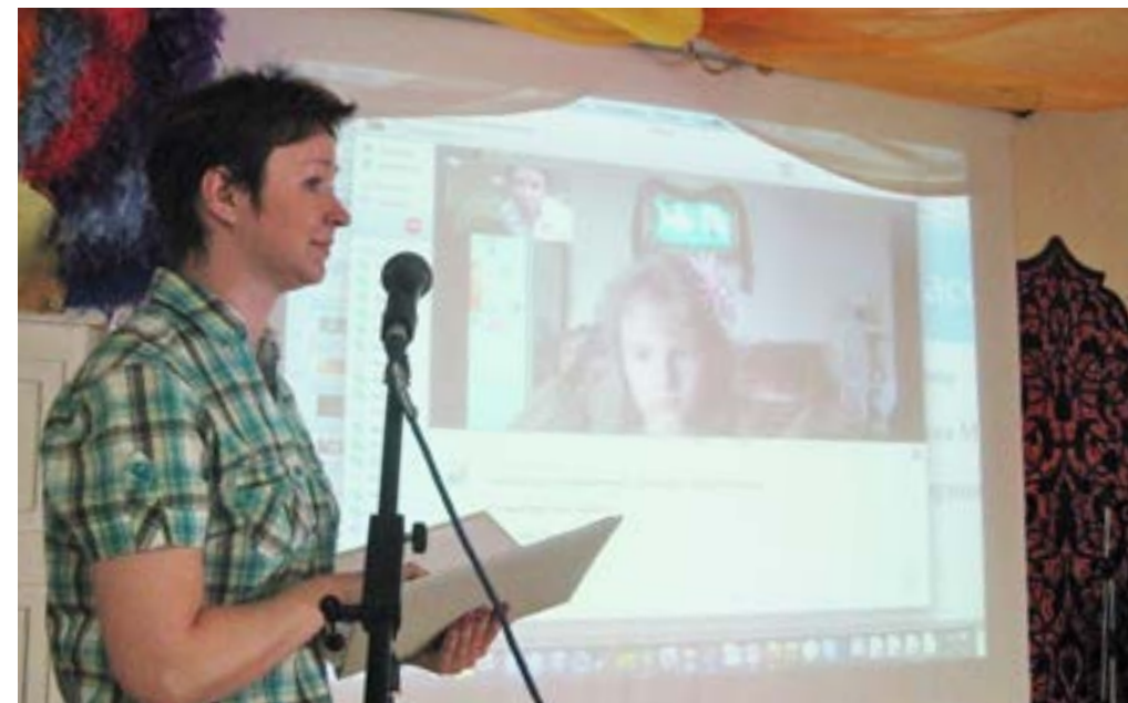
Figure 3.7 A student participating in the project festival remotely

The school has a tradition to hold a project festival annually. The 2013 festival held in the primary school revealed that pupils were able to choose a topic to illustrate their understanding and knowledge of the field they were interested in, and that they could choose the appropriate ICT tools to solve the tasks easily.