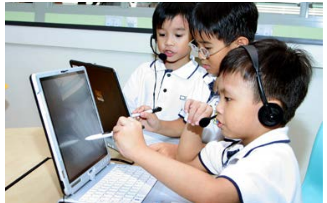
Figure 2.6 Students adding their personal voices into their digital stories