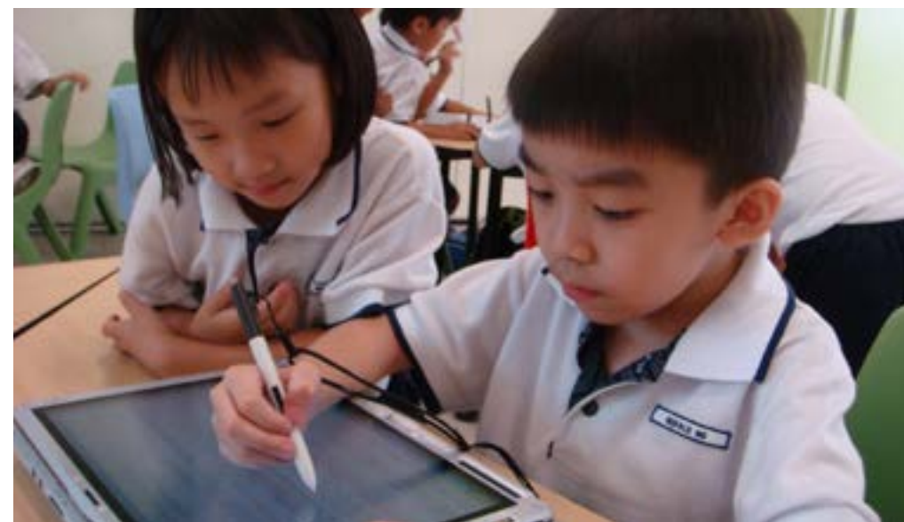
Figure 2.3 Students using tablet PC for Digital Storytelling

Since 2008, several interesting and innovative teaching pedagogical practices have been developed. For example, the pedagogical approach of digital storytelling —where students create their own digital stories using text, images, sound and their recorded voices for language learning— is integrated as part of the languages curriculum. Students from Primary 1 to 3 create their own digital stories in their language classes (both in English and in their mother tongue languages, such as Chinese, Malay, and Tamil). The digital storytelling approach is the school's signature approach in the integration of ICT into the learning of languages.