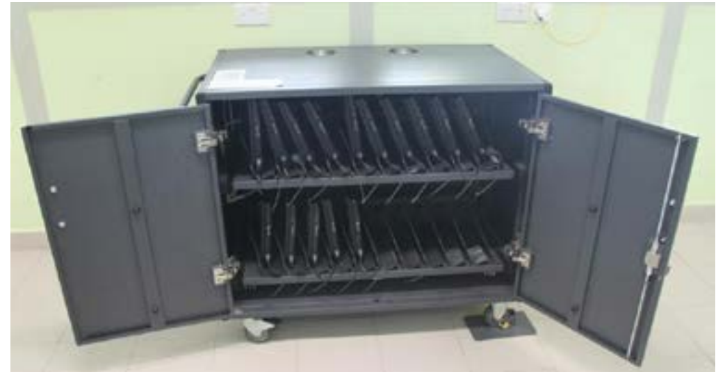
Figure 2.8 Mobile storage cart for storage and charging of the notebook computers in the classrooms

A wide range of technological tools were used to integrate ICT into teaching and learning. In terms of hardware, the school started implementing its one-to-one computing efforts from 2008, when it opened its door to its first cohort of Primary 1 students. Each classroom was equipped with an interactive whiteboard and two LCD projectors. During the initial months in 2008, the laptop computers were stored and charged in wooden mobile units. Each unit could only house six laptops. The mobile storage and charging units were initially shared among the eight Primary 1 classes. A wireless internet environment was also set up in the classrooms to further support the one-to-one effort. As initial usage numbers of the laptops was encouraging, the school subsequently equipped all Primary 2 and 3 classes with computers at a one-to-one ratio, and the Primary 1 classes at a two-to-one ratio. Efforts were also made to redesign earlier versions of the mobile storage unit. A more functional mobile storage unit, still with charging capability but with a bigger storage capacity—able to house 20 laptop computers per unit—was co-developed with the industry partner.