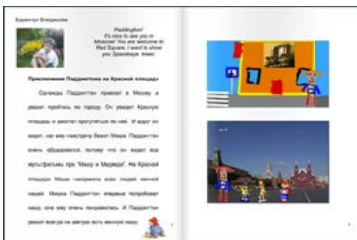
Figure 3.6 A book chapter created by the students

The learning outcomes are divided into groups according to the Federal State Education Standards. Subject-related outcomes include: 1) the removal of barriers to work with unadapted text; 2) growth of vocabulary; 3) practicing speeches and new grammatical structures; 4) developing skills to conduct a dialog in the studied language; and 5) gaining updated linguistic and cultural knowledge. Meta-subject outcomes include: 1) organized group work using Google documents; 2) teamwork skills and the creation of a collaborative atmosphere with mutual help among students; and 3) the involvement of their own life experience as a basis for the story creation. Pedagogical and student-centred outcomes include: 1) the acceptance of students' basic international values and the possibility to conduct intercultural dialog; 2) the formation of impulses for self-development, self-reflection, self-checking and self-assessment; 3) the development of kindness and emotional intelligence, as well as the understanding of and empathy toward other people; and 4) the formation of tolerance and a culture of international communication, as well as a respect for the language, cultural traditions, history, and the way of life of the country of the studied language. The final products include a book in both digital and paper formats, and also a cartoon.