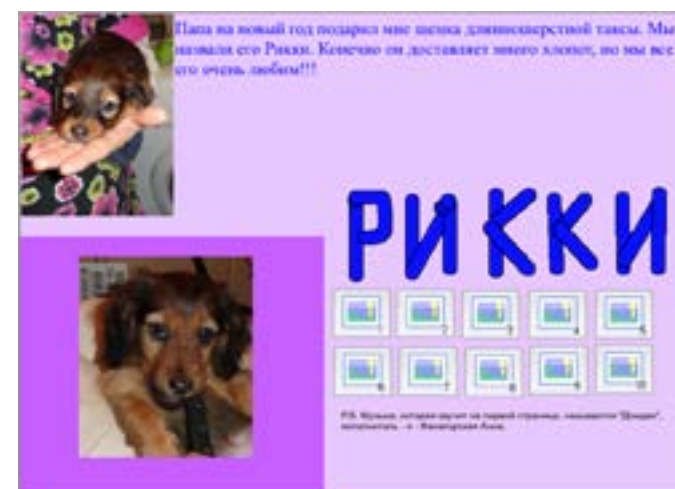
Figure 3.8 Multipage album