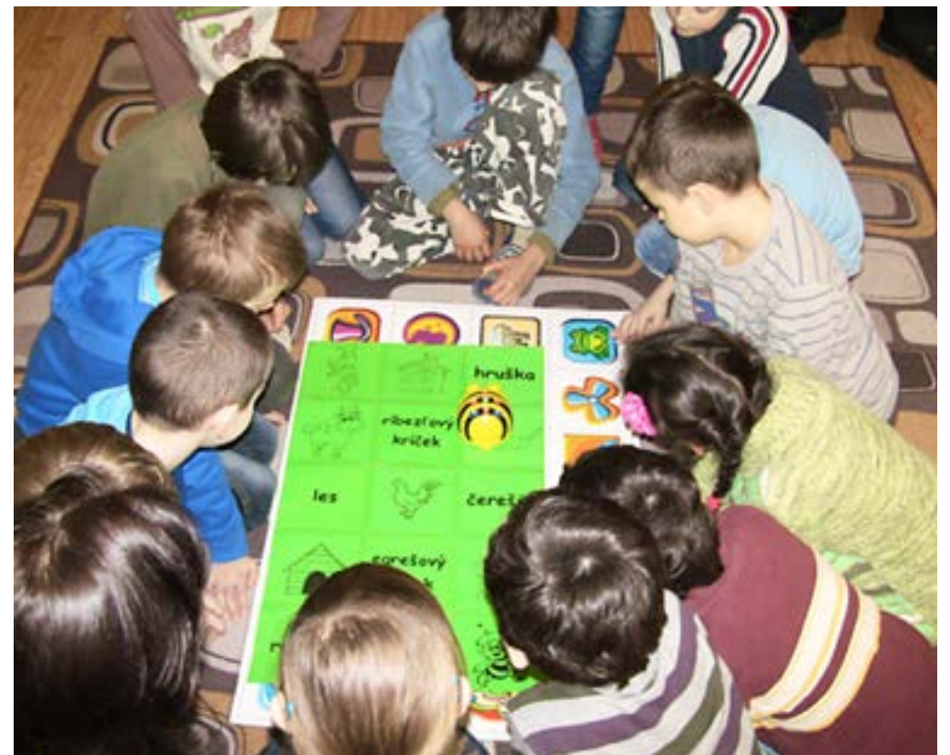
Figure 5.5 Digital programmable toy Bee-Bot for developing reading skills

At first, students used pen and paper to take note of the commands. One student moved the Bee-Bot on the mat; another one in the group decided which command to enter to make the Bee move along the track. Later they worked in groups to play a game of riddles. First they noted a sequence of buttons to push on the paper and the other group guessed the path of the Bee. After making the guesses, they checked if the other group was right by entering the commands and releasing the Bee. The biggest problem was working with the turning commands, since students expected the bee to move to the next field as well. However, they soon discovered that another command was needed to move the Bee to the next field. The teachers didn't even notice when and how students established their own system to program the Bee without pen and paper. They moved the Bee over the mat and simultaneously they pushed the buttons. All worked well, and they had a lot of fun with Bee-Bots, which have been used many times during various lessons. When they play with them, they don't even realize the vast amount of skills and knowledge they have acquired. Even the weaker students experience success.