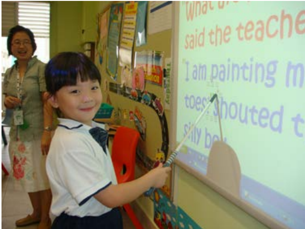
Figure 2.10 Student and teacher using the Interactive Whiteboard