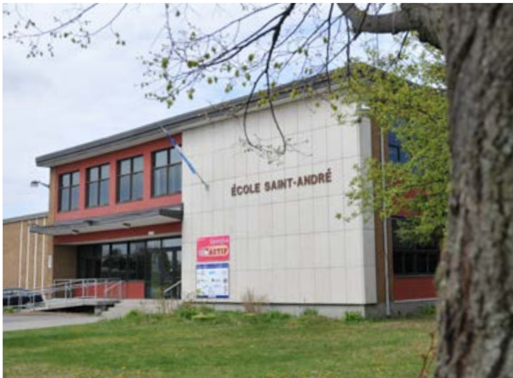
Figure 6.1 Saint-André school in Granby, Québec