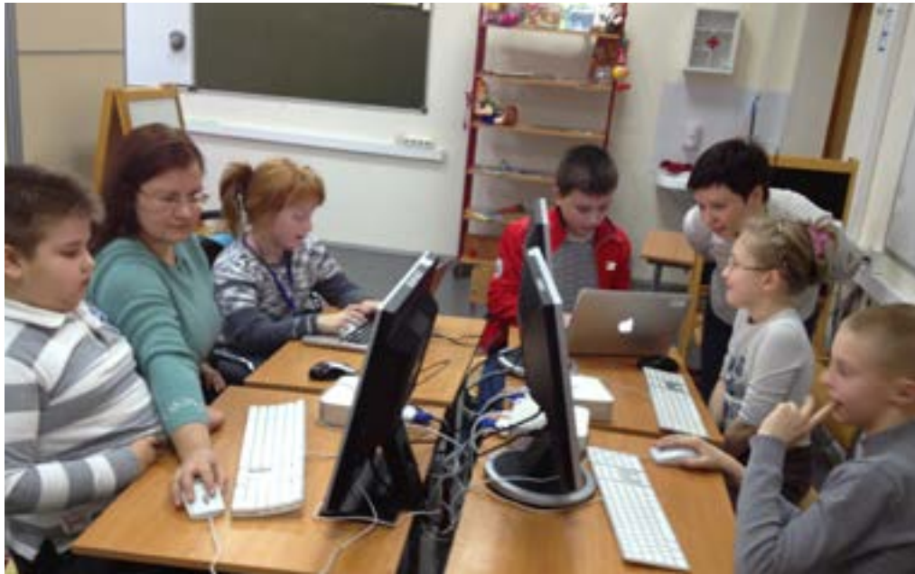
Figure 3.4 A group of students working together

In the fourth and final step, the children simulate the motions of the characters set on film in front of the backdrop. Each motion is shot with iStopMotion, a soundtrack is added, and then the cartoon is ready. This project requires the constant support from the subject teachers, which is made possible throughout the whole project via the forum on the school website.