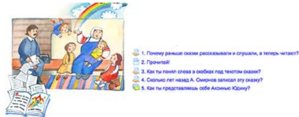
Figure 3.2 Screen capture of the research on peculiarities of folk tales

The first step of the project is to conduct a series of lessons on literary reading based on the website contents related to the research on peculiarities of folk tales.