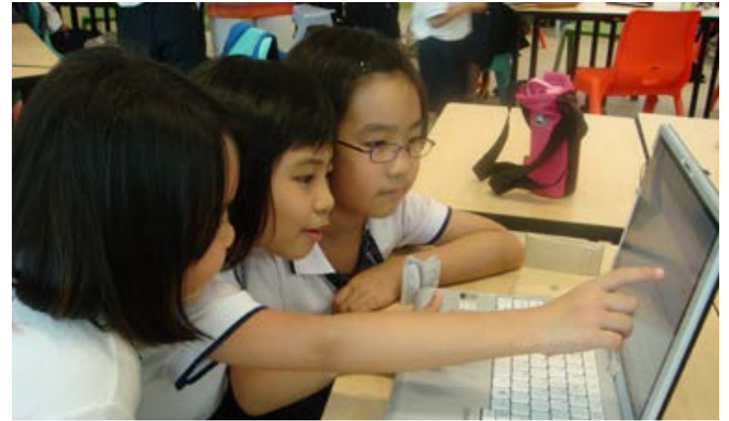
Figure 2.5 Students creating their digital stories

Digital storytelling is simply the application of technology to the “ancient” experience of sharing personal narratives (Armstrong, 2003). However, the dynamic nature of digital storytelling lies in the fact that learners undergo several cognitive processes that underpin learning a variety of skills, from verbal linguistic skills to spatial, musical, interpersonal, intrapersonal, naturalist, and bodily-kinaesthetic skills (Lynch & Fleming, 2007). To produce a digital story, a learner needs to write a script, include suitable photographs or clipart, insert music that appeals to the story, and add recorded voices that narrate the experiences to a target audience. By creating personal narratives, learners become active creators of multimedia (Ohler, 2008) because the “new media narrative” allows for self-expression in ways not traditionally supported by most school curriculum (Banaszewski, 2005). Furthermore, according to Levin (2003), the new technology that students currently have access to provides them with opportunities to communicate in ways that were not possible ten years ago. With technology, learners working on digital storytelling can articulate their views creatively in the form of images, video, or sound, and can share their stories with the rest of the world.