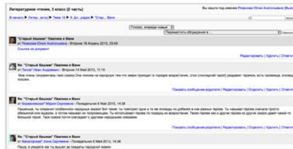
Figure 3.3 The learning forum

The second step is to develop their own text imitations of folk tales. The work is conducted in small groups, and the collaborative works are gathered using a google e-document. Students can work at the school or remotely at home. Through video conferencing and as far as they have the editorial access to the e-document, students can discuss, write collectively, edit the text, split it into episodes according to the learning tasks, etc. The learning forum helps the members of the study group to articulate their opinions, gives them observations, and provides them with recommendations for the improvement of the text.