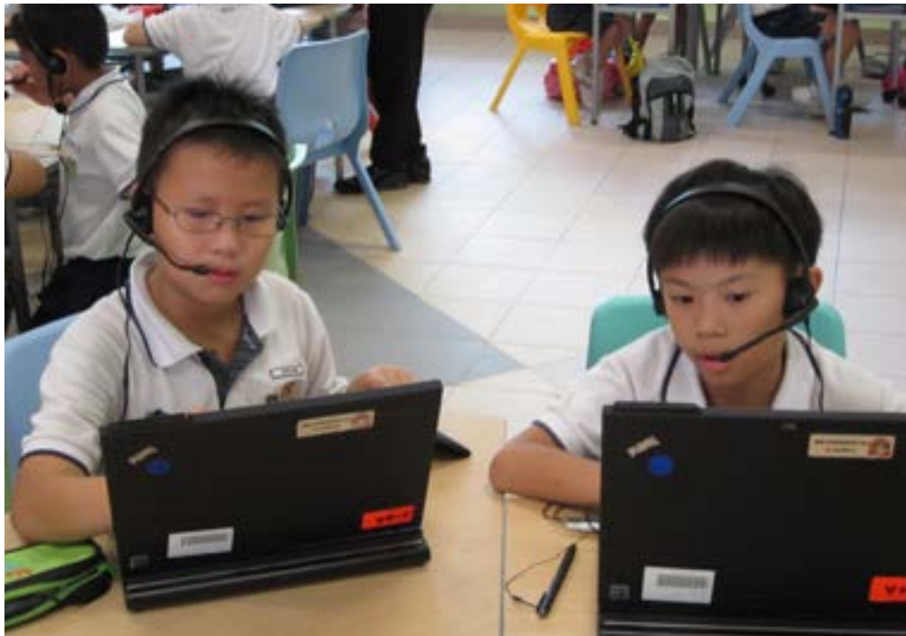
Figure 2.4 Students using notebook computers during their lessons

Storytelling is one of the oldest art forms that is inextricably intertwined with learning. Both children and adults learn more effectively through storytelling than in any other way (Tomlinson, 2003). Stories have been found to engage learners and facilitate learning through unconscious processes (Morgan & Rinvoluceri, 1983). By telling a story, learners reflect on what they know, examine their views, and record their own personal experiences. Since storytelling enables learners to express themselves and make sense of the external world (Heo, 2004), it may be used to assess learning goals. In fact, with digital tools, it is even easier to share, revise, and critique stories and learn from one another. Several researchers have studied using technology (such as word processor) to write a story and employing communication tools to share it among learners (Fusai, Saudelli, Marti, Decortis, & Rizzo, 2003). This practice of using personal digital technology and combining different media (Ohler, 2008) to tell a personal story is commonly known as digital storytelling. Hull and Nelson (2005) define digital storytelling as a form of multimedia that comprises images and segments of video with background music and a voice-over narrative.