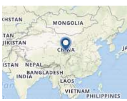
Data © OpenStreetMap Design © Mapbox

1,383,337,000 (2015) 185,885,000 (2015) 40.1 (2015) 0.68%