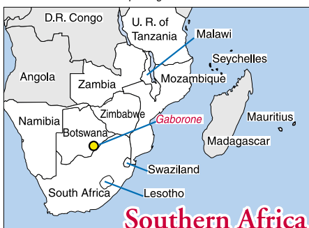
Southern Africa: Participating Countries

Decision-makers and experts in technical and vocational education and training (TVET) from twelve Southern African countries (Botswana, Lesotho,