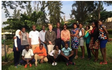
Students and Teachers in Rwanda Review and Validate the UNESCO Freedom of Expression Toolkit for Use in the National Context