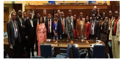
East African participants benefit from listing, funding and capacity-building during the 11th session of the Intangible Cultural Heritage Committee