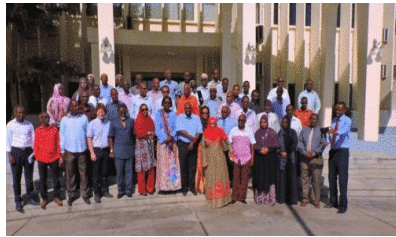
Djibouti examines its efforts to promote the creative industries and the diversity of cultural expressions