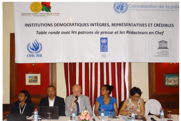
15 Dec 2016: Roundtable with media owners and editors on the importance of investigative journalism in Antananarivo, Madagascar