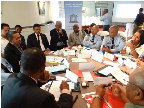
14 Dec 2016: Dialogue session between police forces and journalists in Antananarivo, Madagascar

UNESCO and the Ministry of Education-Education for Sustainable Development (ESD) core team held a 2- day meeting to collectively develop an action plan that will guide the ESD policy implementation at the national and county levels. After completion of the action plan, the next steps will entail capacity development of the county ESD focal persons to ensure effective and efficient implementation of the ESD policy at county levels with an oversight provided by the Ministry of education at national level. UNESCO will provide technical support in the development of the Information, Education and Communication (IEC) materials that will help in the training and dissemination processes.