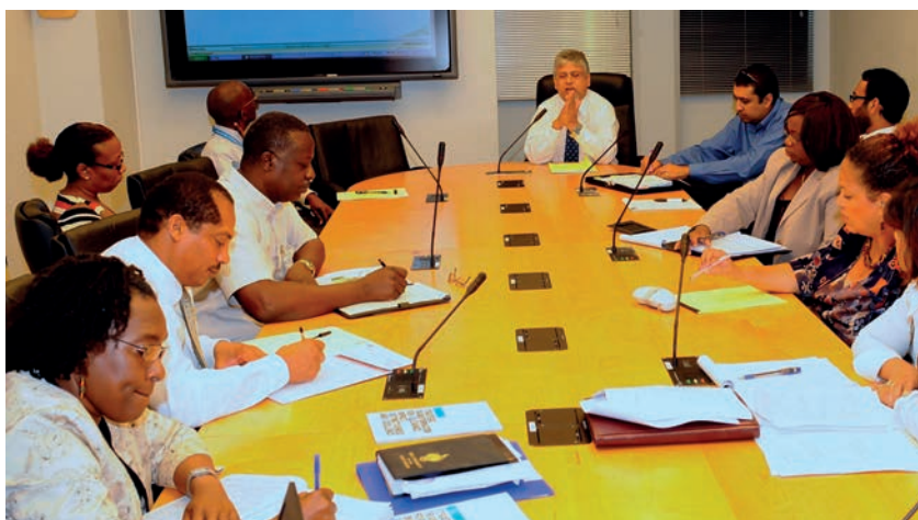
Meeting with heads of administrative units at UWI

The overriding dilemma is the complex array of forces that need to make wealth generation and development happen in any national context. Tertiary education alone will not make development happen; but development in the knowledge era cannot happen without tertiary education. A sustainable tertiary education system is a necessity in a small state for that state and its citizens to participate in and benefit from the global knowledge economy. Yet one needs a thriving economy to generate the wealth necessary to fund a tertiary system sustainably. This will be a continuing dilemma which small states will have to resolve with creativity, enterprise, and innovative solutions.