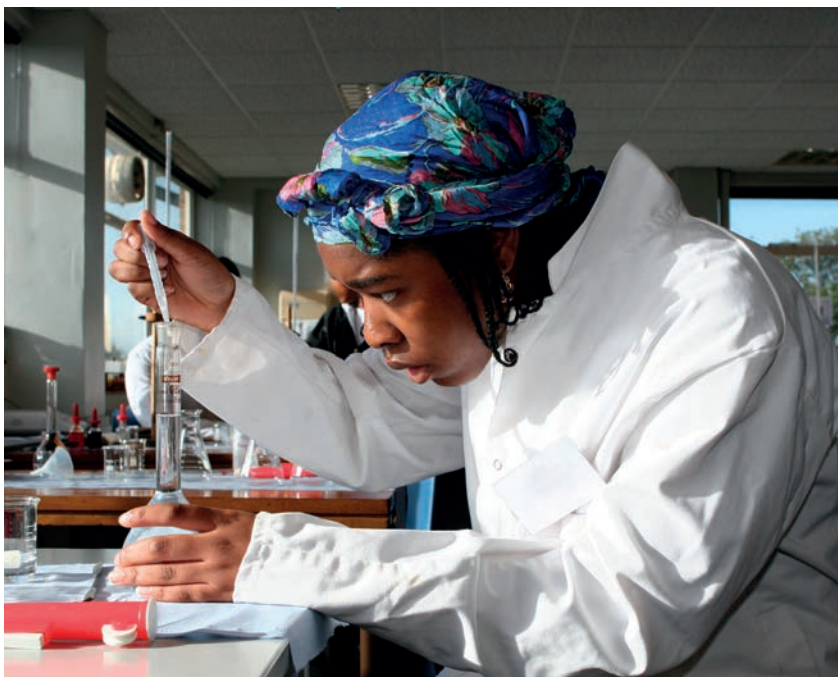
A student doing lab work in a chemistry class

form of educated and competent employees as does the public sector, and the nation benefits from human capital appreciation not only in its economic impact but also in terms of democracy. This point of view might legitimize cost sharing through fees, contributions and taxation. A challenging issue, however, would be to determine the amount, the proportion of respective shares, and to develop a framework supportive of a mutually acceptable sharing arrangement. This particular challenge needs to be addressed by each individual state in its own way.