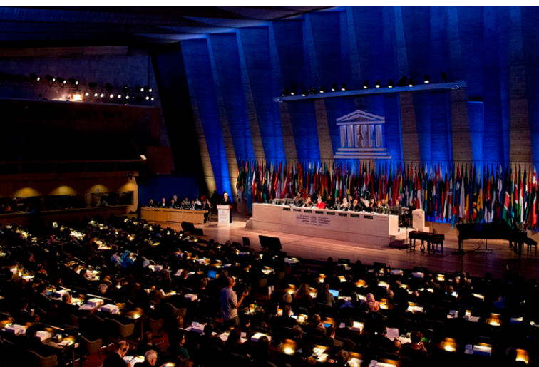
UNESCO 37th General Conference opening ceremony, 5 November 2013

What has already emerged from the consultation is clear recognition that education matters – by February 2014 almost 70% of the 1,465,000 participants in the My World UN Global Survey had ranked education as their first priority. In fact education has been no. 1 of the 16 priorities ever since the survey was launched. But exactly how education will feature in the post-2015 international development agenda is still up for debate.