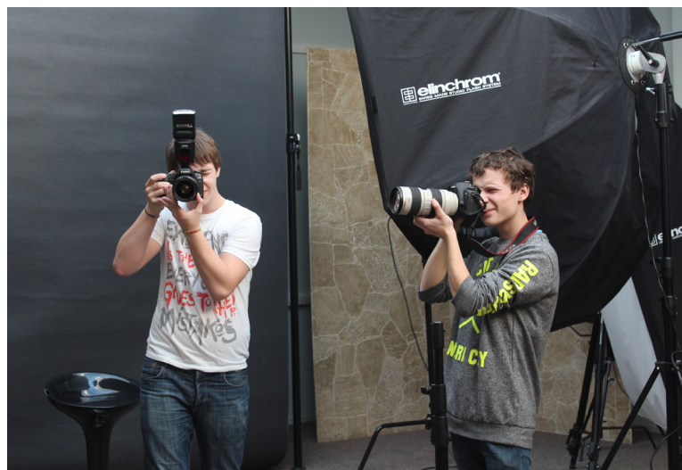
Study visit to College of Automation and IT #20 during UNEVOC regional forum in Moscow: Photography students

Held over two weeks, these virtual events are a way of raising awareness on important issues and launching new debates. “ They help us to capture the wealth of knowledge and expertise of UNEVOC Network members more systematically, to synthesize it and draw conclusions we can refer back to, ” says Shyamal Majumdar, Head of UNESCO-UNEVOC.